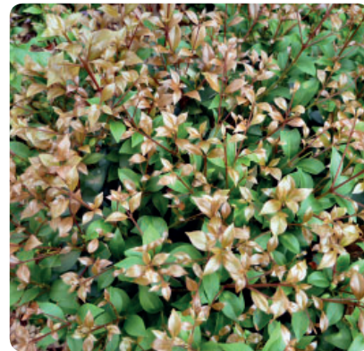
Acmena Allyns magic