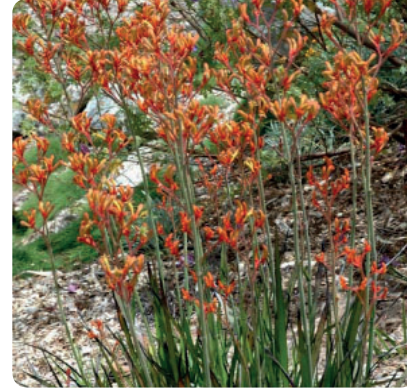
Anigozanthis Bush Ranger