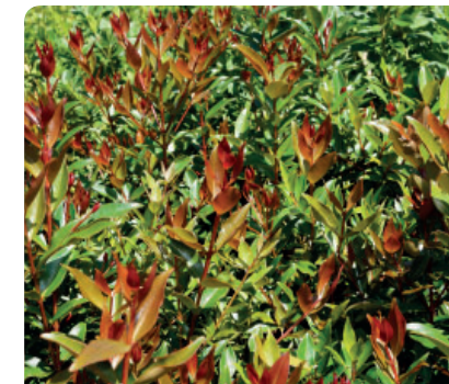
Metrosideros 'Fiji Fire'