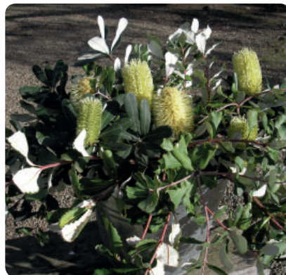
Banksia integrifolia Roller Coaster