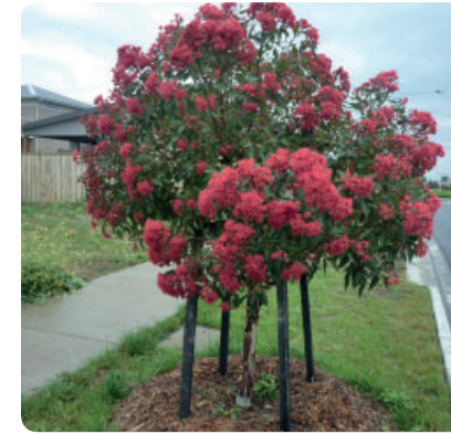
Corymbia ficifolia cultivars