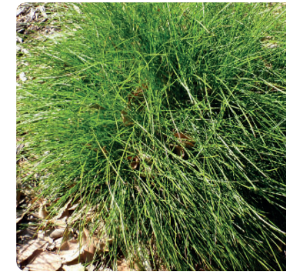
Lomandra Little Con