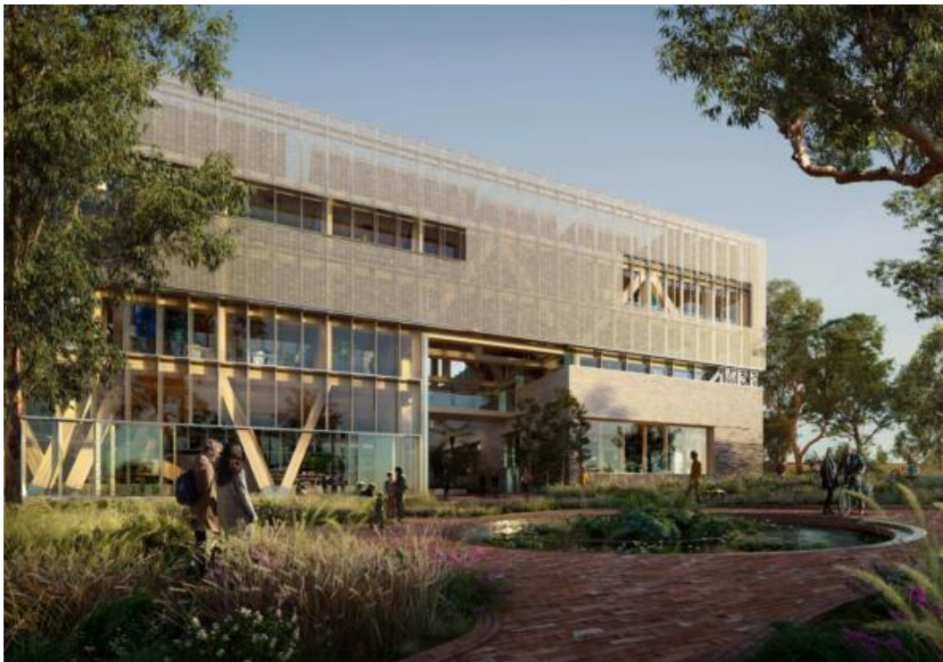
Figure 1 - View of AMRF Building 2 from AMRF Park

The site is located on the 215 Badgerys Creek Road, Bradfield as a part of the proposed Bradford City Centre.