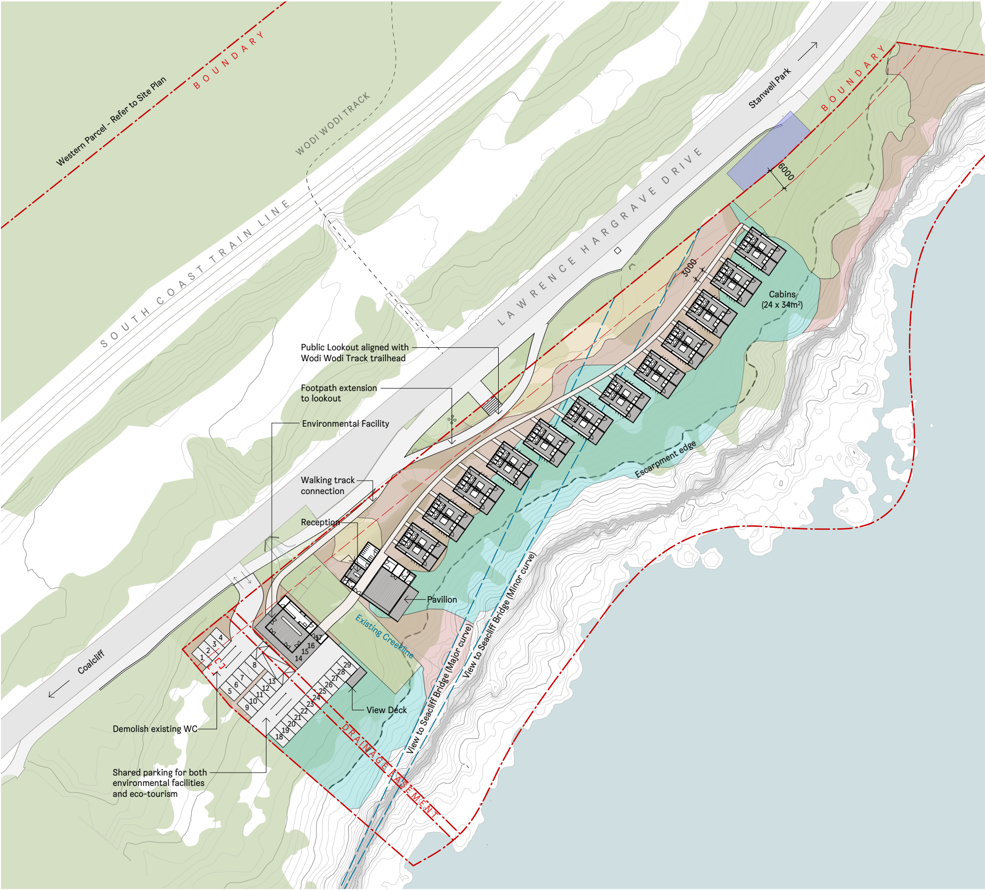
SITE PLAN | 1:1000