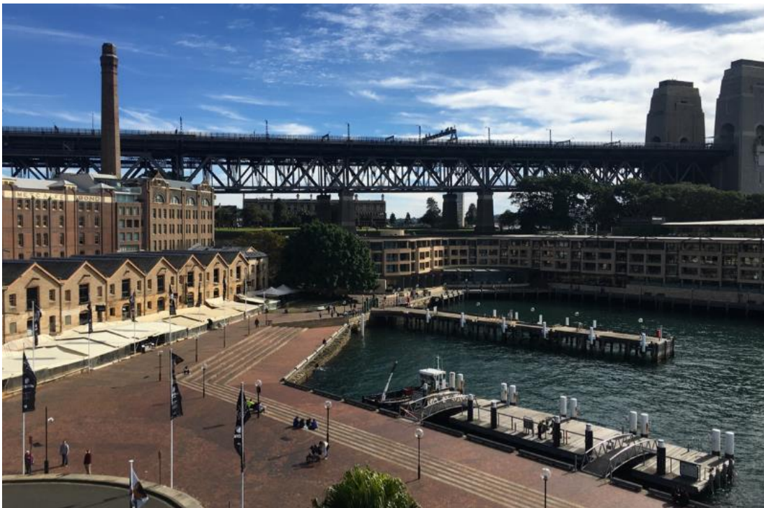
Figure 2: View north west across the hard-paved area, promenade and Campbell's Cove towards Campbell's Stores and the Metcalf Bond Store building to the left and the Park Hyatt and Sydney Harbour Bridge to the right

The OPT building is identified as a heritage item on the Sydney Ports Corporation section 170 register. The Rocks Heritage Conservation Area is identified as heritage item on the Sydney Harbour Foreshore Authority's (SHFA) section 170 register. The site is also located within the buffer zone of the World Heritage listed Sydney Opera House for views and vistas.