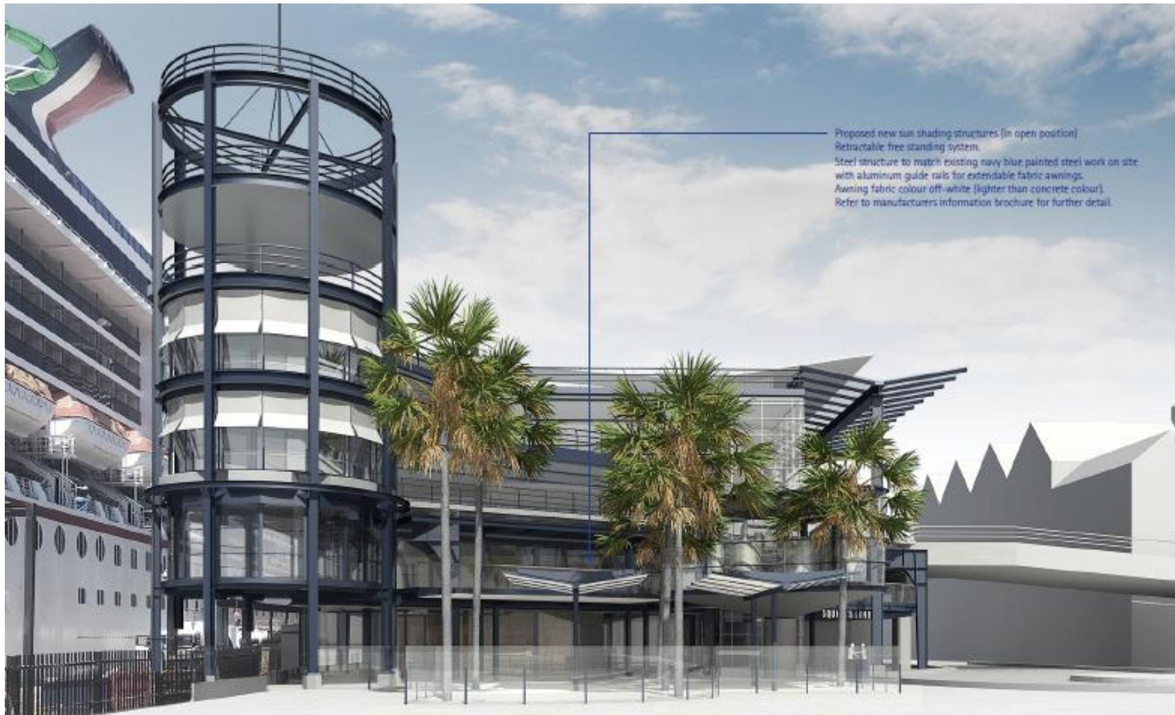
Figure 4: Proposed shade structures in outdoor dining area and awning on northern façade – north elevation