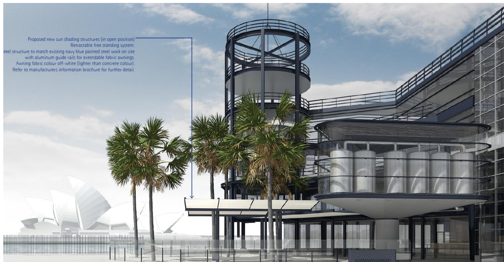
Figure 3: Proposed shade structures in outdoor dining area and awning on northern building facade – west elevation