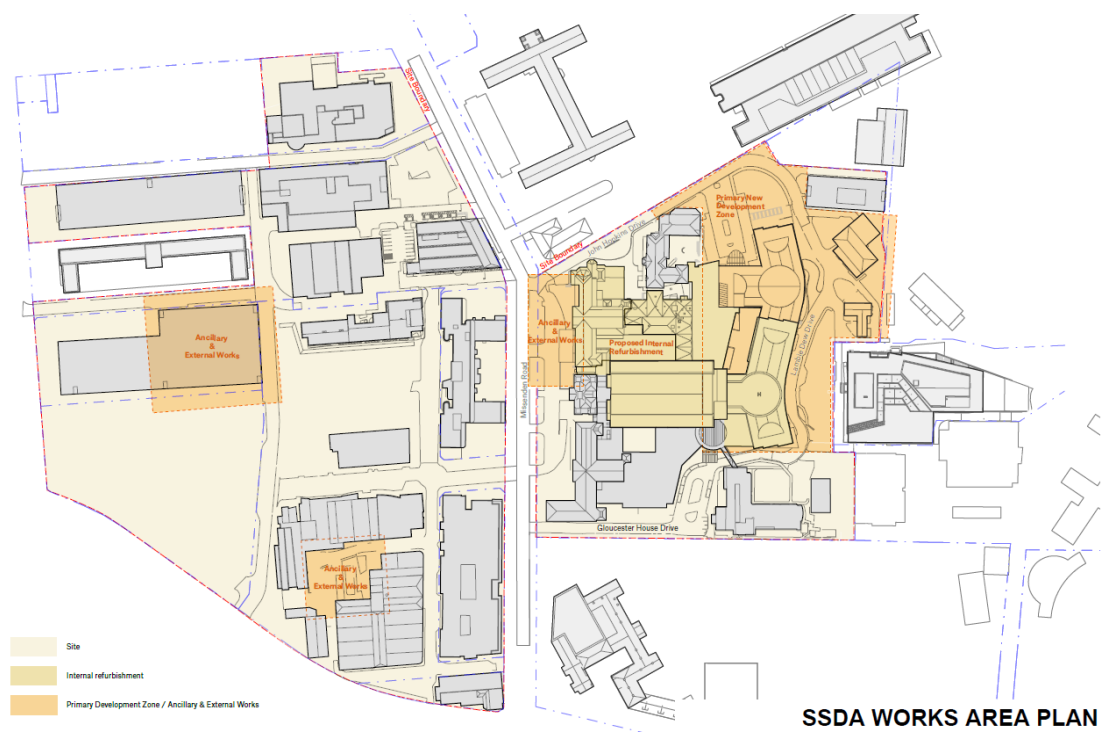
Figure 4 Site Layout Plan showing the Proposed Development Zones

Refer to the Site Layout Plan prepared by Bates Smart Architects at Figure 4.