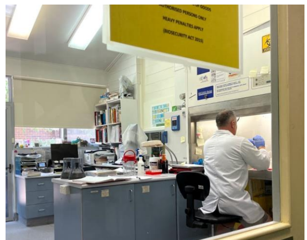
Picture 2 Laboratory