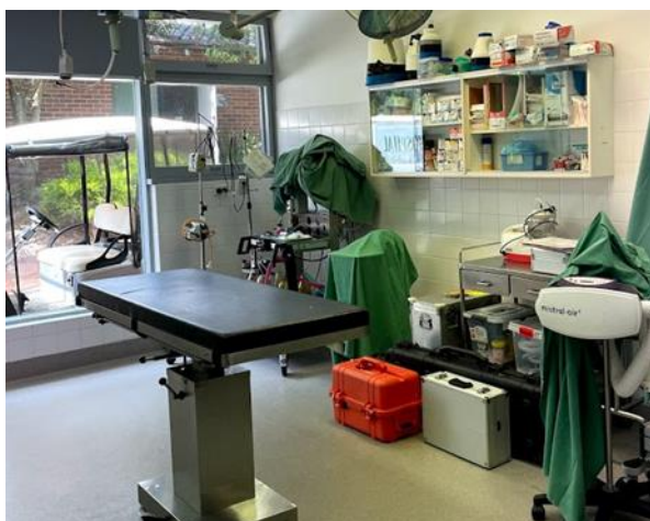
Picture 1 Surgery