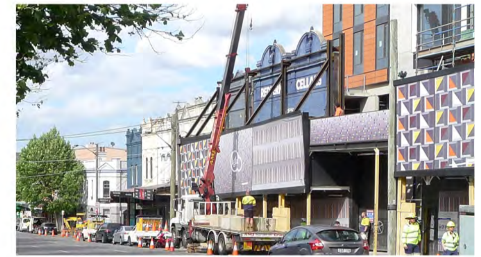
3 VIEW TOWARDS SITE FROM REGENT ST