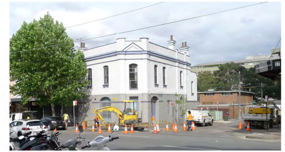
2 VIEW TOWARDS SITE FROM CNR MARIAN ST AND REGENT ST