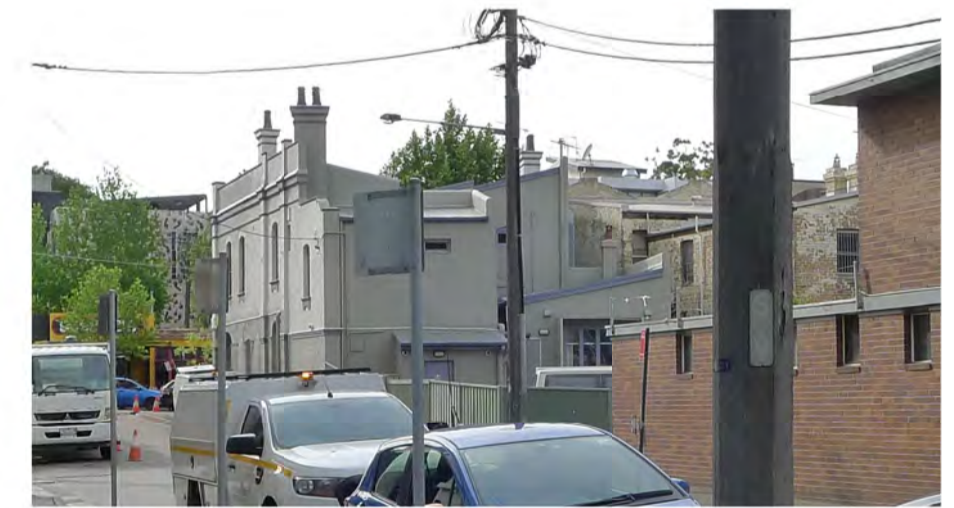
4 VIEW TOWARDS SITE FROM CNR MARIAN ST AND GIBBONS ST