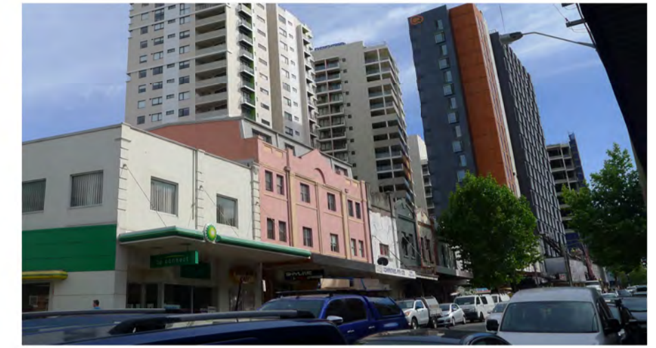
1 VIEW TOWARDS SITE FROM CNR MARGARET ST AND REGENT ST

ORANGE SHADING DENOTES CITY OF SYDNEY LEP 2012 HERITAGE ITEM