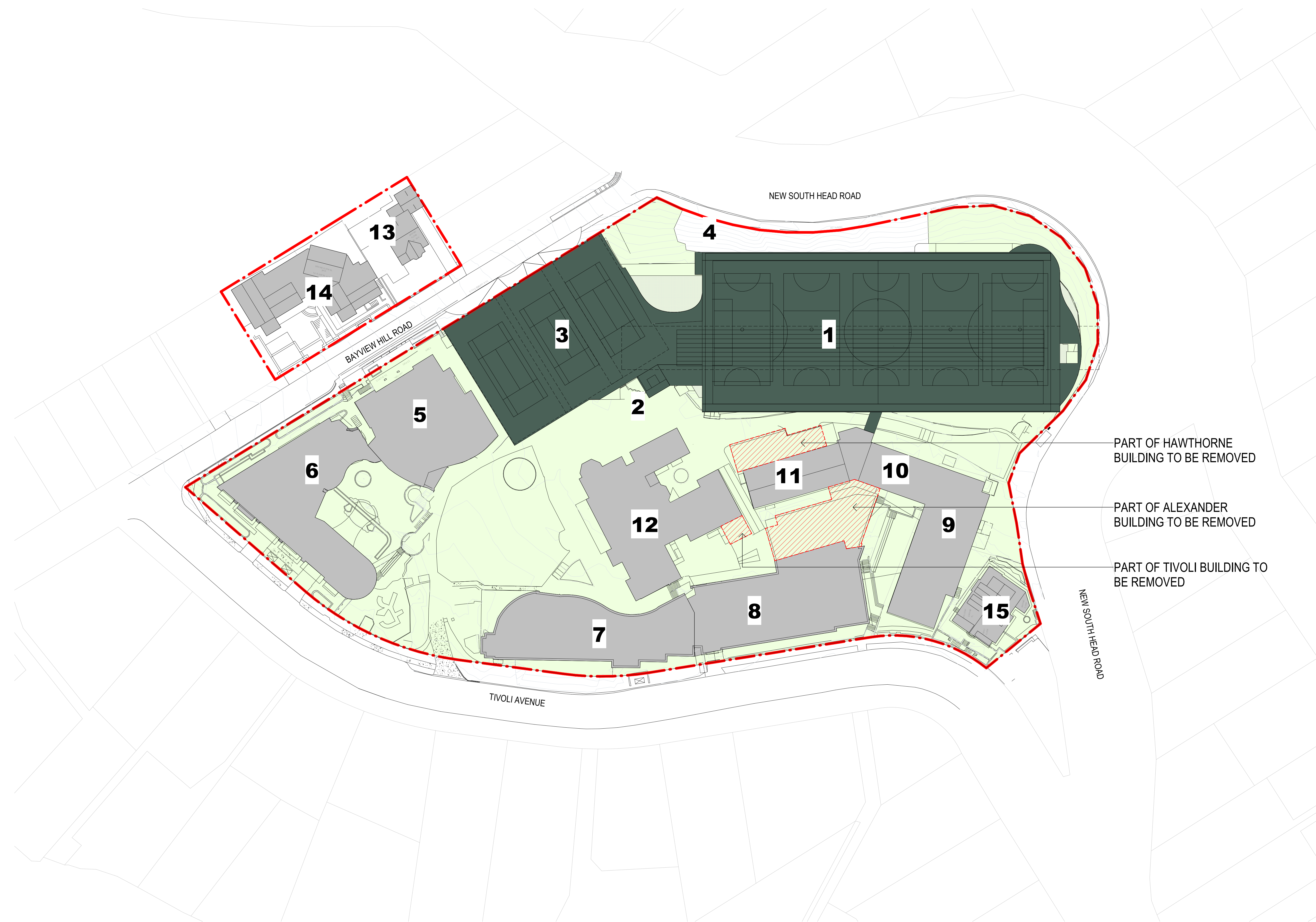
1 CONCEPT PLAN PROPOSAL 1:500