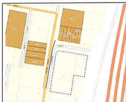
Map showing location of heritage items (brown) and the location of the subject site (dotted in blue).

The subject site is not heritage listed, nor is it located within a heritage conservation area.