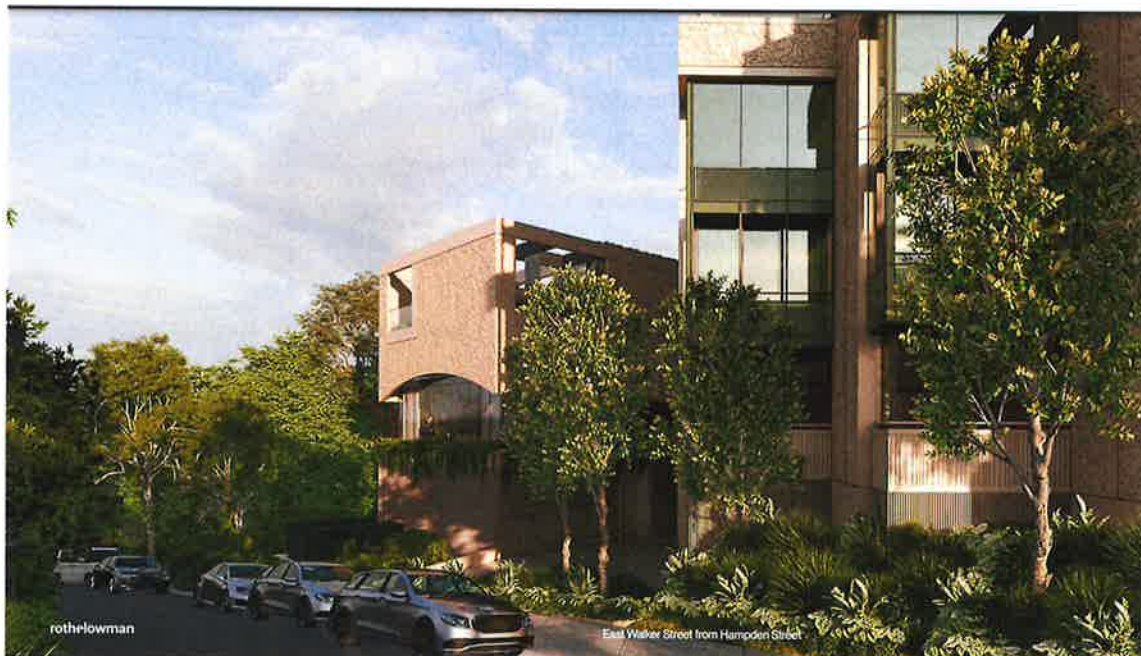
View from Hampden Street looking south-east towards the proposed gym building. The substation kiosks and extent of hardscape are not clearly shown.

The northern setback of Building B2 requires softening with landscaping as it will be hardened by the two substation kiosks, the stormwater pit and driveway. The photomontage below does not adequately portray the likely outcome.