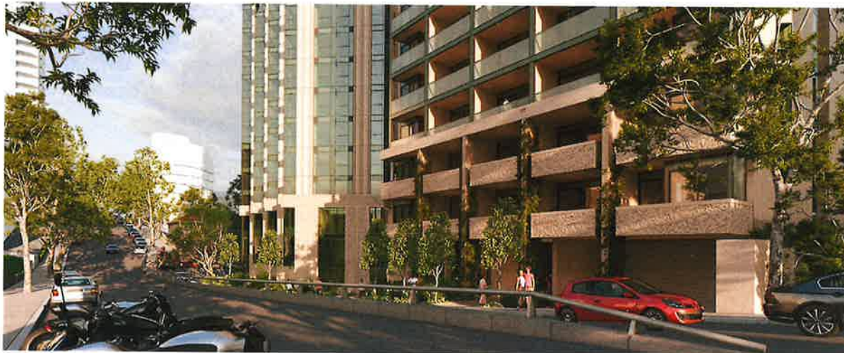
View of the proposal from Walker Street south-west of the site (Rothelowman Architects)

The montage below illustrates the contrast between the form of both podium and tower in Building A (to the right) and Building B1 (to the left). What seeks to unify the two buildings is the use of the stamped materials in the same colour at podium level and hard and soft landscaping of the ground plane. Deeply recessed balconies in Building A should provide adequate summer-afternoon shade (also affected by other buildings to the west of Walker Street), whereas orientation and materials provide arguably more effective environmental performance for the western façade of Building B1. The sawtooth façade of Building B1 and the flat face of Building A still mark them as distinct from one another, and the recommended above podium setback increase to 3.0m will assist in softening the appearance, bulk and scale of Building A.