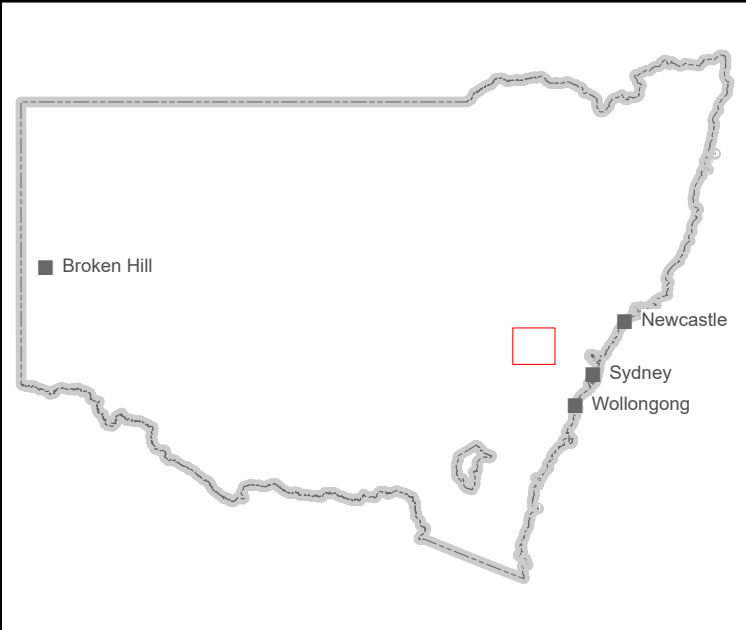
DIAGRAM: SSD5602 - 3