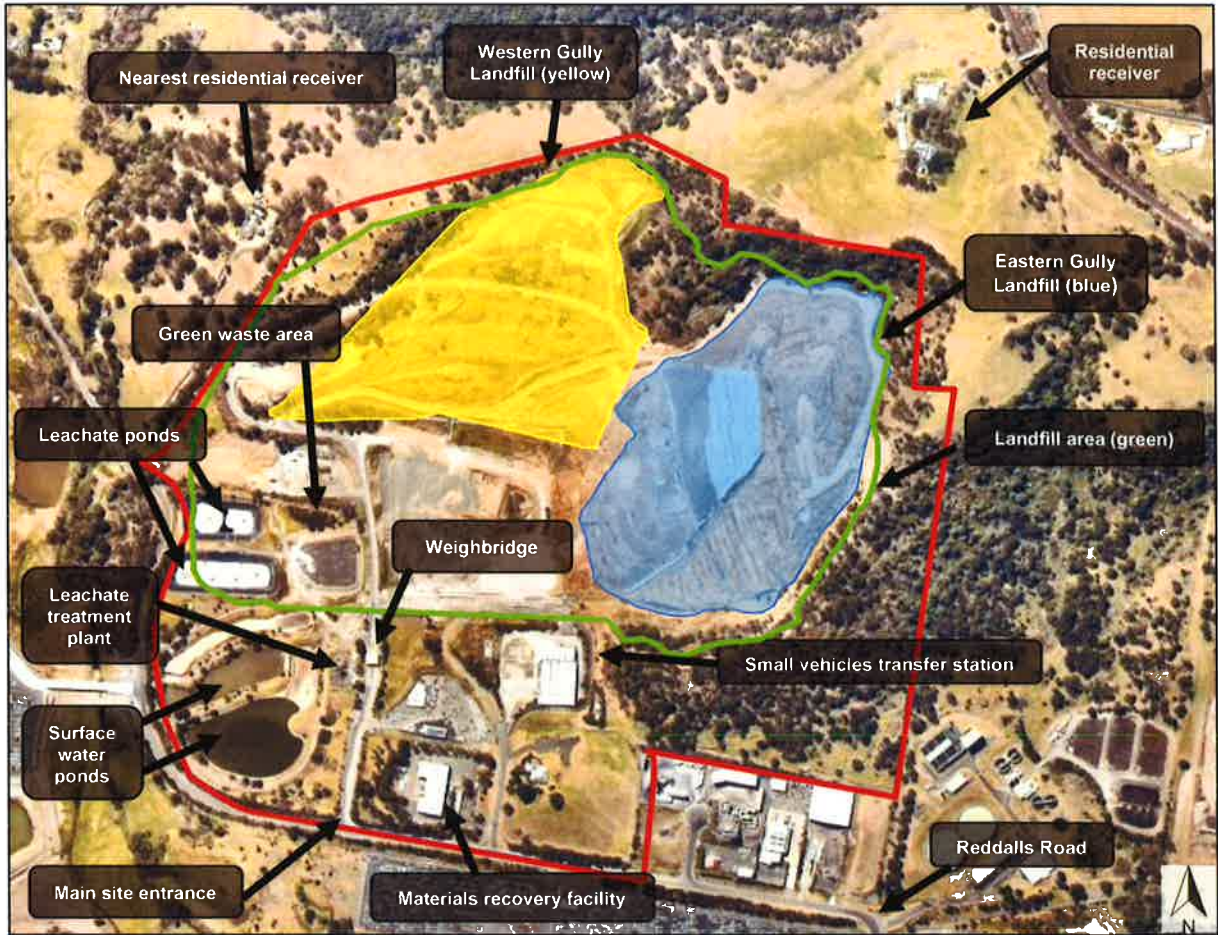
Figure 2: Subject Site (Shown in Red)