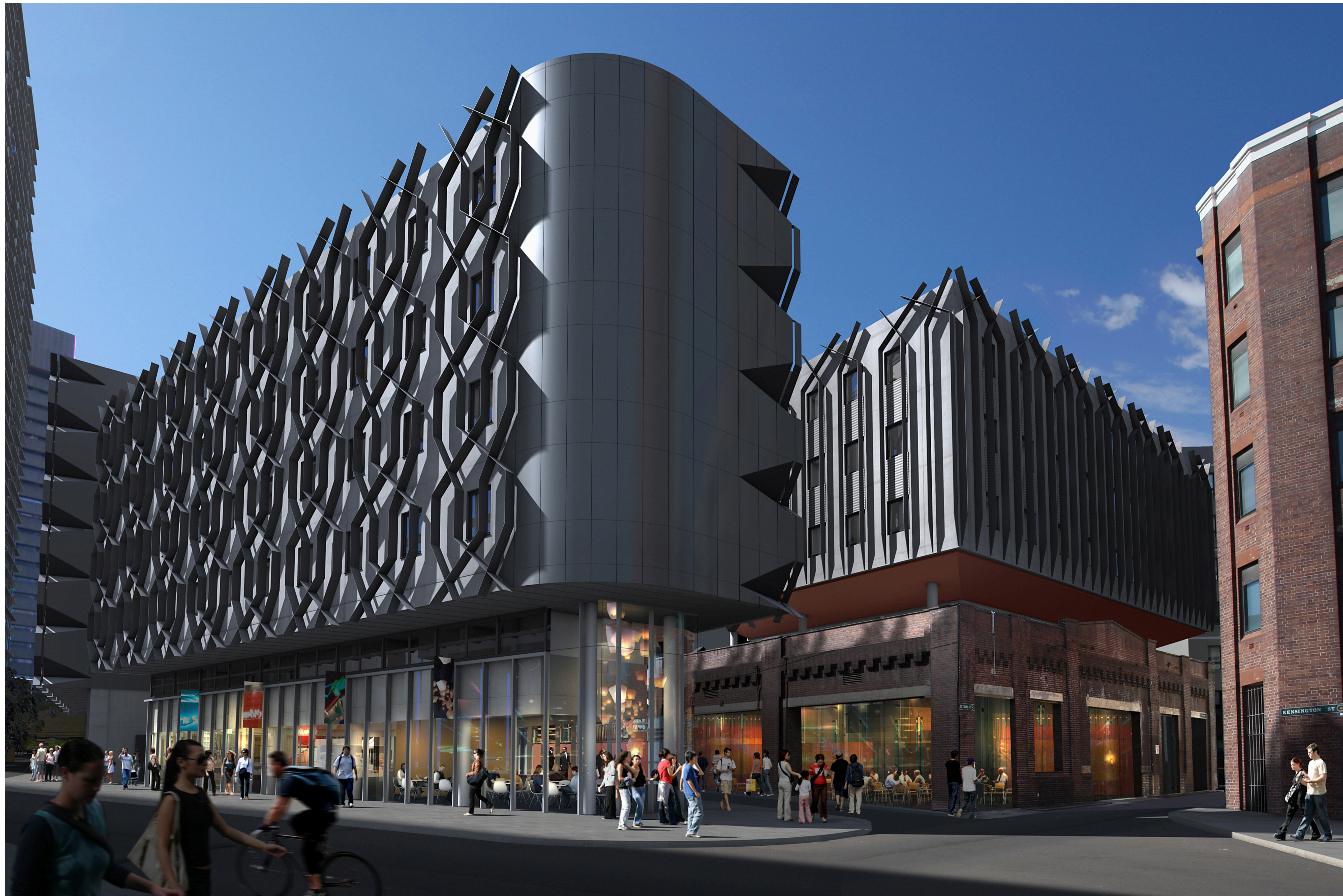
VIEW 4 - LOOKING NORTH FROM CARLTON STREET