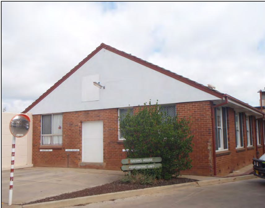
Gissing House, 2010

WEIR PHILLIPS Architects and Heritage Consultants