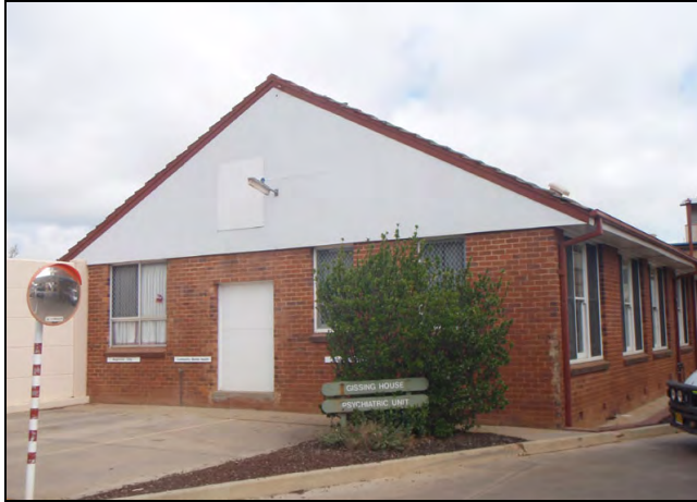
Figure 8: The 1956 section of Gissing House.

The 1956 block is clearly identifiable in the existing building as a simple, single storey brick (single tone) building with a wide gable roof clad in terracotta tile roof and large timber framed windows. The integrity of this building is mixed. The later extension is constructed of banded brickwork and has a pitched roof. The complex includes a high walled courtyard to Lewis Drive. Refer to Figures 8 to 10.