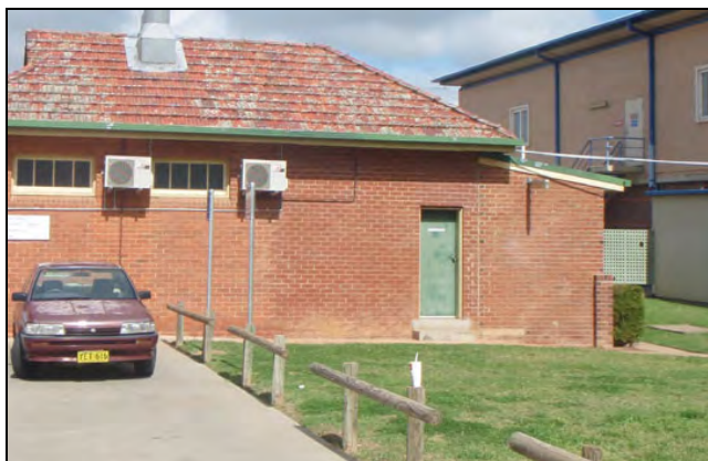
Figure 6: Northern elevation of the mortuary.