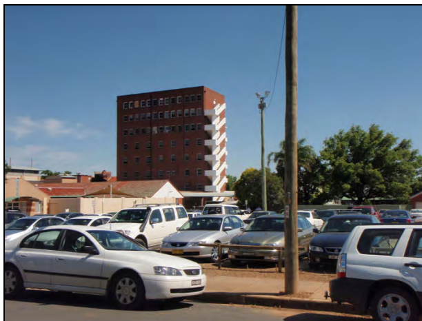
Figure 4: Looking into the car park from Yathong Street.

The remainder of the site of the new building comprises Nos. 10-16 Yabtree Street. Nos. 10-16 Yabtree Street are long, narrow rectangular allotments. There is a single storey bungalow on each of the allotments. The demolition of these bungalows is being dealt with under a separate application under State Environmental Planning Policy (Infrastructure) 2007 .