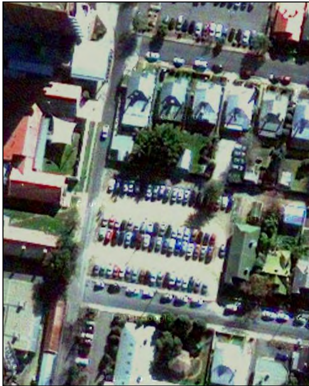
Figure 3: The car park, the site of the proposed works Google Maps.

boundaries of Nos. 6 Yabtree Street and No. 7 Yathong Street to the east; and Yathong Street to the south. The car park is level and gravel surfaced. There is no significant vegetation. Refer to Figures 3 and 4.