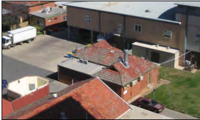
Figure 5: Looking down over the mortuary.

The Old Mortuary is a free standing, single storey face brick building with hipped roofs clad in terracotta tile. The roof of a later addition is clad in metal. Openings are asymmetrically arranged and vary in size and style. The building's form, openings and architectural detailing have been substantially altered over time. The building has a low level of intactness. Refer to Figures 5 to 7.