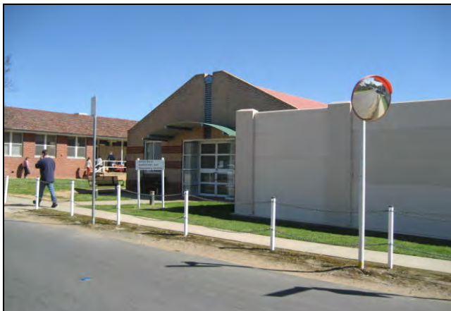
Figure 9: The 1991 Extension to Gissing House and the courtyard wall.