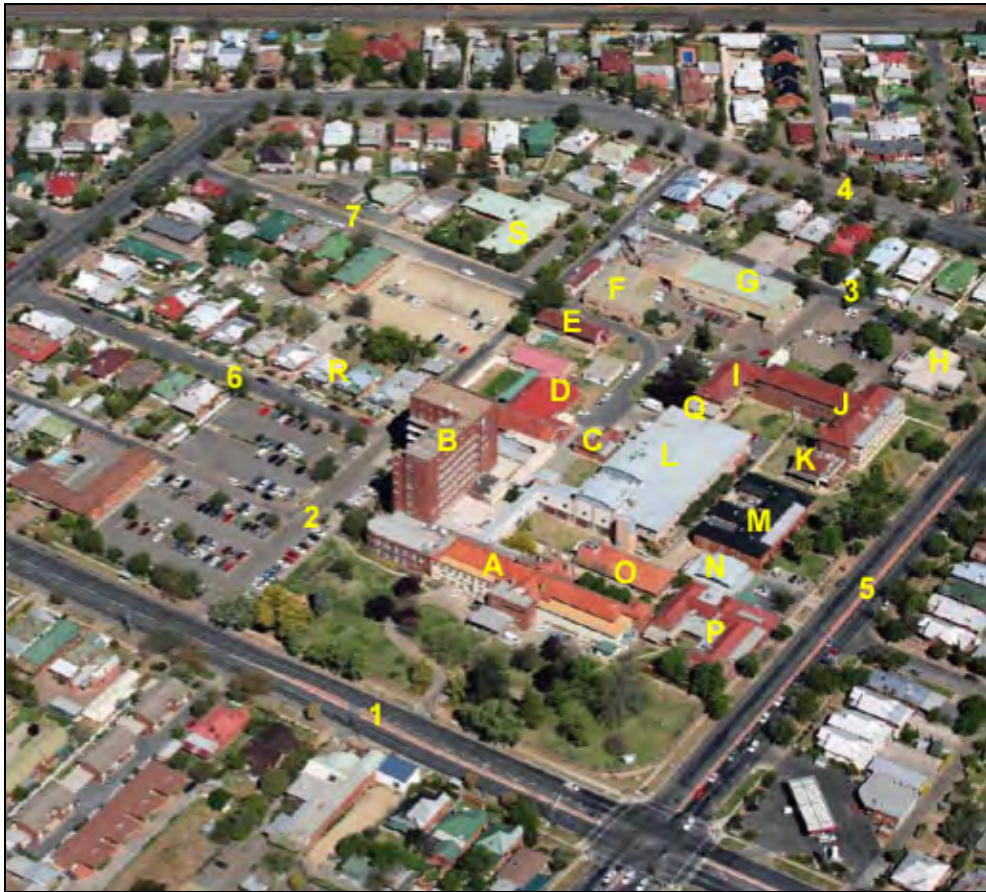
Figure 2: Site Plan

Aerial photograph from Capital Insight; annotations Weir Phillips.