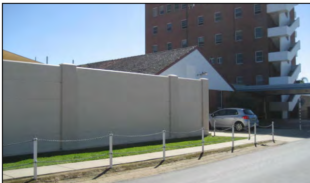
Figure 10: Wall to the front of Gissing House, with the original section of the building just visible beyond.