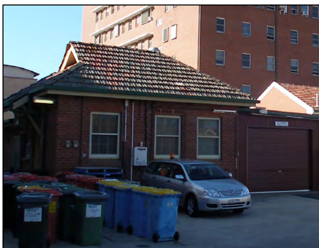
Figure 7: Southern elevation.