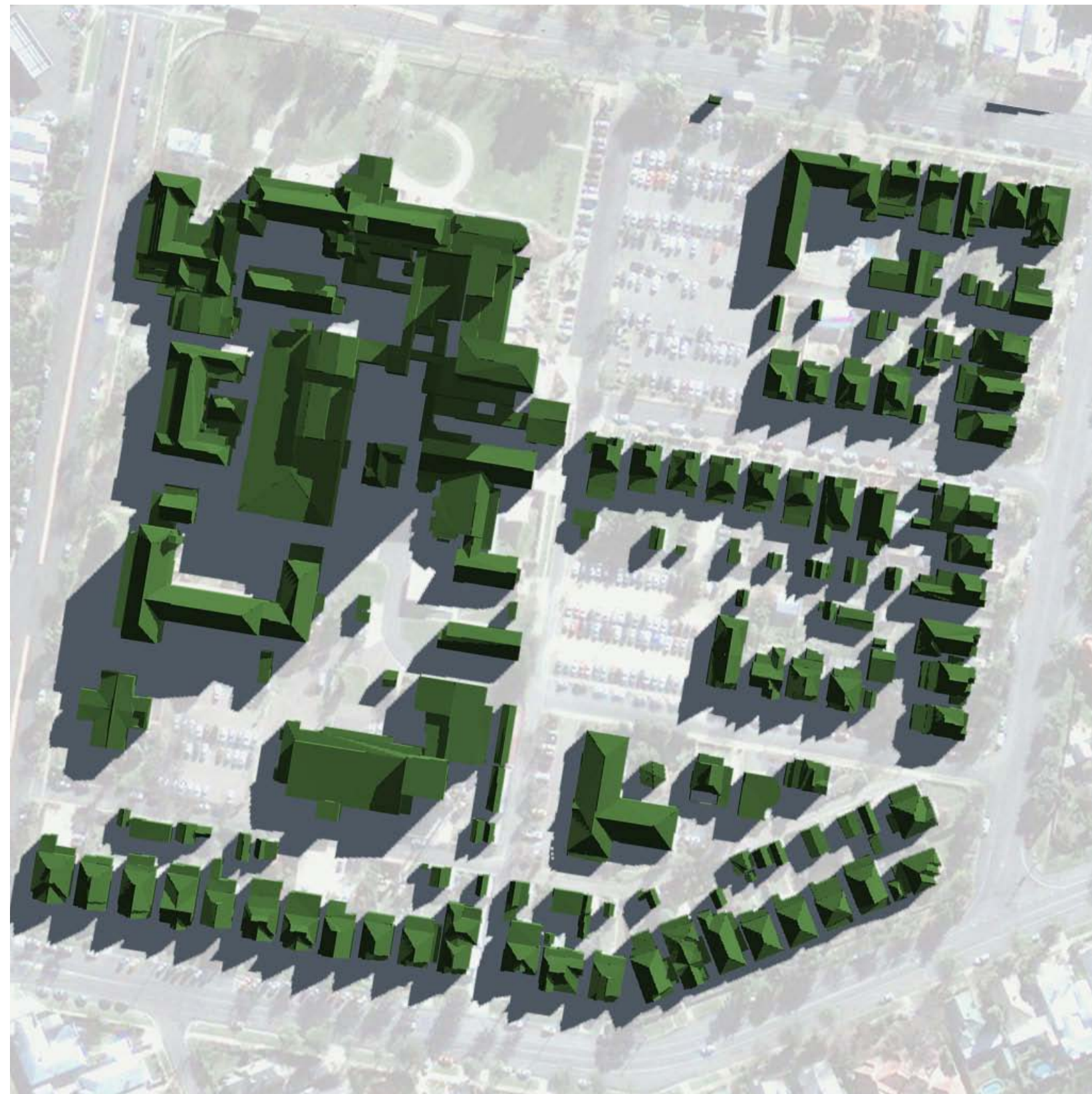
1 EXISTING SHADOW STUDY WINTER 9AM NTS