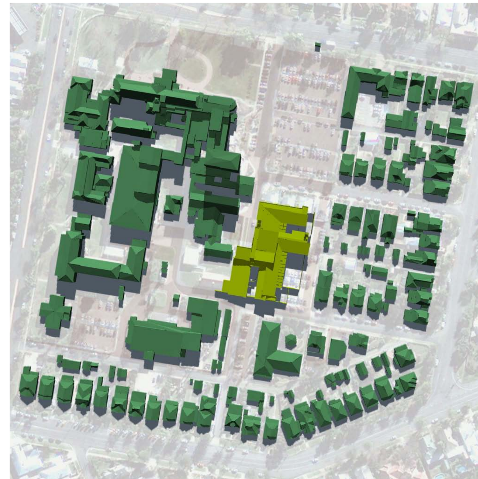
5 PROPOSED SHADOW STUDY WINTER 12PM NTS