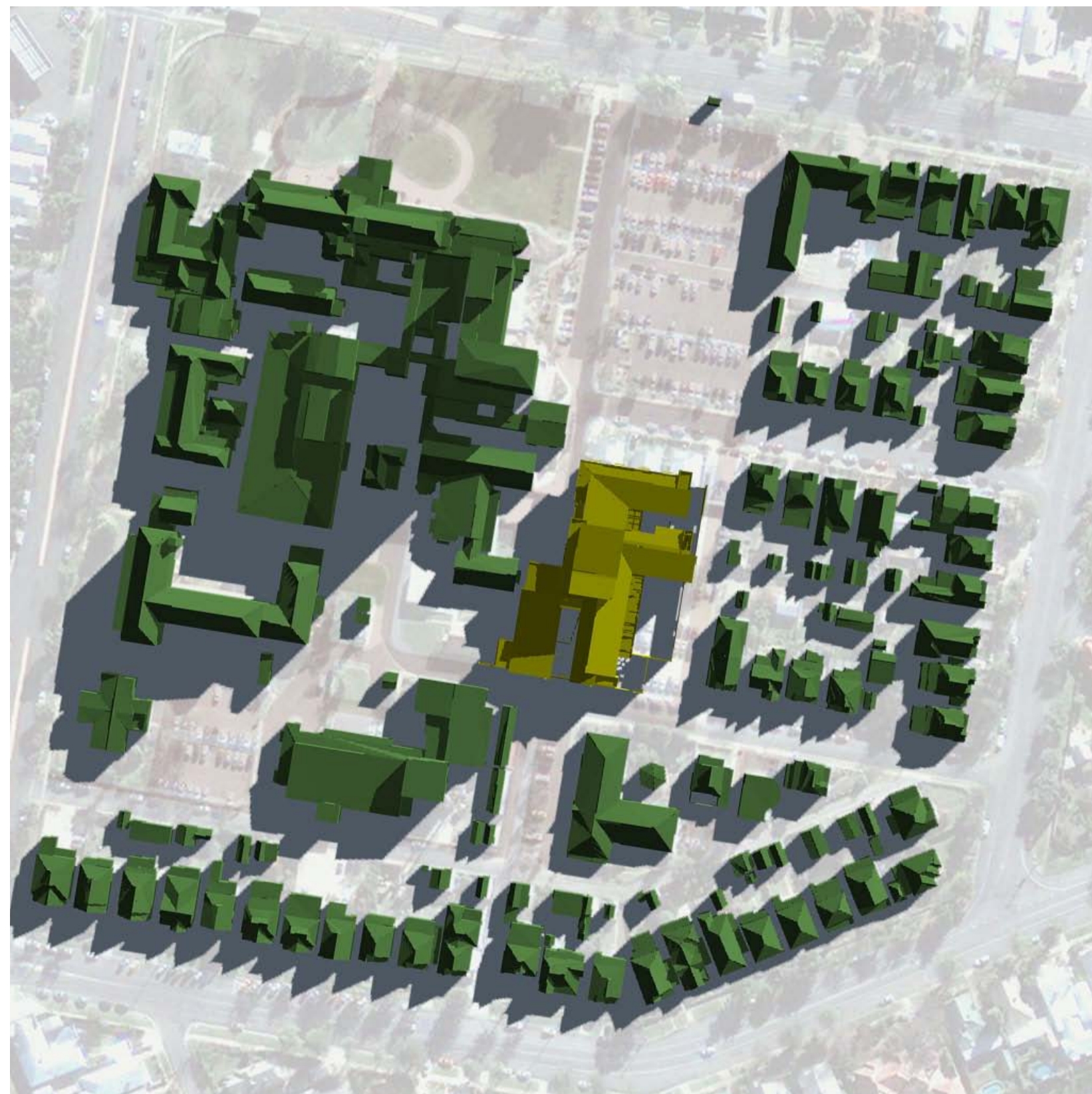
4 PROPOSED SHADOW STUDY WINTER 9AM NTS