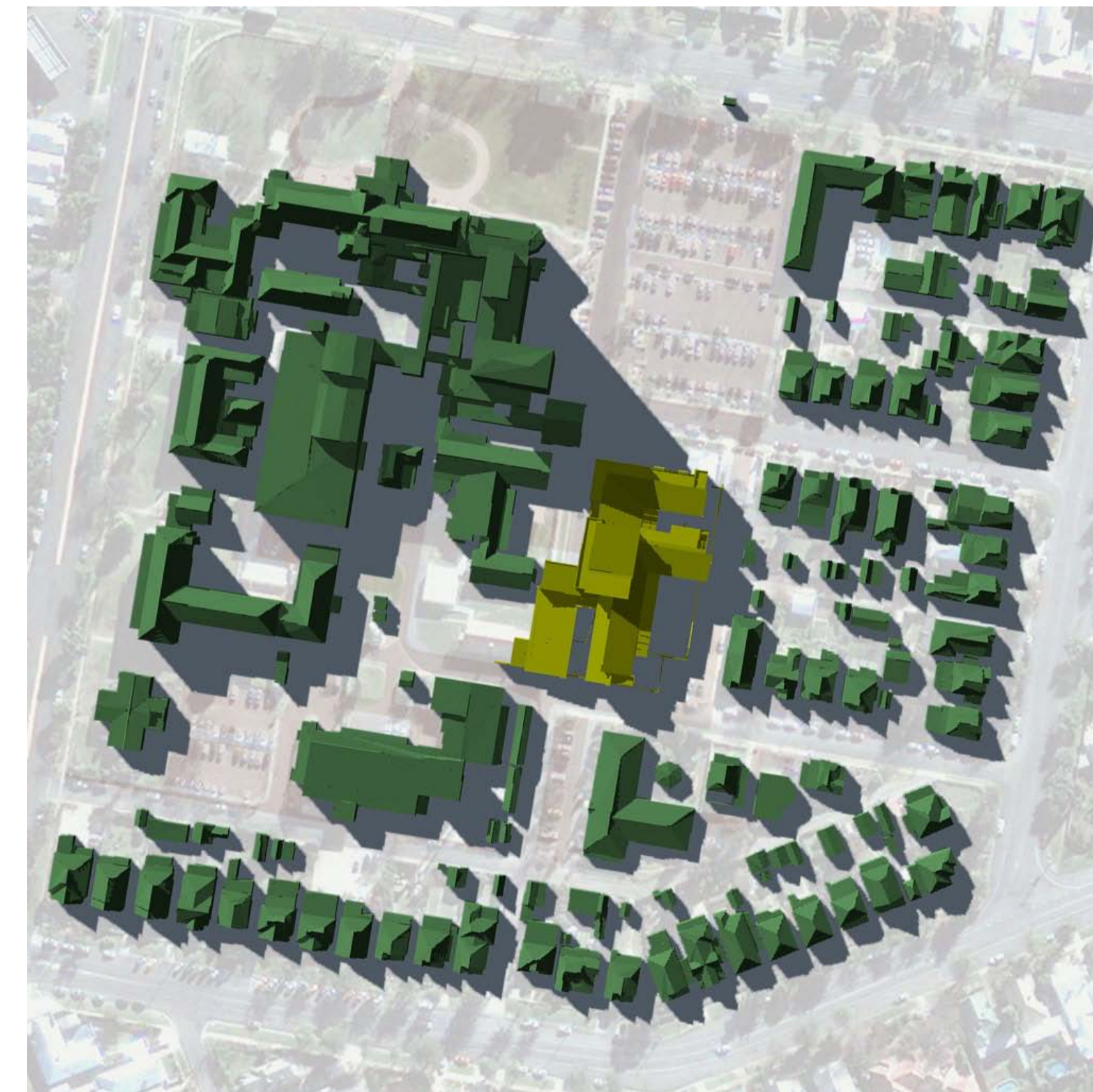
6 PROPOSED SHADOW STUDY WINTER 3PM NTS