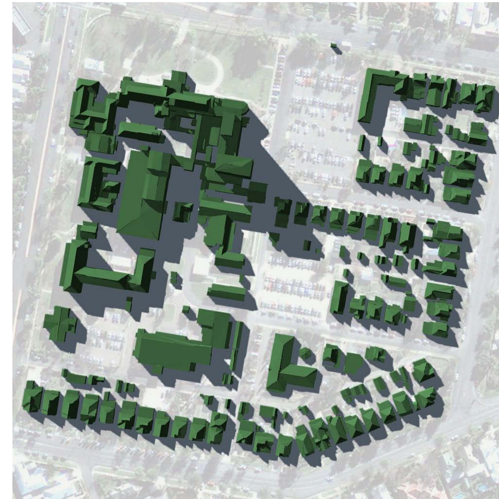
3 EXISTING SHADOW STUDY WINTER 3PM NTS