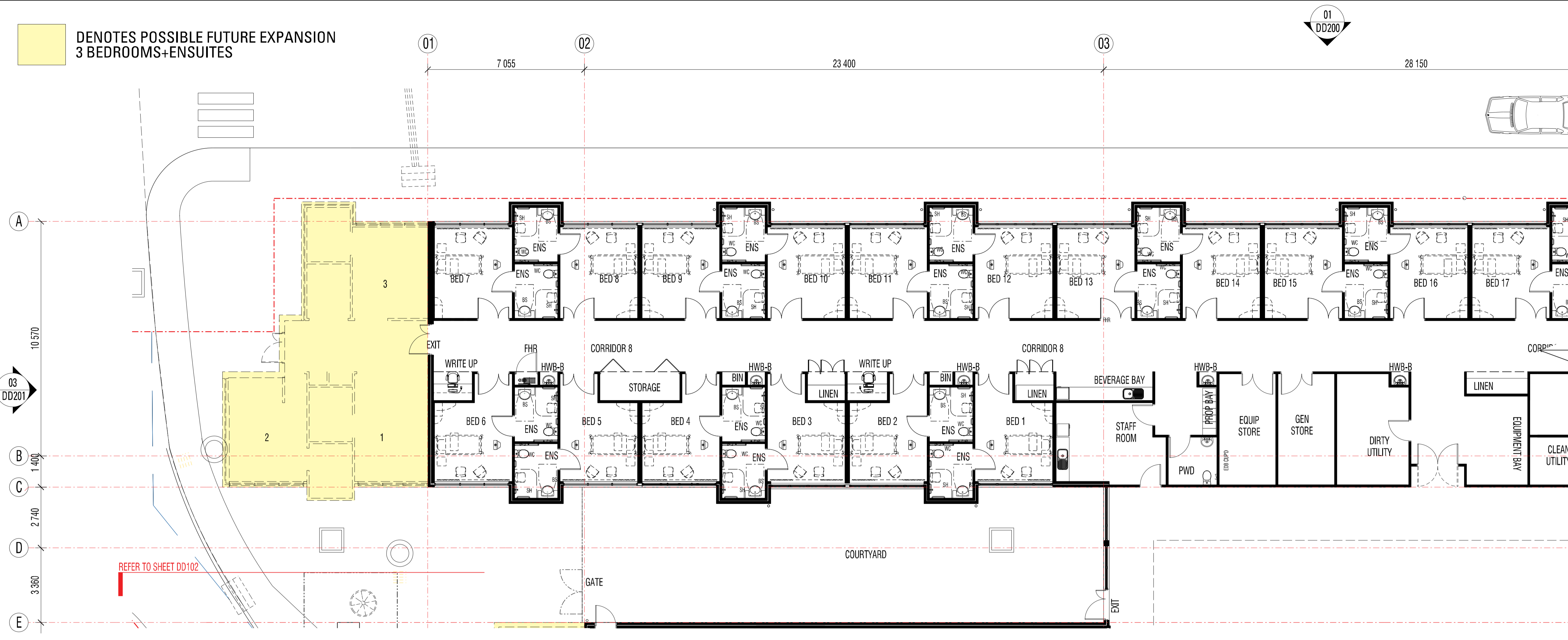
1 GROUND FLOOR PLAN - INPATIENT CLUSTER SCALE 1:100

DENOTES POSSIBLE FUTURE EXPANSION 3 BEDROOMS+ENSUITES