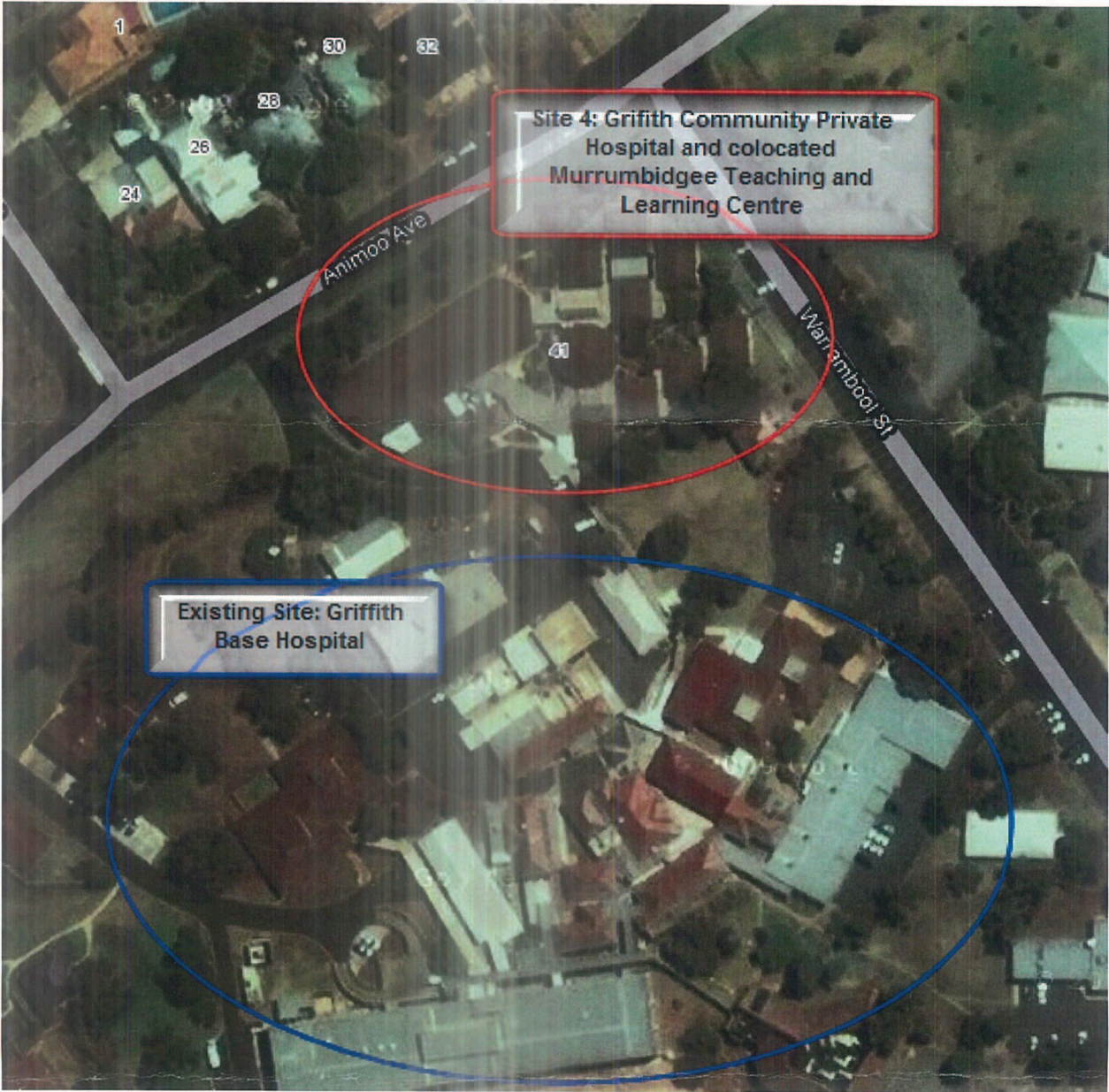
Figure 1: Locality Plan showing the proposed location of the Project collocated with the existing Griffith Base Hospital.