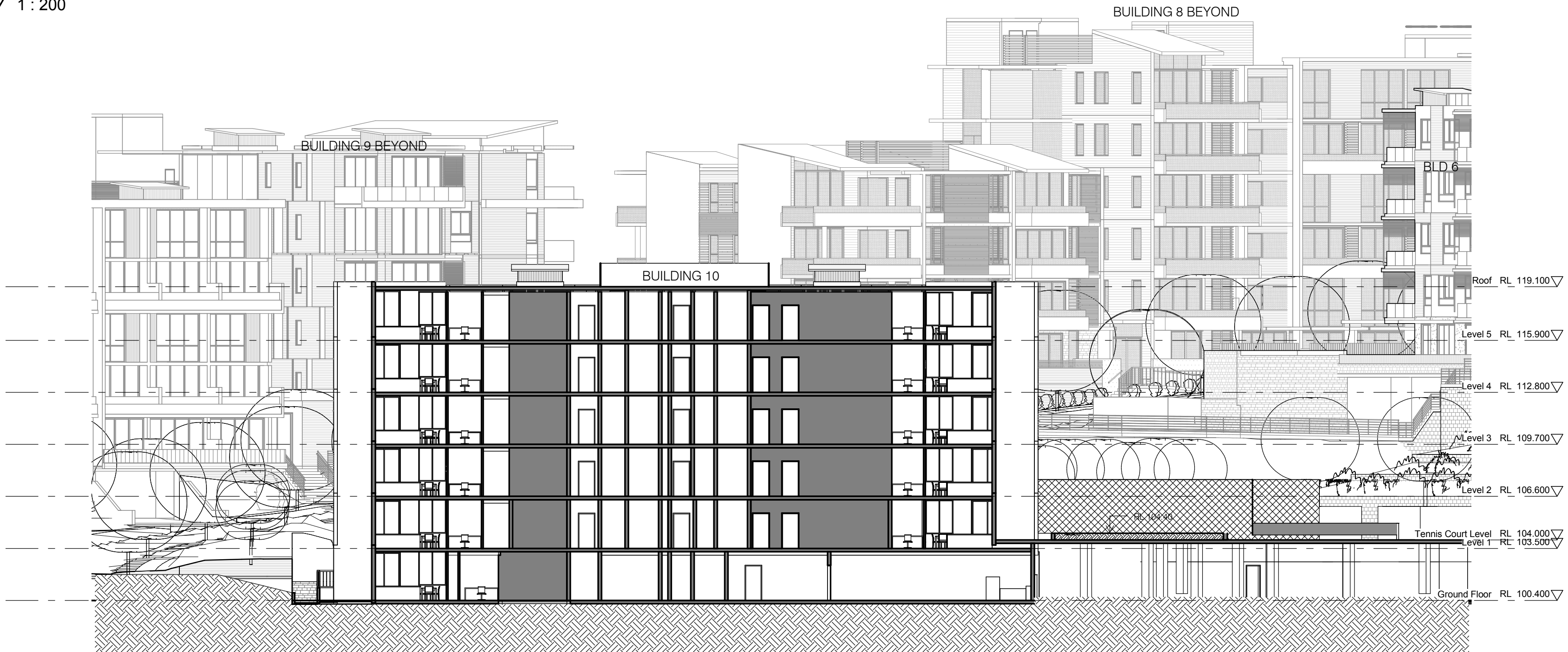
F Site Section F 1 : 200