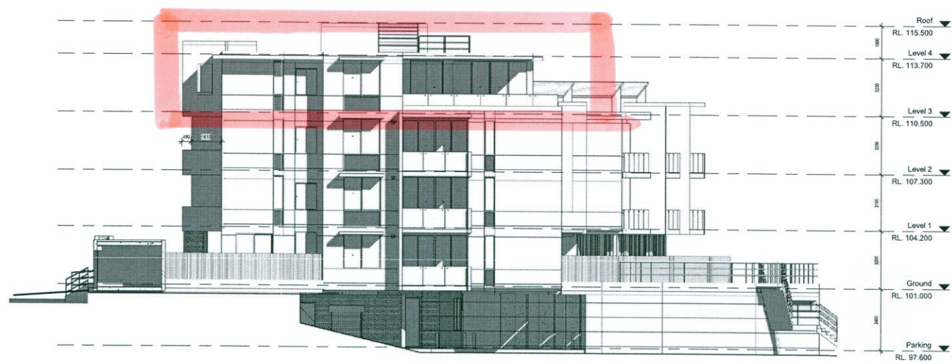
1 West 1:100