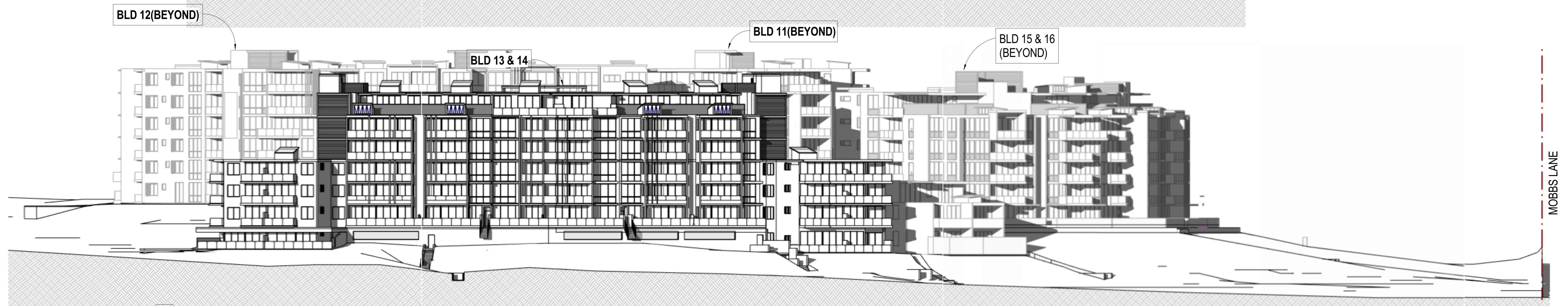
4 SITE ELEVATION - WEST 1:250