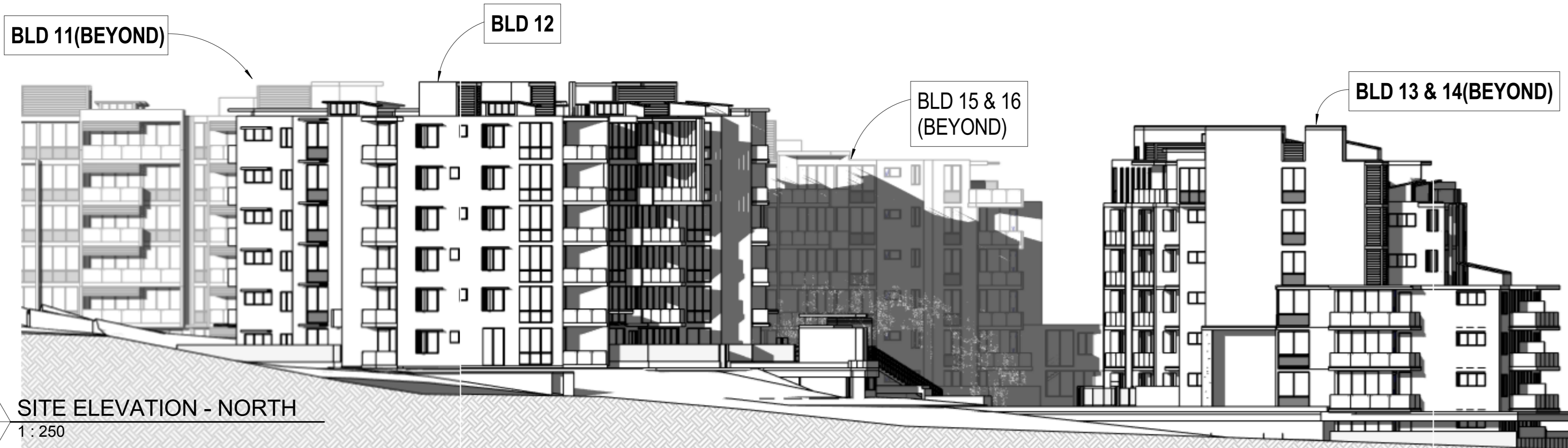
3 SITE ELEVATION - NORTH 1:250