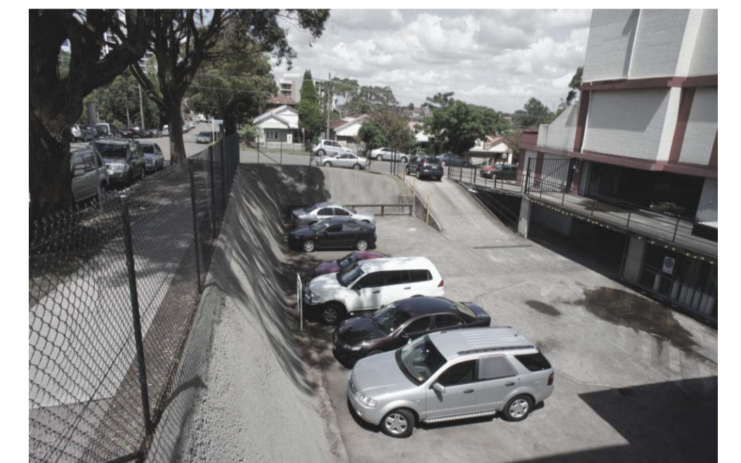
EXISTING PHOTO VIEW 4