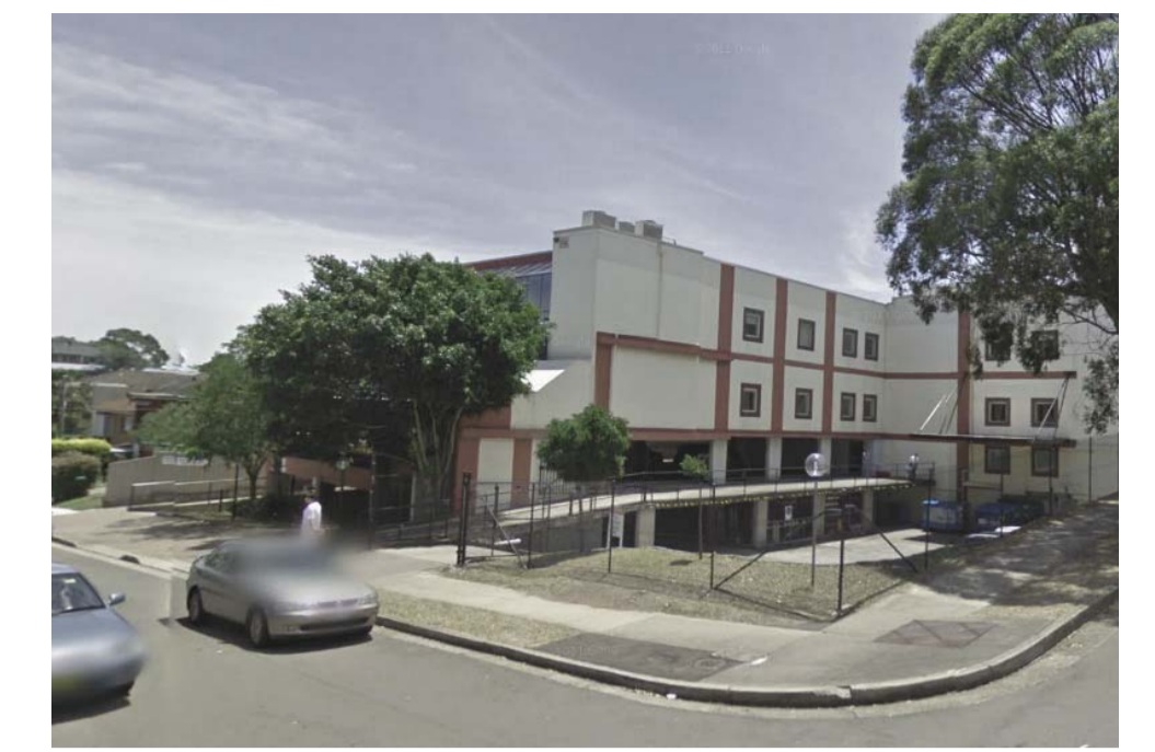
EXISTING PHOTO VIEW 1