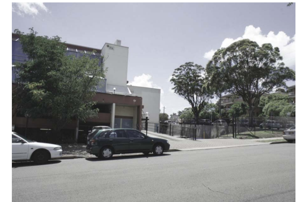
EXISTING PHOTO VIEW 3