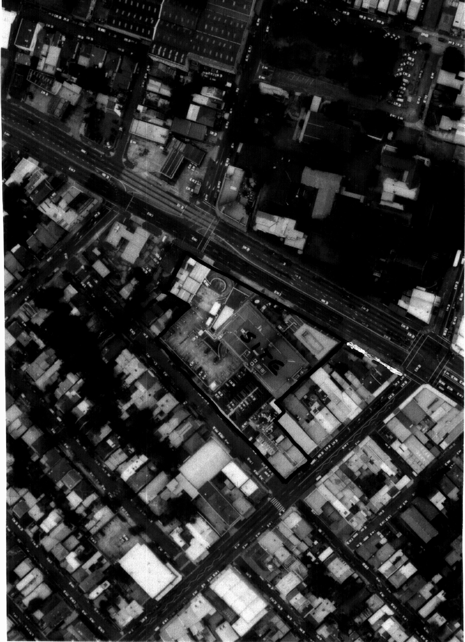
SYDNEY HARBOUR 1:6,000 2004 RUN 5 PHOTO 116-144