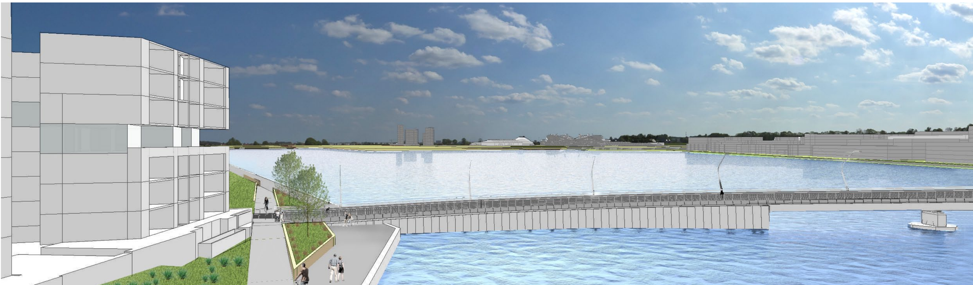
2012 EA BRIDGE