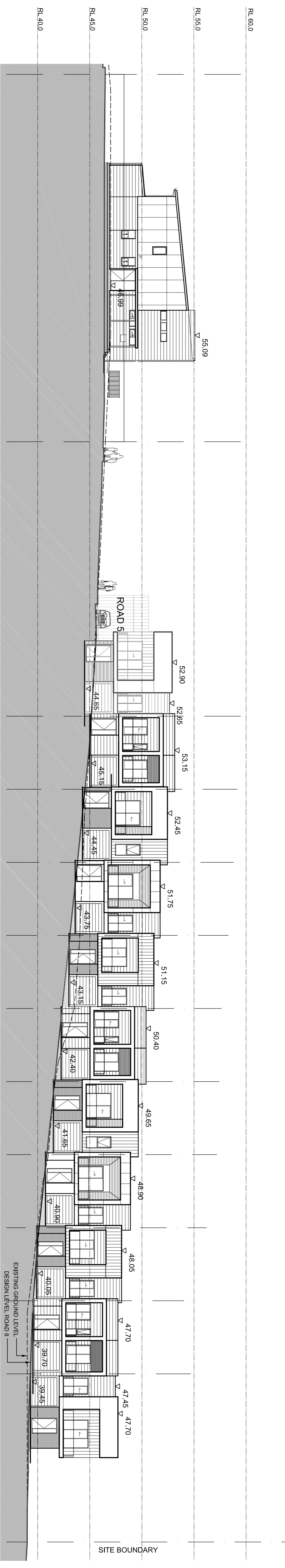
ELEVATION TOWARDS SOUTH - ROAD 16