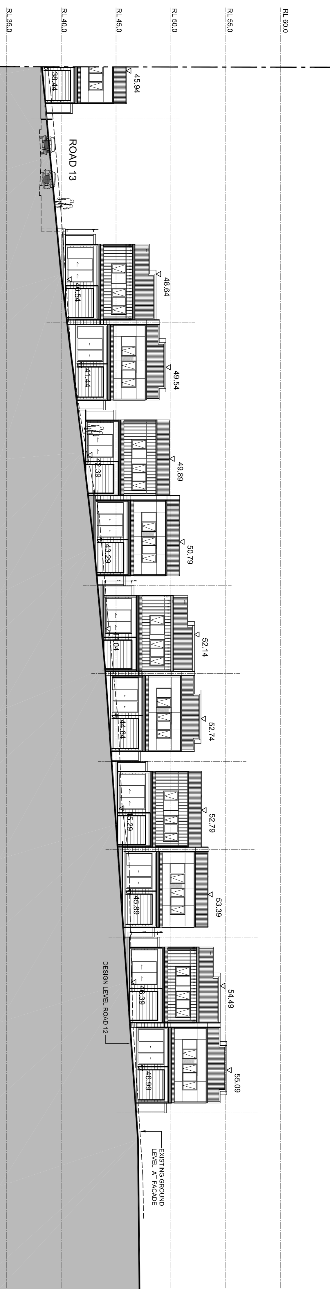
ELEVATION TOWARDS WEST - ROAD 12 cont.