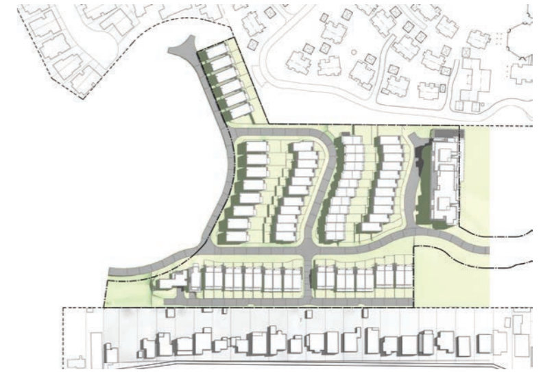
21st September 11.00am