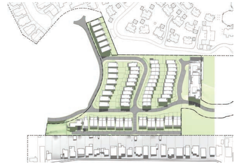
21st September 02.00pm