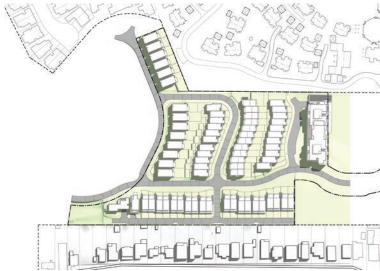
21st September 12.00pm