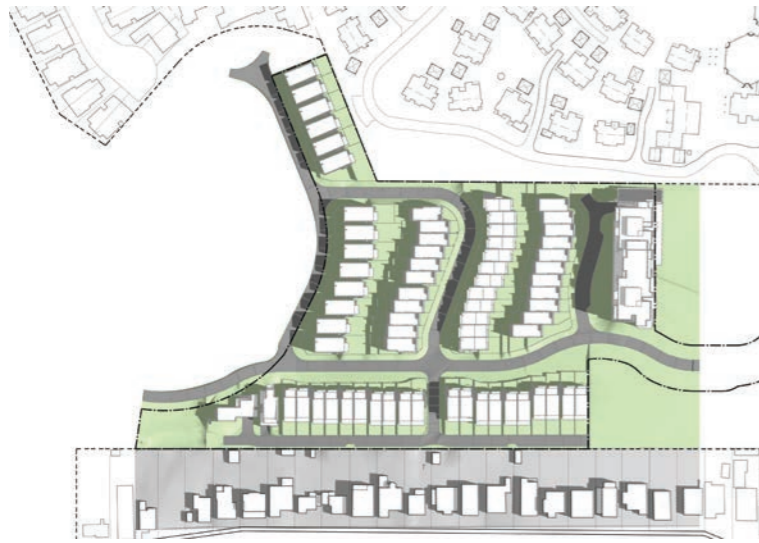
21st September 09.00am