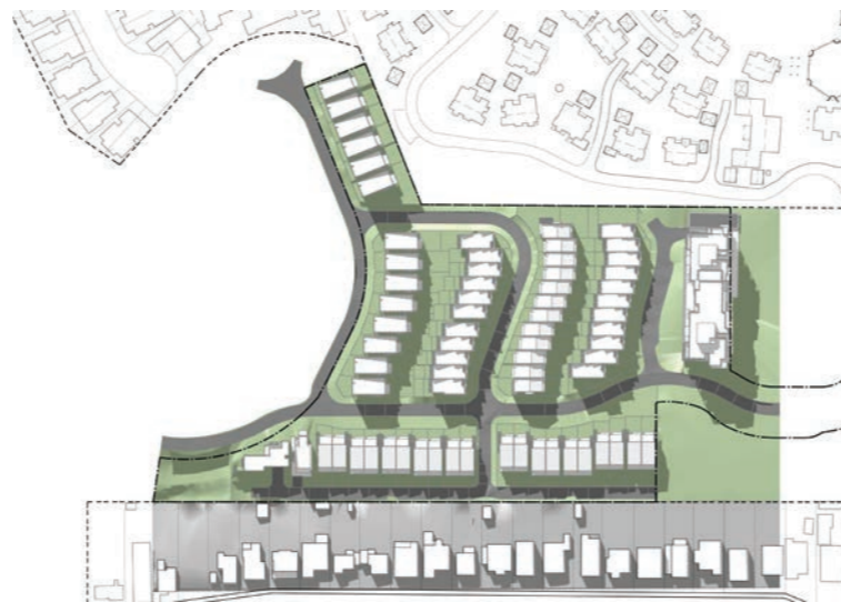
21st September 04.00pm