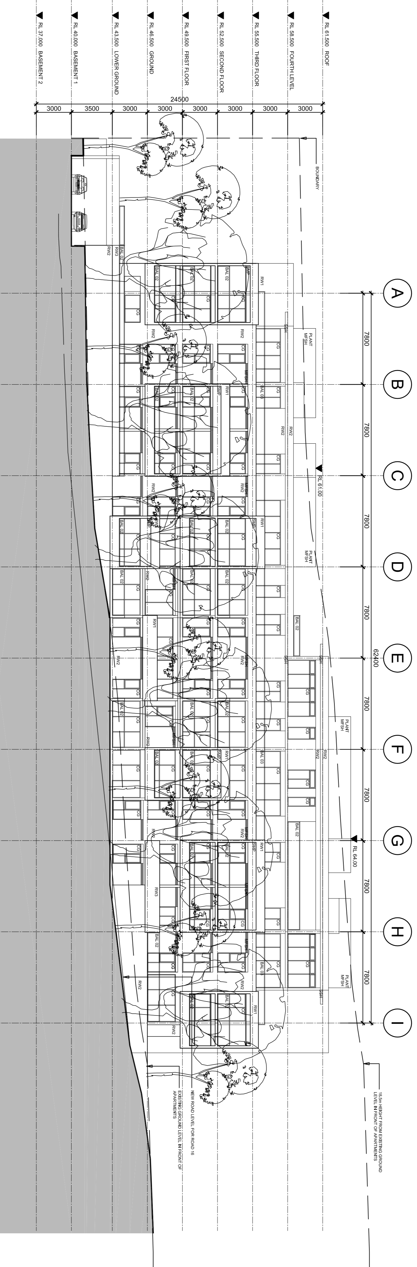
FRONT (SOUTH-WEST) ELEVATION