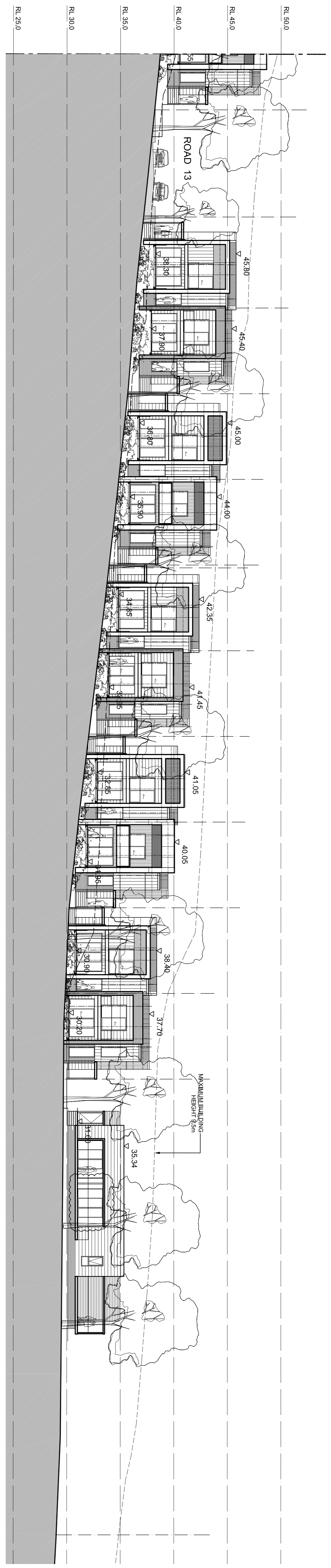
04B. ELEVATION TOWARDS EAST - ROAD 5 cont.