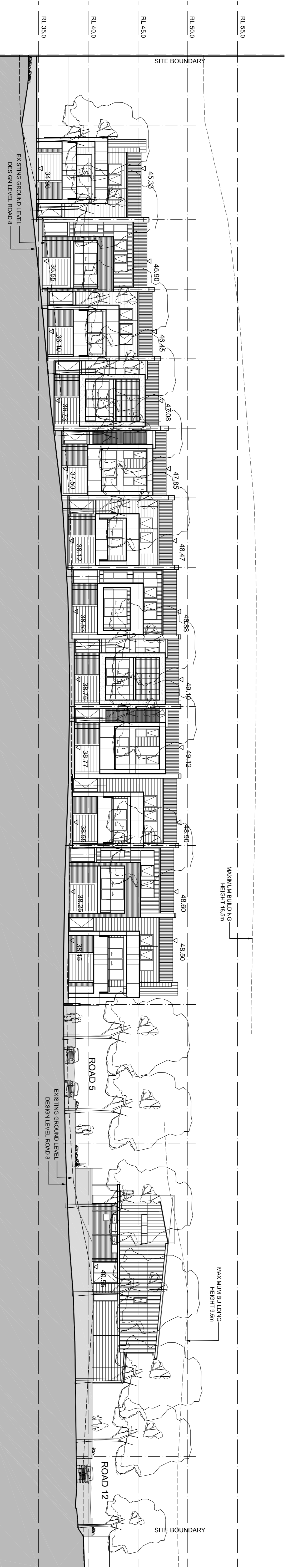
02. ELEVATION TOWARDS NORTH - ROAD 8