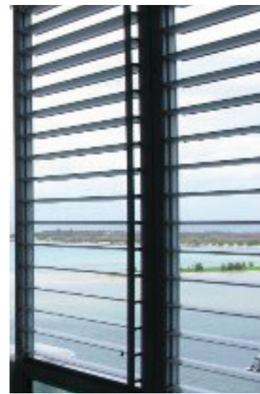
MLO - Metal Louvre Operable