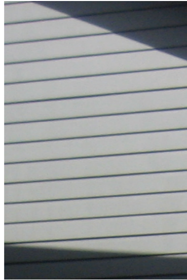
WB - Painted Weatherboard