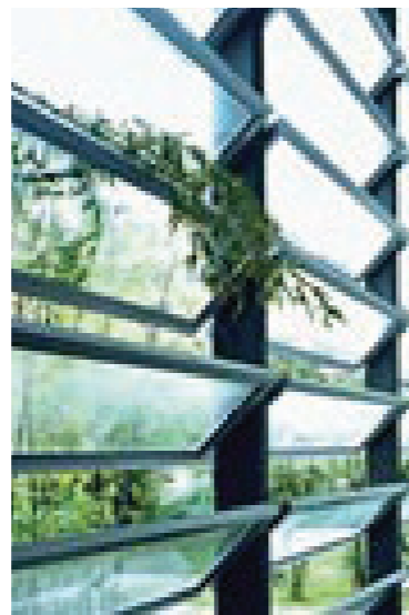
GLO - Glass Louvre Operable