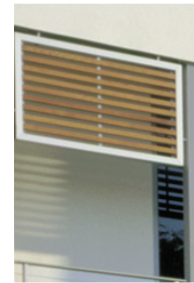
MBS - Metal Batten Screen