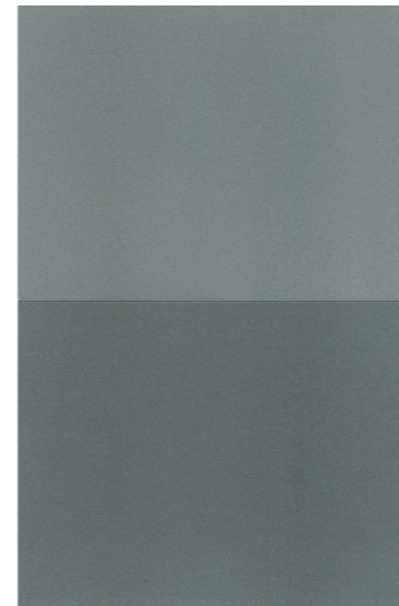
RWP - Rendered Wall, Paint Finish