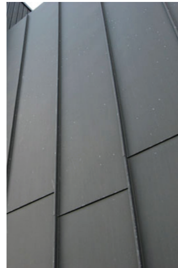
MC - Metal Clad Wall