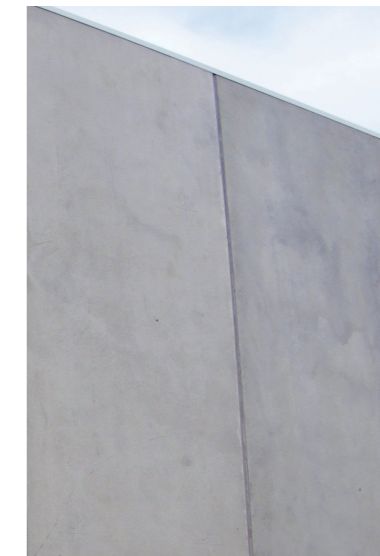
COP - Precast Concrete