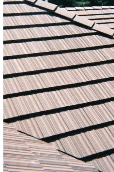
TR - Tiled Roof