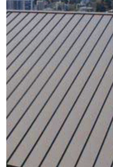
MDR - Metal Deck Roofing