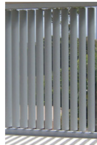
MLO - Metal Operable Louvres