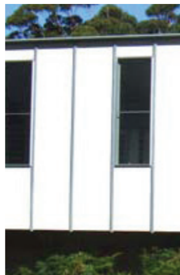
FCS - FC Sheeting