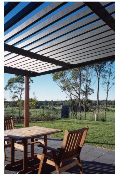
TBP- Timber Pergola