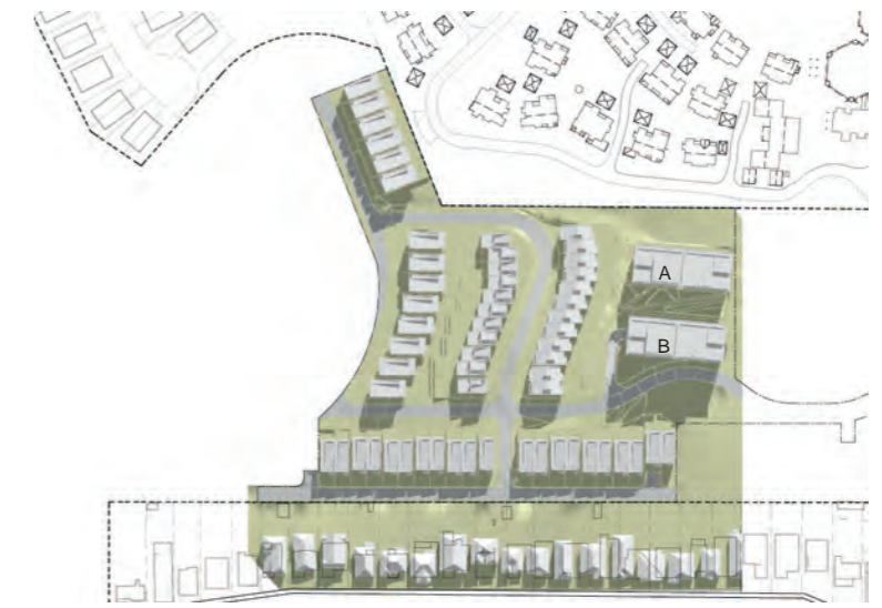
21st June 02.00pm