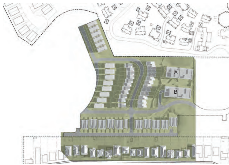
21st June 09.00am