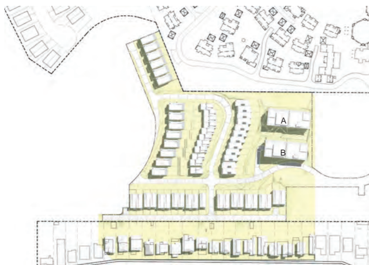
21st September 12.00pm