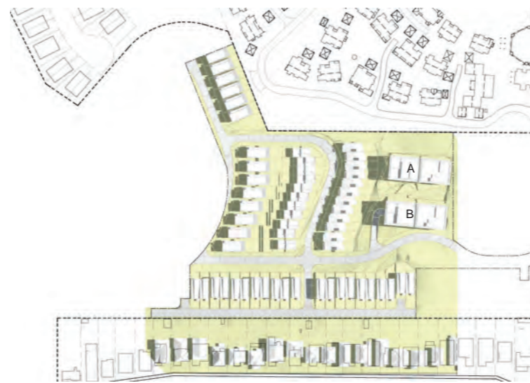
21st September 10.00am