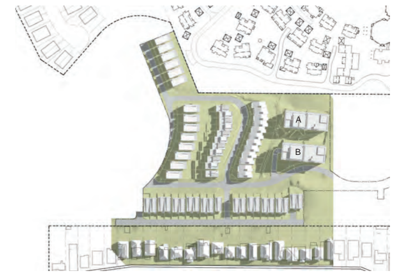
21st June 11.00am