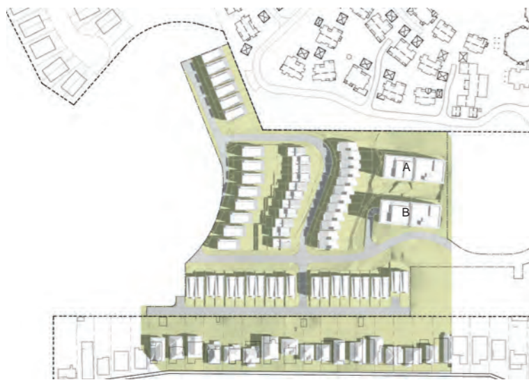
21st September 09.00am