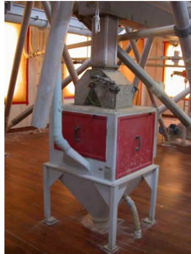
Figure 5.10 Flour Mill Building Level 2, showing feeder.

The first floor of the mill is the Milling Floor and contains the Break and Reduction roller mills. There are approximately twenty four mills on this floor, each performing one step on either of the Break and Reduction processes. All are virtually identical machines manufactured by Henry Simon Ltd, although the rollers installed in each mill vary. The centre of the room contains a partitioned office for the Head Miller, from which the operation of the mill is supervised.