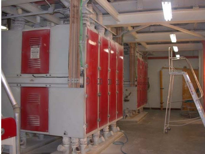
Figure 5.5 Flour Mill Building Level 4, showing two of the large plansifters.