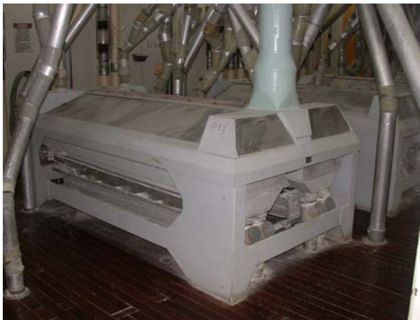
Figure 5.7 Flour Mill Building Level 3, showing two of the large purifiers.

The third floor of the mill is the Purifier Floor and contains a row of purifiers along the east wall plus various classifiers, finishers and separators. This floor has a spectacular array of pneumatic flour handling pipework, with in-line valves, direction switches and mixing chambers. The Smut House room in the south-east corner of the mill also contains a Wheat Cleaning Sieve which is part of the initial wheat preparation system.