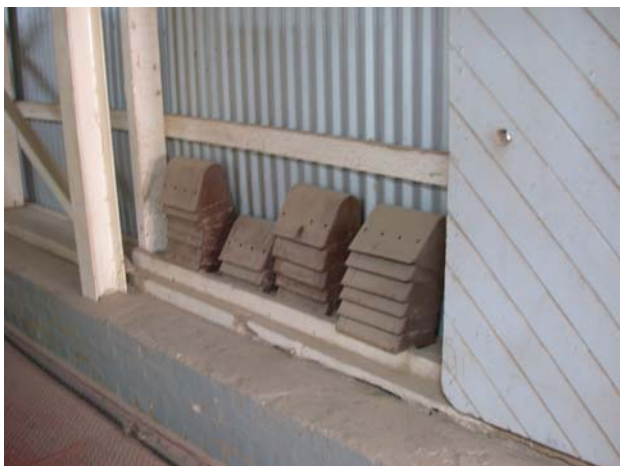
Figure 5.15 These old steel buckets from the elevators in the Clean Wheat Bins Building have been replaced with new plastic type buckets.

This equipment is generic to the task and is similar to grain handling machinery in any context, whether at rail sidings, ship wharves or at the flour mills.