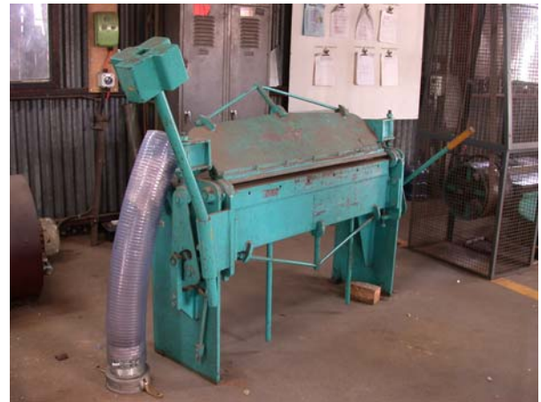
Figure 5.22 Workshop - the Heine & Sons Plate Edge Bending Machine