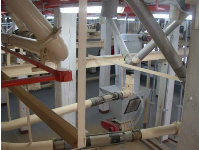
Figure 5.13 Flour Mill Building Basement Level, showing one of the weigher machines.