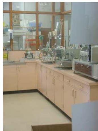
Figure 5.16 Mill Offices - Laboratory. All of this equipment will be removed from site.