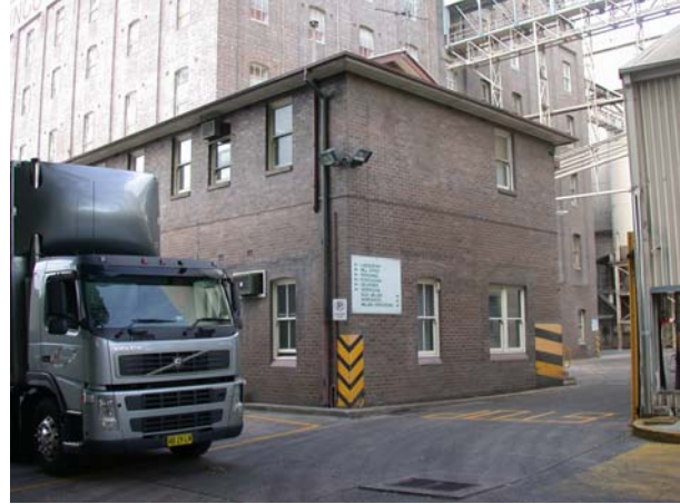
Figure 4.2 The Mill Office Building is attached to the northeast corner of the Warehouse building.