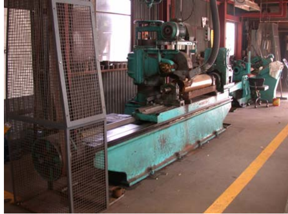
Figure 4.8 One of the two lathes set up specifically for cutting and grooving the mill rollers.