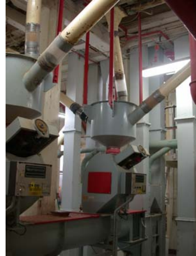
Figure 5.14 Flour Mill Building Basement Level, showing pair of product weighers.