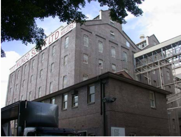
Figure 4.1 Warehouse and Packing Building with the Flour Mill building in the background.

appear to be of relatively recent origin. Apart from the mill offices, it also contains the mill laboratory, from which quality control and product testing were managed