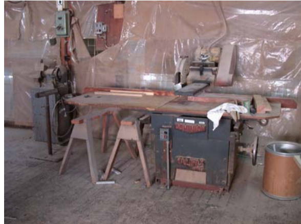
Figure 5.18 Carpenters Shop showing planer and grinding wheels.