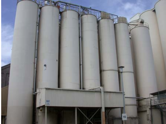
Figure 5.19 Bulk Flour Storage Bins, showing one of the truck loading bays.