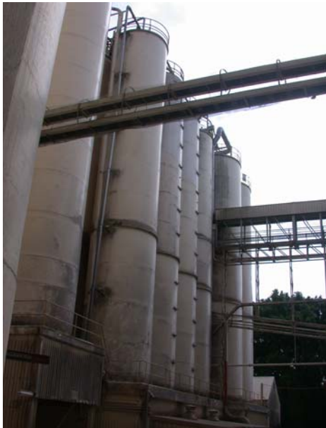
Figure 4.5 The Bulk Flour Storage Silos. These silos hold the mill product until loaded into road tankers.