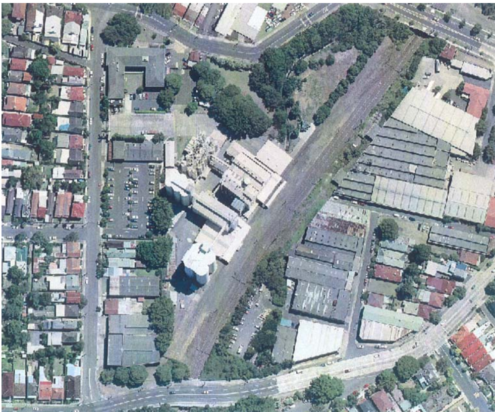
Figure 1.2 Aerial Photograph, Mungo Scott Flour Mill Summer Hill (Source: NSW Dept of Lands: Six Viewer; Ausimage © SKM 2008).