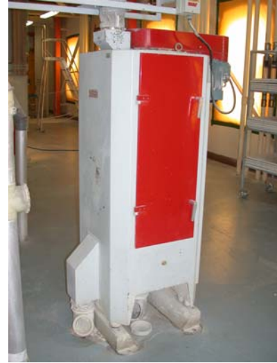
Figure 5.6 Flour Mill Building Level 4, showing small quiver sifter.

The third floor of the mill is the Purifier Floor and contains a row of purifiers along the east wall plus various classifiers, finishers and separators. This floor has a spectacular array of pneumatic flour handling pipework, with in-line valves, direction switches and mixing chambers. The Smut House room in the south-east corner of the mill also contains a Wheat Cleaning Sieve which is part of the initial wheat preparation system.