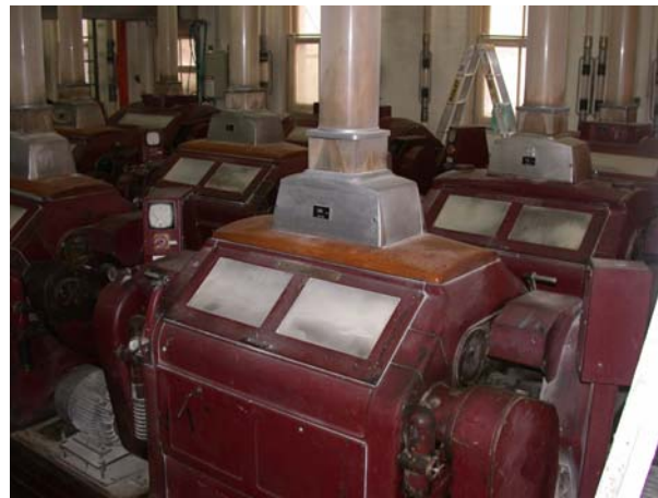
Figure 5.12 Flour Mill Building Level 1, showing roller mills.

The Lowest floor, at exterior ground level, is known as the Mill Basement and it is largely occupied with pneumatic pipework carrying products to and from the floors above, plus a range of in-line product weighers, magnetic separators and .