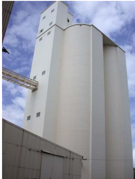
Figure 4.6 The Bulk Wheat Storage Silos. These silos hold reserves of grain received from the farm ready for processing in the mill.