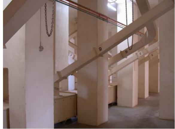
Figure 5.20 Bulk Wheat Storage Silos - Basement Level, showing chutes and enclosed discharge conveyors.