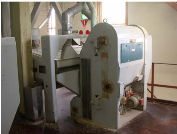
Figure 5.3 Flour Mill Building - Smut House, showing grain sieve.

Wheat passes over a vibrating sieve, then through disc and cylinder separators on successive levels, after which it is transferred into the grinding bins in the flour mill.