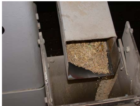
Figure 5.4 Flour Mill Building - Smut House, showing waste screenings of foreign seeds and grains.

The space beneath the roof below the clerestory of the mill contains the Grinding Bins, which hold the grain required for approximately a full day's processing, plus the distribution conveyor and elevators to bring the grain to this level and fill the bins.