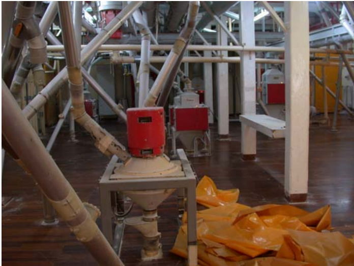
Figure 5.9 Flour Mill Building Level 2, showing one of the rotary mills.