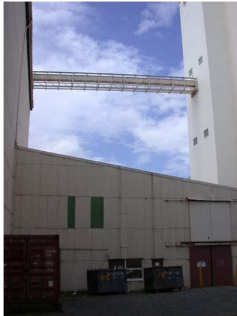
Figure 4.4 The Wheat Intake and Cleaning Building, now used as General Store 2