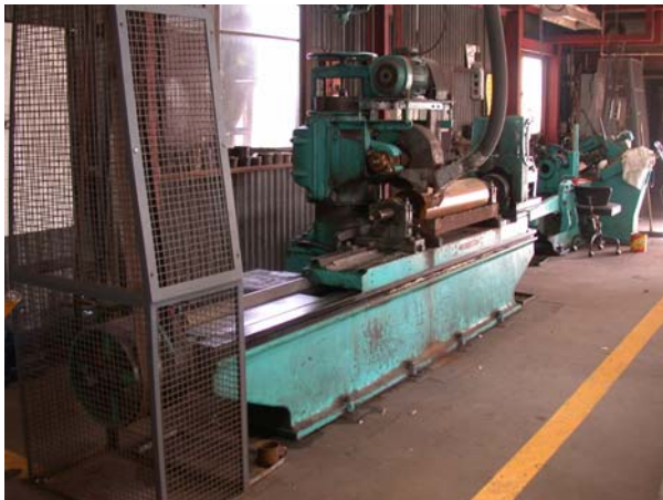
Figure 5.21 Workshop. The two large lathes used for recutting the mill rollers.

The Workshop contains several machines associated with general maintenance and light fabrication, including two specialist lathes. The lathes are marked Henry Simon but are believed to be of German manufacture. The Workshop contains a number of John Heine & Sons metal fabrication machines, including a set of rolls, a plate edge bending machine and guillotine. These machines are all relatively common types, typically found in any similar workshop. The two lathes are general purpose machines which have been set up specifically to undertake the tasks of cutting the flutes on mill rollers. All of the major items of machinery in the Workshop appear to be listed for removal by Allied Mills.