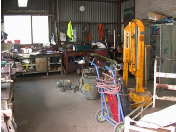
Figure 4.7 Interior of the Workshop, showing general workshop features such as workbenches and equipment

Building 21 is a single storey gabled roofed building clad in corrugated iron, containing a general mechanical workshop. It incorporates the remains of the WW2-era air-raid shelter, a brick and concrete structure erected in the early 1940s in case of air attack. It contains several machines associated with general maintenance and light fabrication, including two specialist mill-roller lathes.