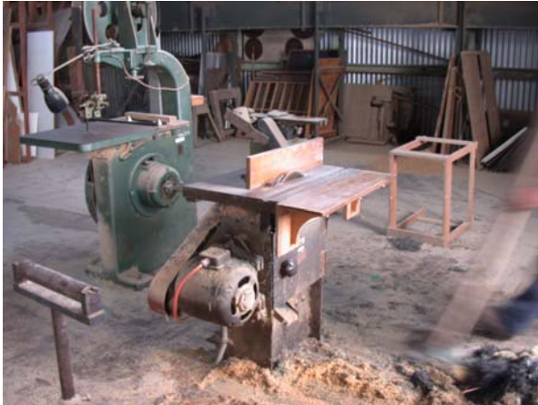
Figure 5.17 Carpenter Shop, showing band saw and circular saw.

The Wheat Intake and Cleaning / General Store 2 contains no machinery and equipment of interest on its lower levels. The mezzanine level of this building however, has been converted to a Carpenters Shop and is fitted with a number of standard timber workshop machines. These include a Dovetailer by Danokaert, a PaulCall planer, a Planer and Bench Saw by Dominion, a two circular saw benches, a band saw and a set of grinding wheels. It appears that the majority of this equipment is listed for removal by Allied Mills.