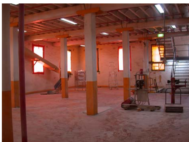
Figure 5.1 Warehouse and Packing Building Level 3, showing Bag Sealing machine and platform scales. All windows have been sealed with orange plastic prior to fumigation.

The Warehouse Building is currently vacant and has had little significant use for the last decade, following the adoption of bulk flour storage and transport in the 1970s. The building has five floors, the majority of which once provided open storage space. Equipment within the building when in use would be for managing the product in bags and moving bags between floors and into and out of the building.