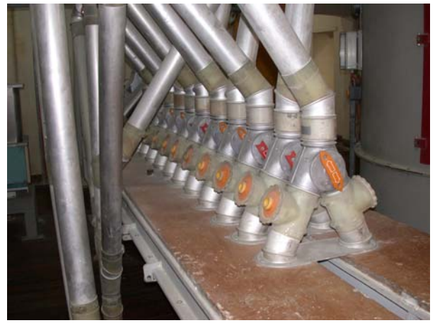
Figure 5.8 Flour Mill Building Level 3, showing pneumatic pipe valves and pipework.

The second floor of the Mill is the Screen Room and it contains a range of separators, disc mills and finishers. These are located sparsely within the floor, with considerable space taken up with pneumatic and gravity feed pipework.