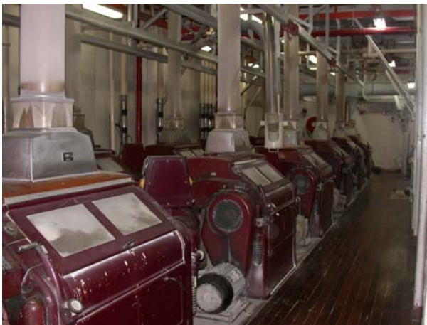
Figure 5.11 Flour Mill Building Level 1, showing rows of roller mills.

It appears that none of these mills is to be retained by Allied Mills.