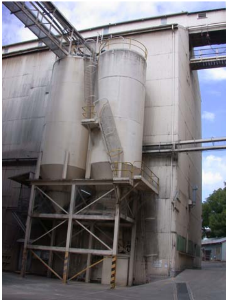
Figure 4.3 The Clean Wheat Bins Building. It is entirely occupied by timber silos.

Building 20 is located next to the eastern boundary adjacent to the rail line and comprises four large cylindrical concrete silos constructed in a square arrangement over a reinforced concrete slab. The metal clad elevator tower is located on the northern side and an escape ladder is located on the southern side of the silos.