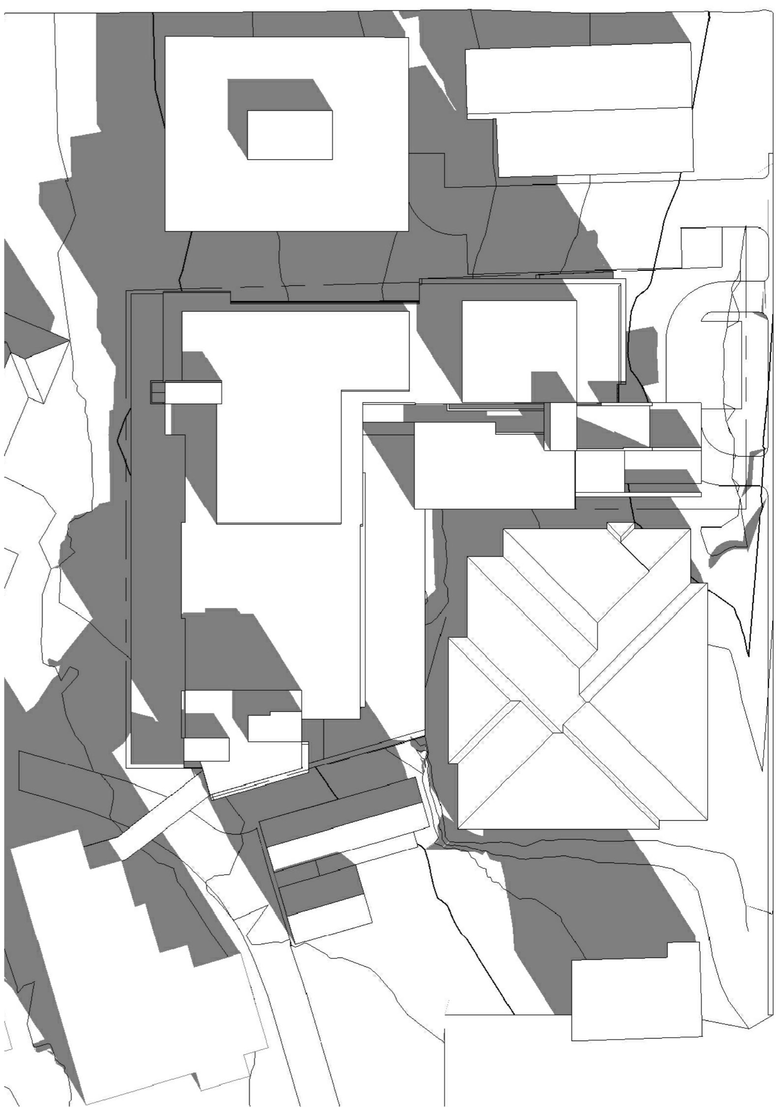
01 WINTER SOLSTICE-9AM N.T.S.