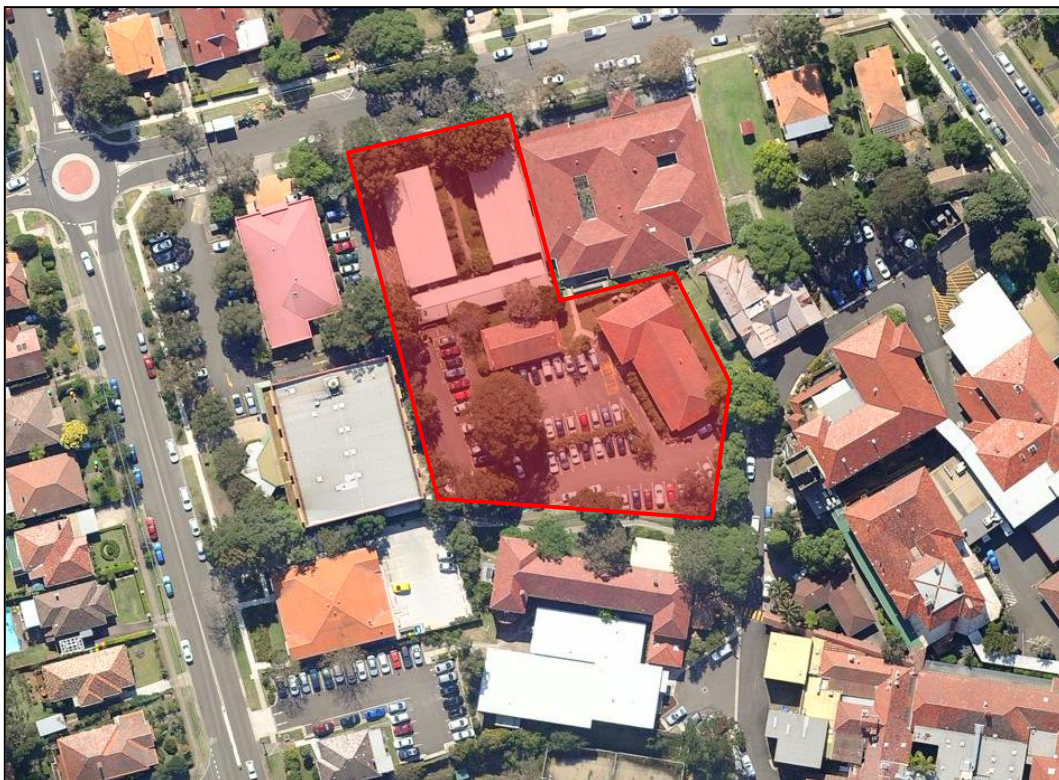
Figure 3: A close up of the previous aerial photograph showing Graythwaite (shaded in red) in relation to the streetscape of Fourth Avenue and Denistone and Ryedale Roads.

Immediately to the east of the site along Fourth Avenue is a metal clad single storey structure very similar to the adjacent building located within the subject site. The streetscape along the south side of Fourth Avenue is dominated by trees, and the later Hospital constructions on either side of the subject site. See the survey plan overleaf for an understanding of the site and the structures.