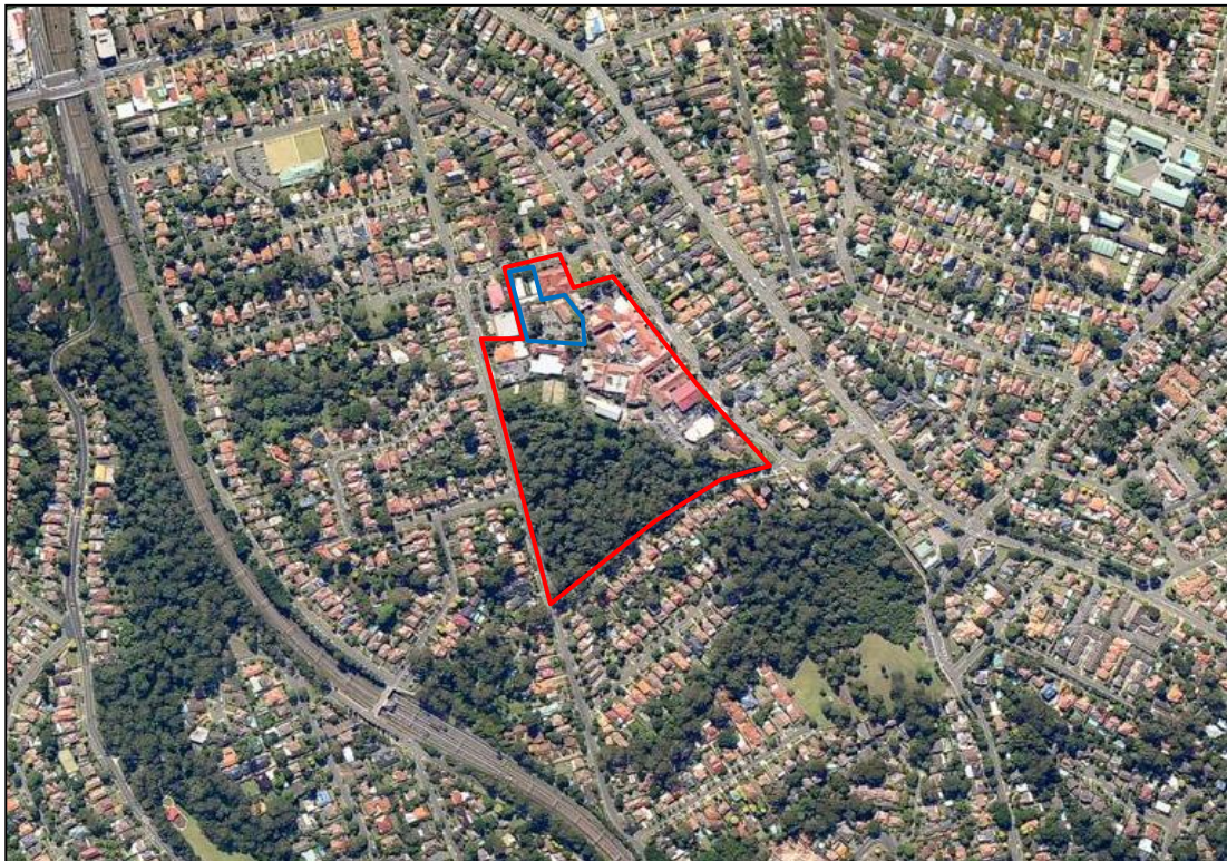
Figure 2: Aerial Photograph of the Ryde Hospital site, outlined in red. The location of the subject site is indicated in the blue area, fronting to Fourth Street.

The subject site is located within the Ryde Local Government Area. The subject site, at 37 Fourth Avenue, Denistone, is located on the southern side of the street between Ryedale Road and Denistone Road. This site, within the Ryde Hospital Campus, has been subdivided from the overall Ryde Hospital site and is identified as the Graythwaite Rehabilitation Centre . It is described in the NSW Land and Property Management Authority (LPMA) as Lot 1 of Deposited Plan 1137800. An AHIMS search to identify any previously recorded Aboriginal sites and places was also undertaken for Lot 2 of DP 1137800, however, that allotment has not been fully assessed as it is outside the scope of this report, see total site area in the figure below.