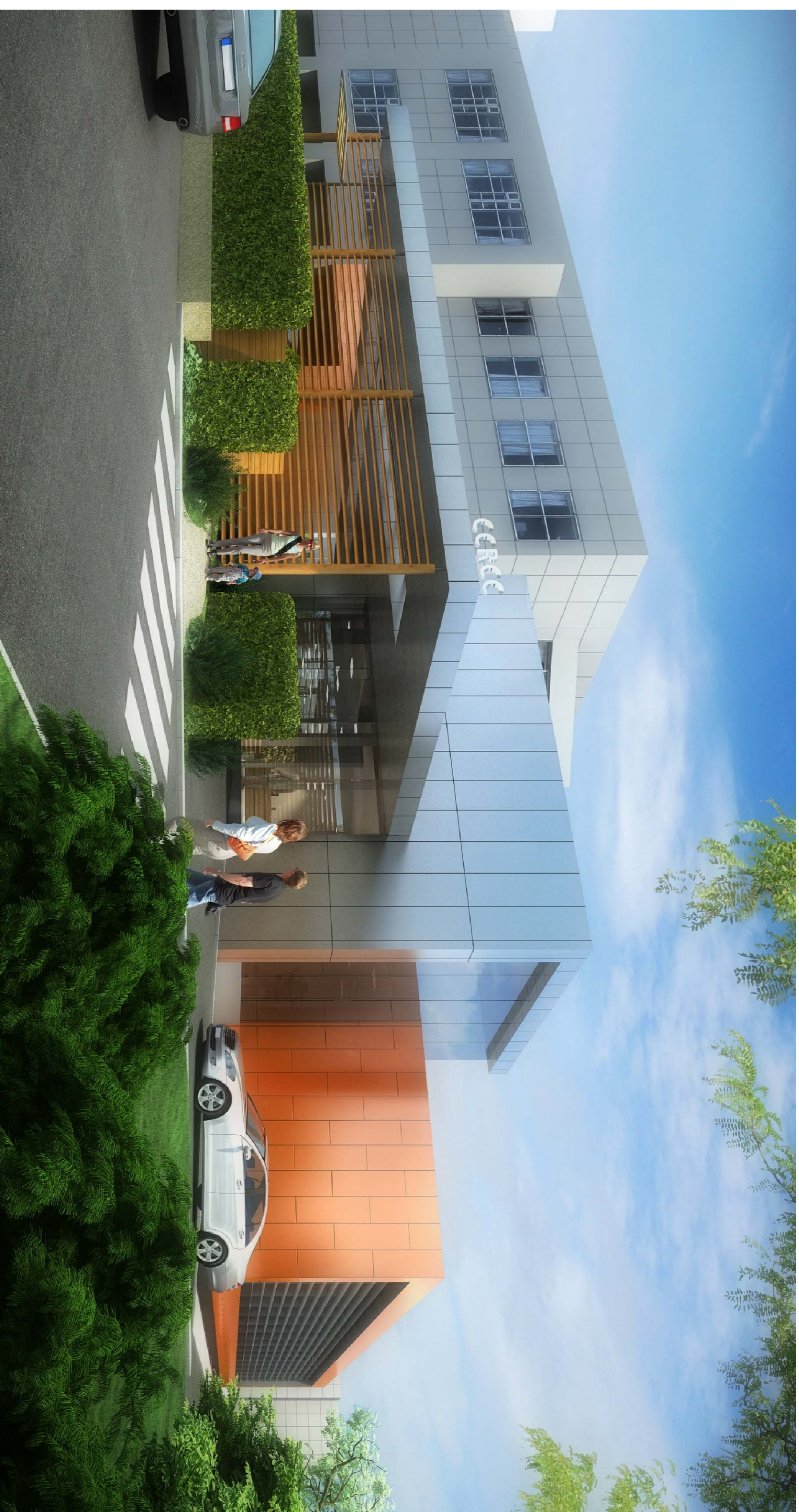
3D view 1 - south east