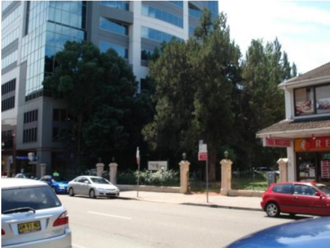
Figure 23 Willow Grove front garden with GE building at left. NBRSPartners, 2011.