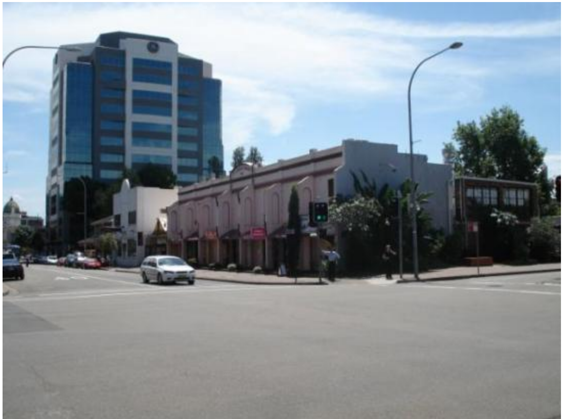
Figure 24 View west along Phillip Street with St George's Terrace in foreground. NBRS+Partners, 2011.

House group which makes a notable contribution to townscape due to similarities in age, design, use and materials. 9