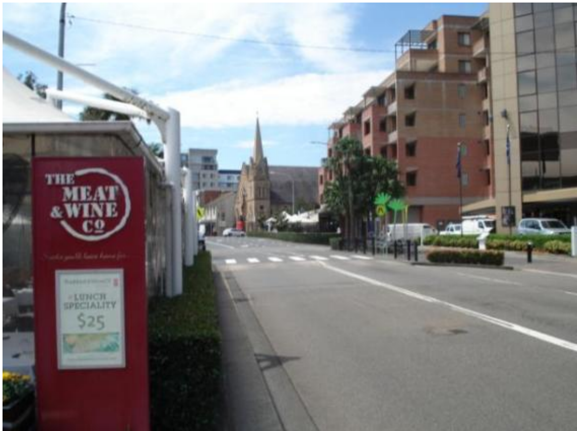
Figure 17 View from north of Lennox Bridge to St Peter's Uniting Church. NBRS+Partners, 2011.

Professional, trade and manufacturing practice - example of the work of notable architect. Evidence of social and cultural life. Site possesses potential to contribute to an understanding of early urban development in Parramatta. 4