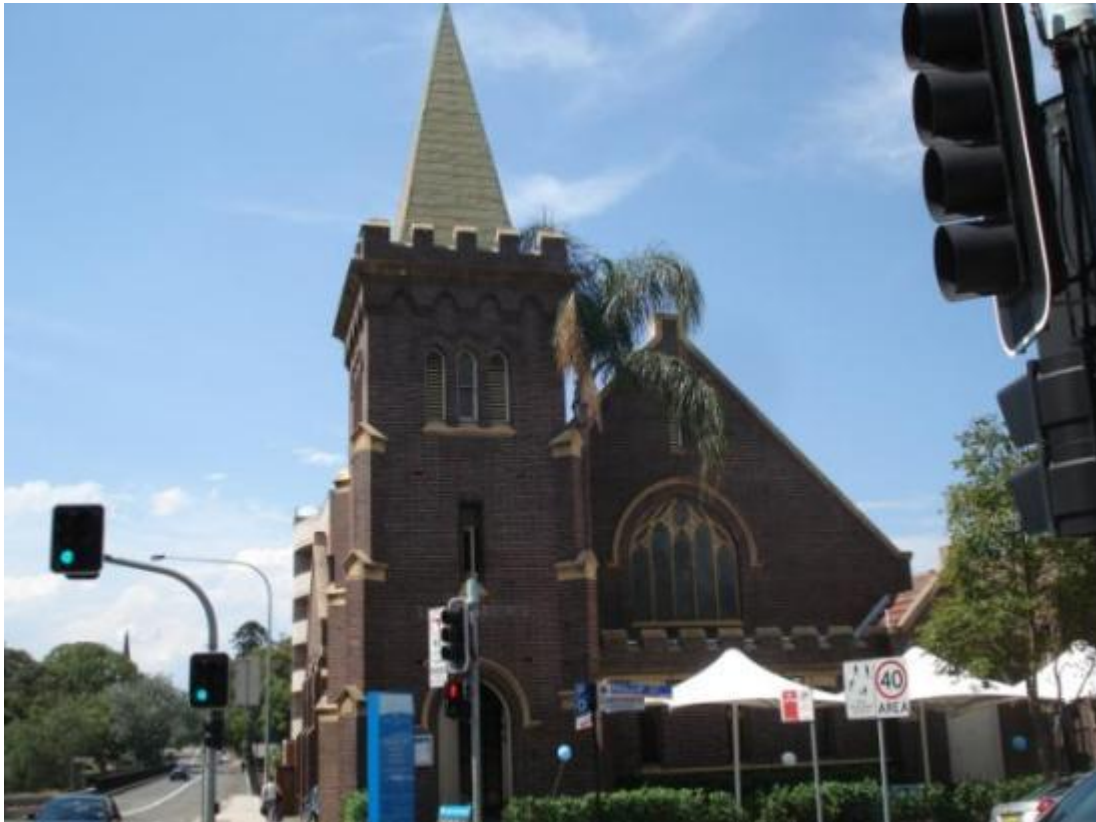
Figure 21 Former St Andrew's Uniting Church and Hall.

Evidence of social and cultural life. Site possesses potential to contribute to an understanding early urban development in Parramatta. National Trust (Parramatta Branch): Evidence of social and cultural life. Site possesses potential to contribute to an understanding of early urban development in Parramatta. 7