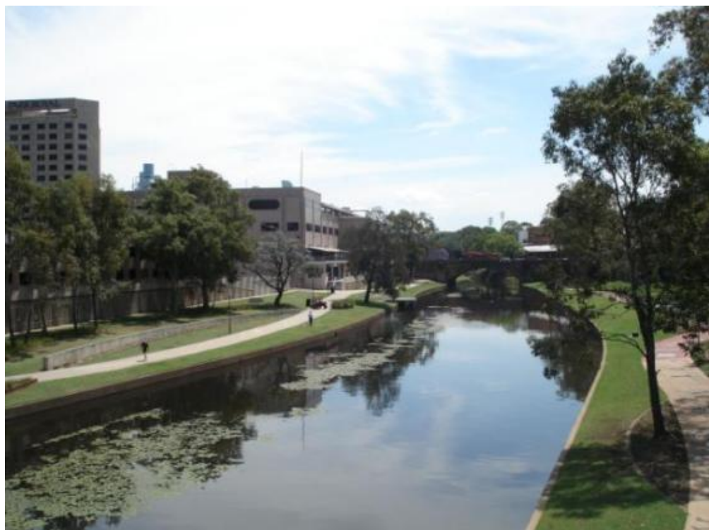
Figure 16 Lennox Bridge over the Parramatta River viewed from the east. NBRS+Partners, 2011.