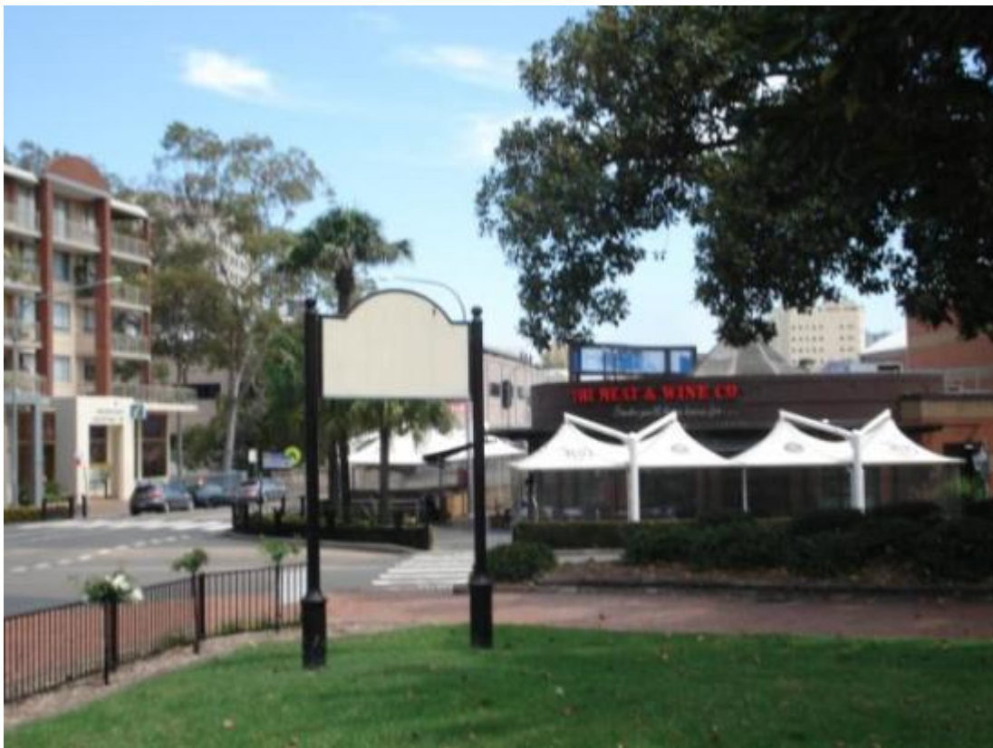
Figure 19 South east corner of Alfred Square looking towards development site. NBRS+Partners, 2011.

Views between the development site and this place are very limited due to planting and intervening structures. The development will be visible from the park but will not dominate it or overshadow it.