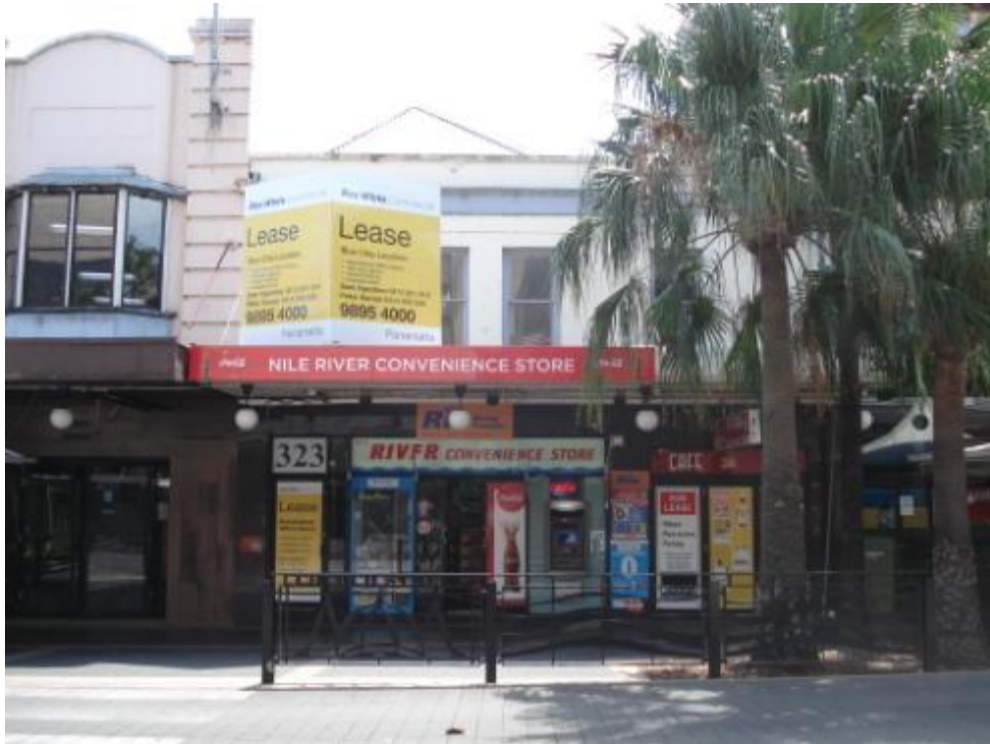
Figure 10 323 Church Street. NBRS+Partners, 2011.

The built heritage significance of 323 Church Street is as a component and contributing element in the largely intact late nineteenth century and early twentieth century two storey streetscape on the western side of Church Street.