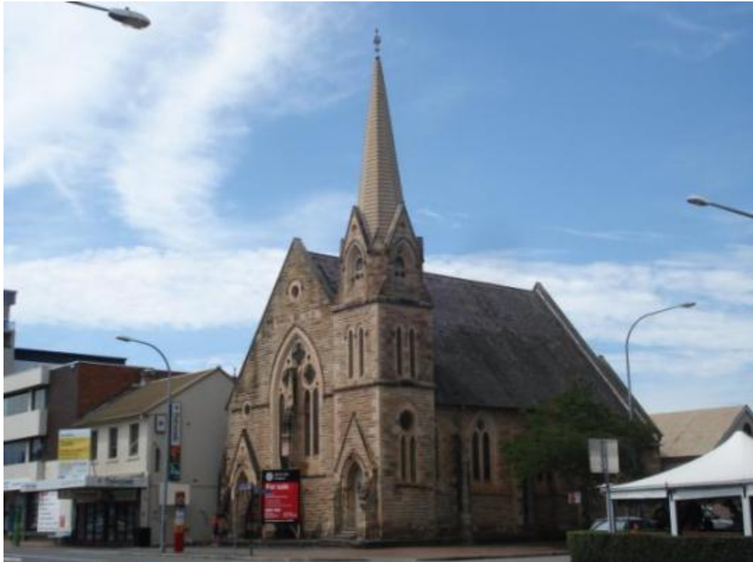
Figure 18 St Peter's Uniting Church. NBRS+Partners, 2011.