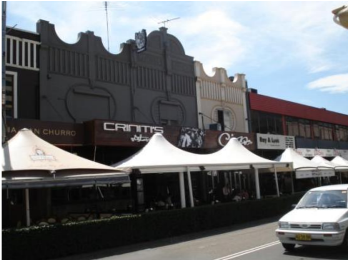
Figure 4 289-293 Church Street also known as Melville's Buildings. NBRS+Partners, 2011.

The built heritage significance of 289 - 293 Church Street (Melville's Buildings) is as a component and contributing element in the largely intact late nineteenth century and early twentieth century two storey streetscape on the western side of Church Street.