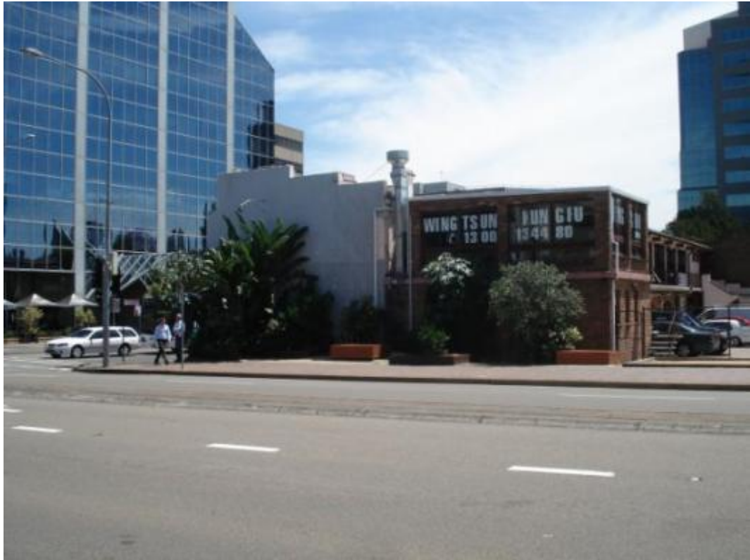
Figure 25 Side view of St George's Terrace. NBRSPartners, 2011.