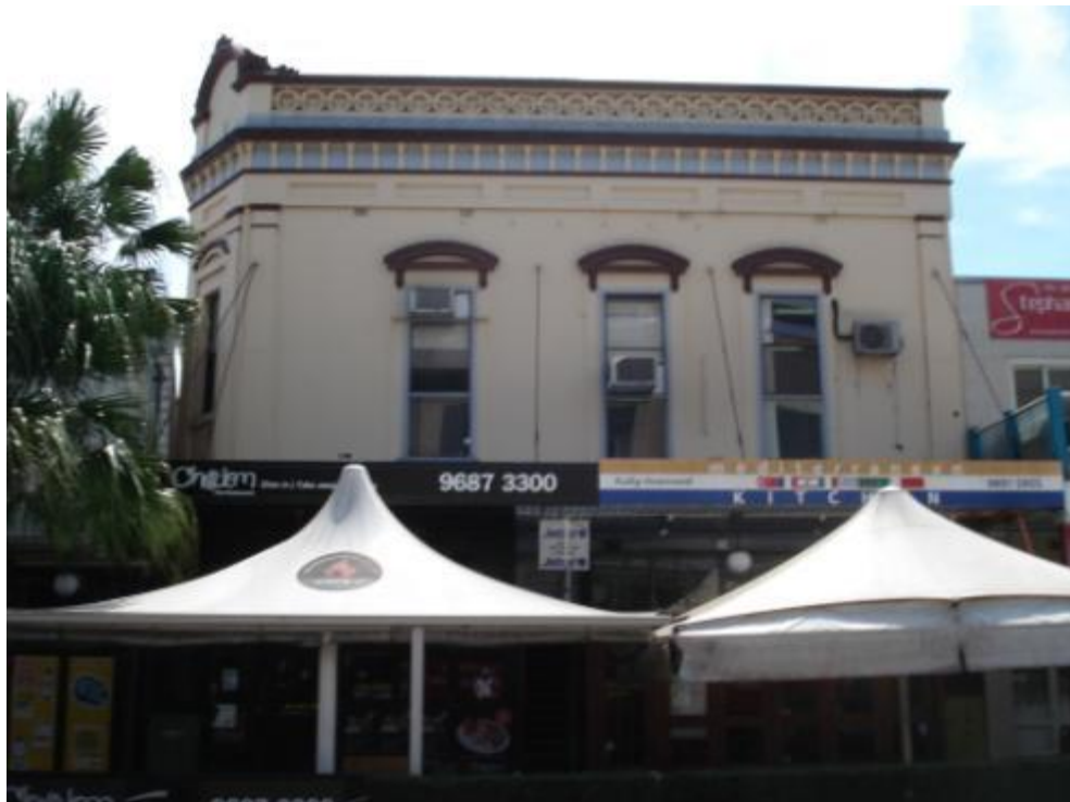
Figure 11 325-327 Church Street.

The built heritage significance of 325 - 327 Church Street is as a component and contributing element in the largely intact late nineteenth century and early twentieth century two storey streetscape on the western side of Church Street.