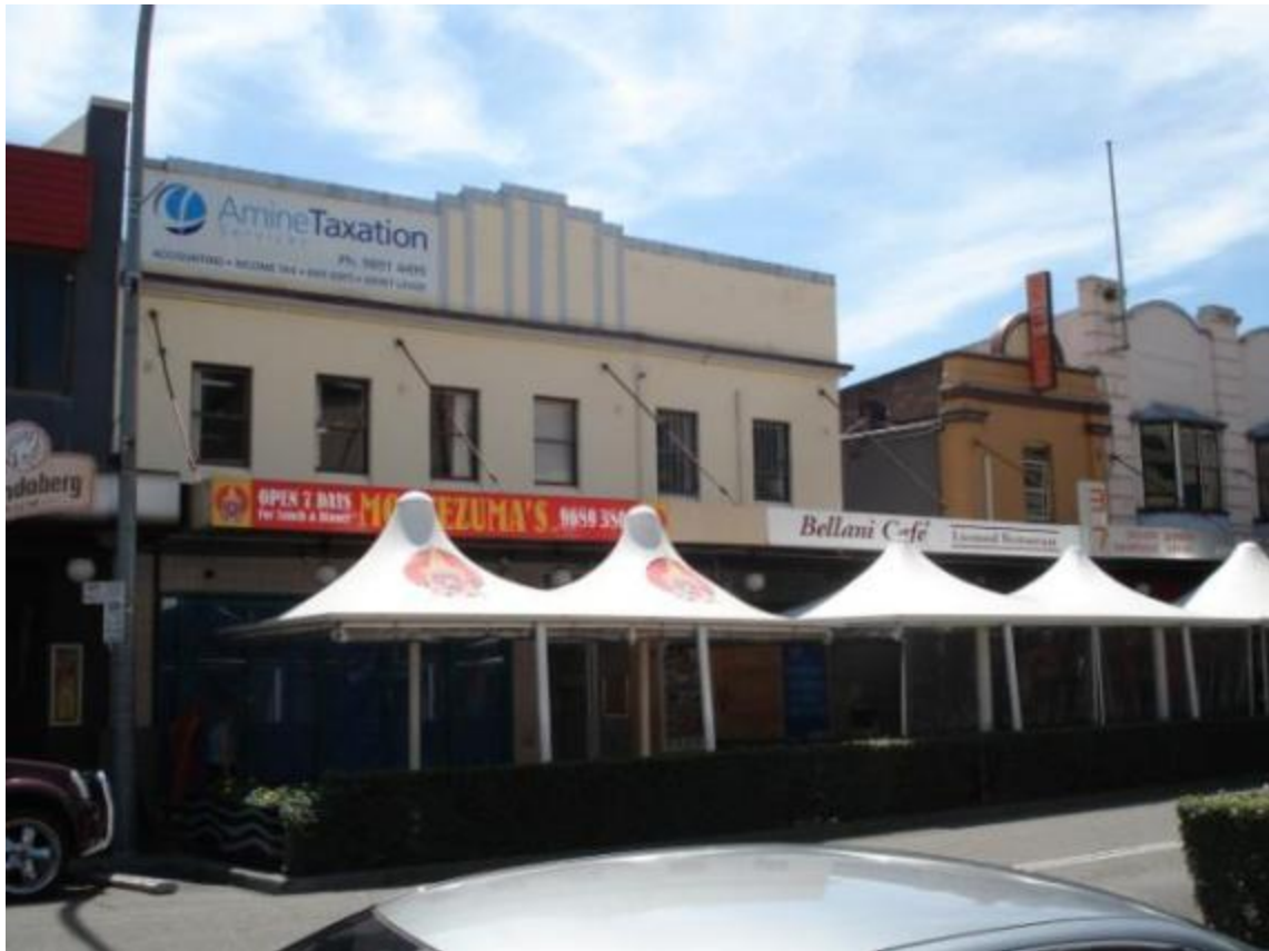
Figure 7 311-315 Church Street.

The built heritage significance of 311-315 Church Street is as a component and contributing element in the streetscape on the western side of Church Street in terms of its two storey scale and demonstration of development into the mid-twentieth century.