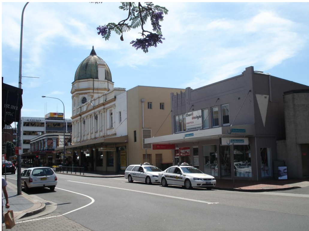
Figure 5 306 Church Street viewed from east along Phillip Street. NBRS+Partners, 2011.

As stated in the May 2011 assessment, the public appreciation of the landmark building from ground level will not be impacted upon significantly and adversely by the proposed development.