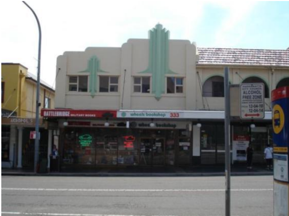
Figure 13 333 Church Street. NBRS+Partners, 2011.

The built heritage significance of 333 Church Street is as a component and contributing element in the streetscape on the western side of Church Street in terms of its two storey scale and demonstration of development into the mid-twentieth century in its featurist, modern style.