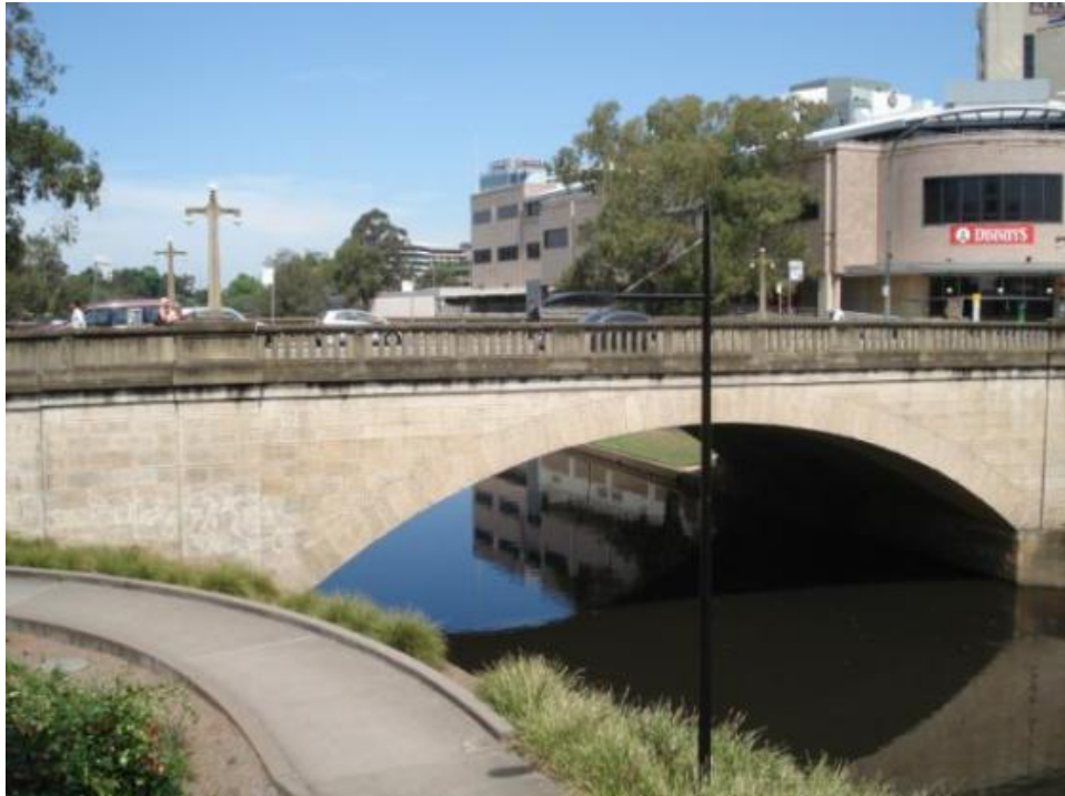
Figure 15 Lennox Bridge over the Parramatta River viewed from the west. NBRS+Partners, 2011.