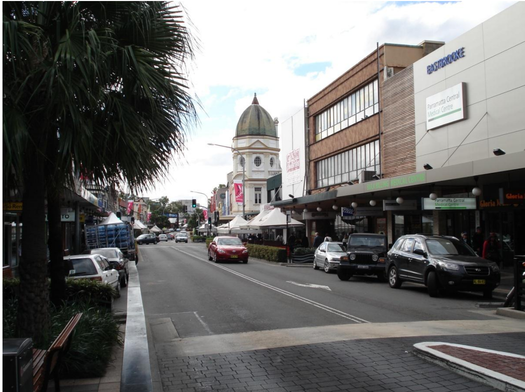
Figure 6 306 Church Street viewed from south along Church Street. NBRSPartners, 2008.