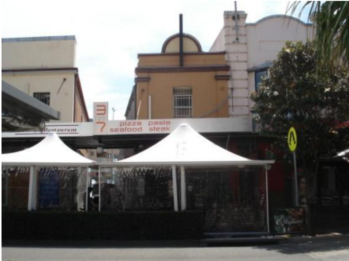
Figure 8 317 Church Street. NBRS+Partners, 2011.

The built heritage significance of 317 Church Street is as a component and contributing element in the largely intact late nineteenth century and early twentieth century two storey streetscape on the western side of Church Street.