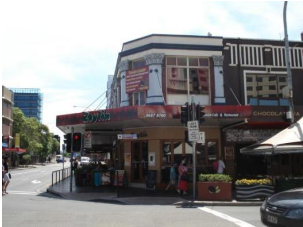
Figure 2 285 Church Street. NBRS+Partners, 2011.

No database entry could be found on the State Heritage Inventory on this place. The street address of Item 74 appears to be 285 Church Street (Lot 3 DP 610555). 281 is part of a group of commercial buildings on the southwest corner of Phillip and Church Streets. The built heritage significance of 285 Church Street is as a component and contributing element in the largely intact late nineteenth century and early twentieth century two storey streetscape on the western side of Church Street.