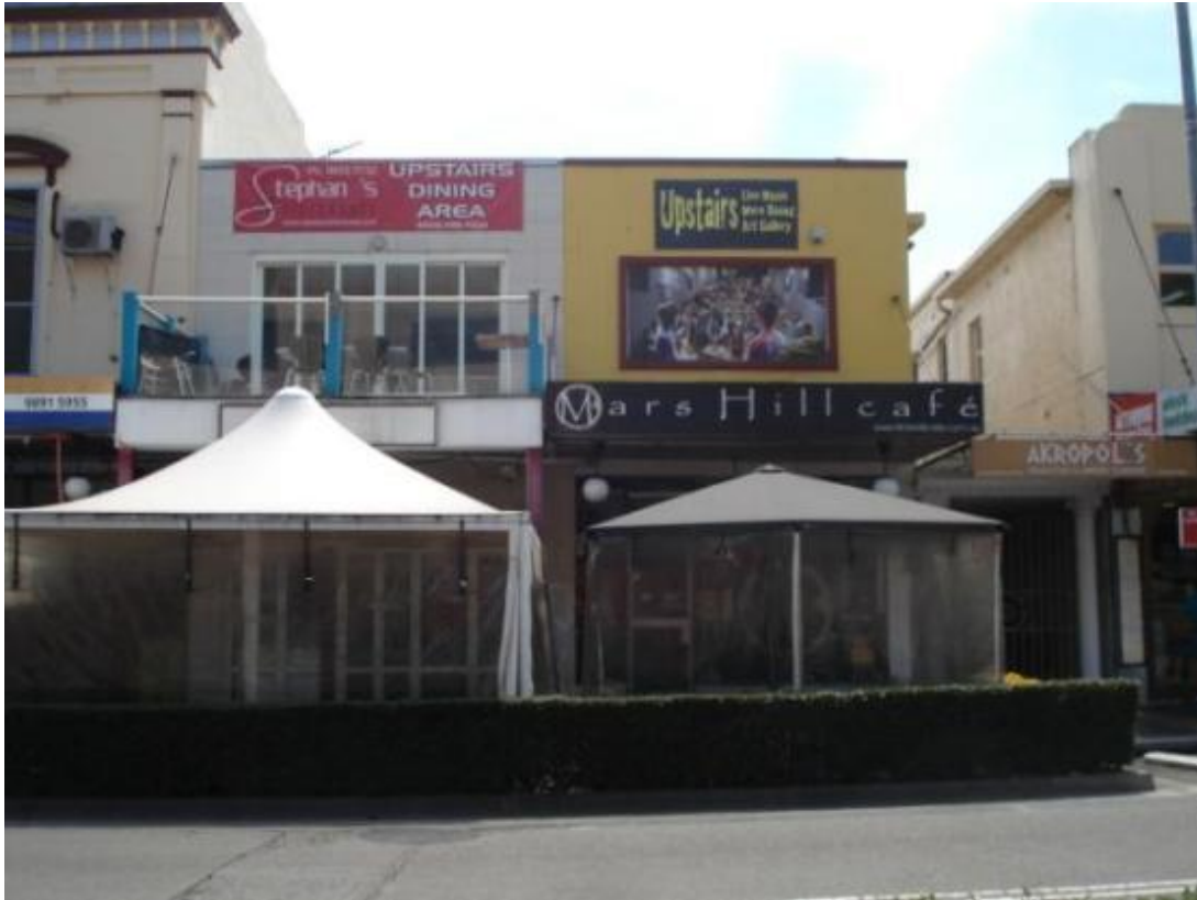
Figure 12 329-331 Church Street.

It is understood this place has been listed for its archaeological potential which would be unaffected by development on adjacent sites.