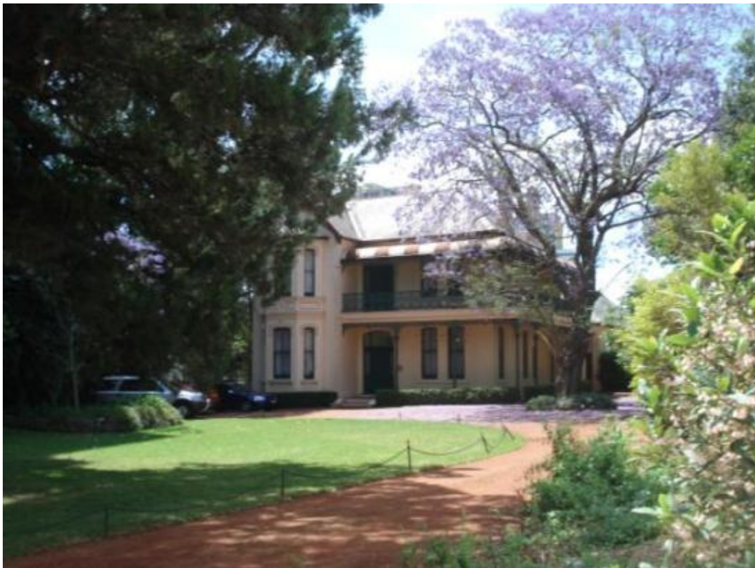
Figure 22 Willow Grove viewed from Phillip Street. NBRS+Partners, 2011.

The place is edged and overshadowed along its western boundary by the mid-rise office tower known as the GE building. This edge buffers the place from any development that could be carried out on the subject development site further to the north and west. Therefore, the impacts will be minimal.