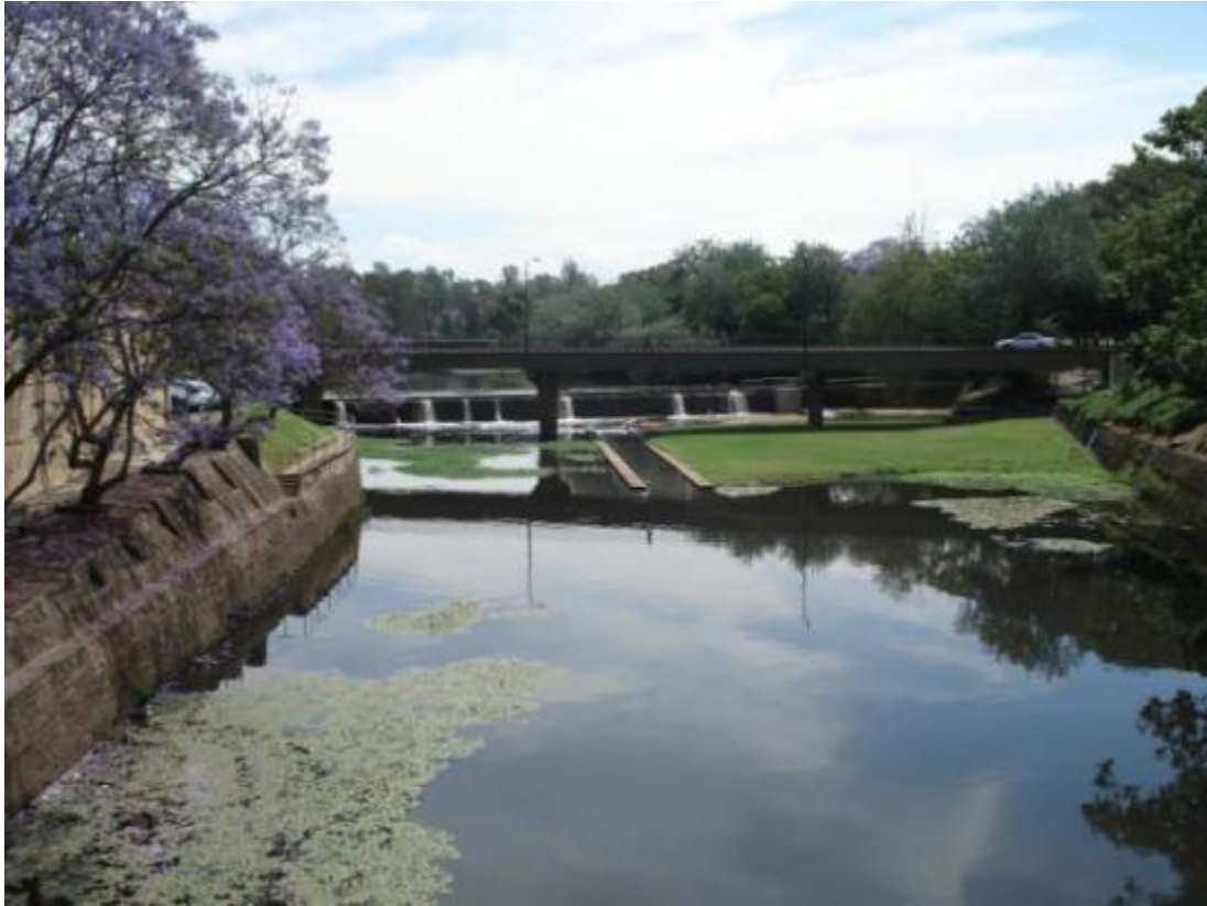
Figure 20 Parramatta Dam in distance from Lennox Bridge. NBRSPartners, 2011.

Amenities & services - regional or local. 6