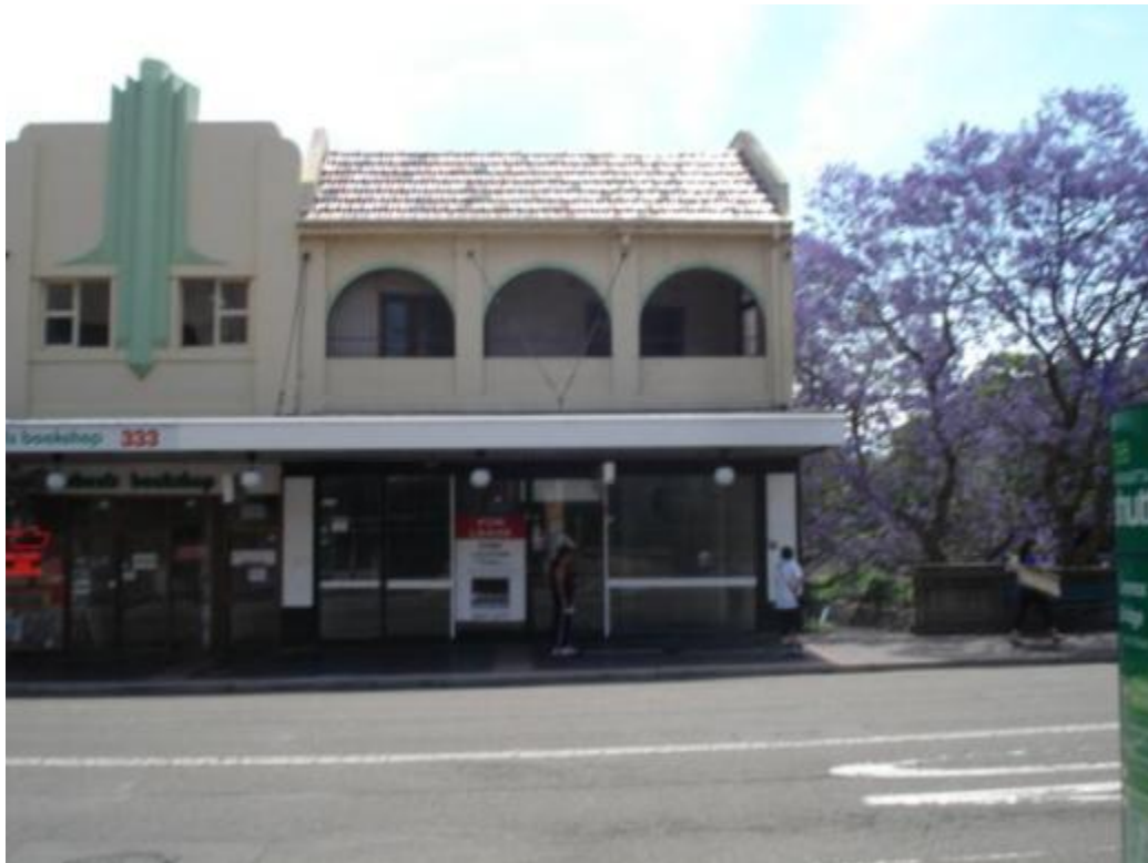
Figure 14 339 Church Street. NBRS+Partners, 2011.

The built heritage significance of 339 Church Street is as a component and contributing element in the largely intact late nineteenth century and early twentieth century two storey streetscape on the western side of Church Street.