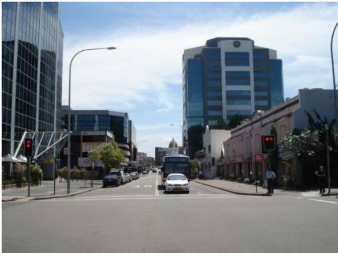
Figure 26 View west along Phillip Street. NBRSPartners, 2011.