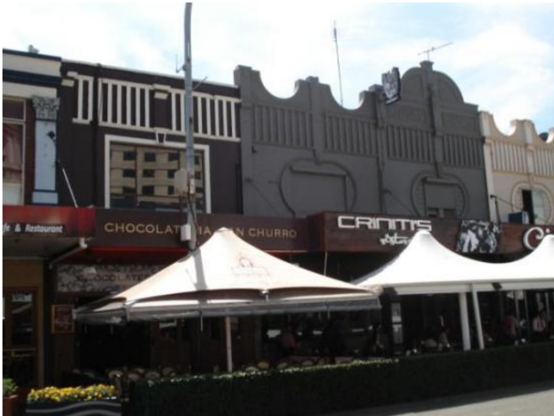
Figure 3 287 Church Street (Chocolateria San Churro). NBRS+Partners, 2011.

The built heritage significance of 287 Church Street is as a component and contributing element in the largely intact late nineteenth century and early twentieth century two storey streetscape on the western side of Church Street.