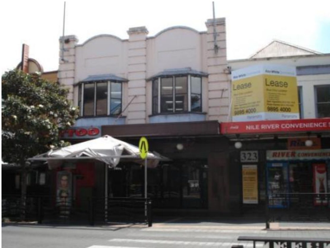
Figure 9 321 Church Street. NBRS+Partners, 2011.

The built heritage significance of 321 Church Street is as a component and contributing element in the largely intact late nineteenth century and early twentieth century two storey streetscape on the western side of Church Street.