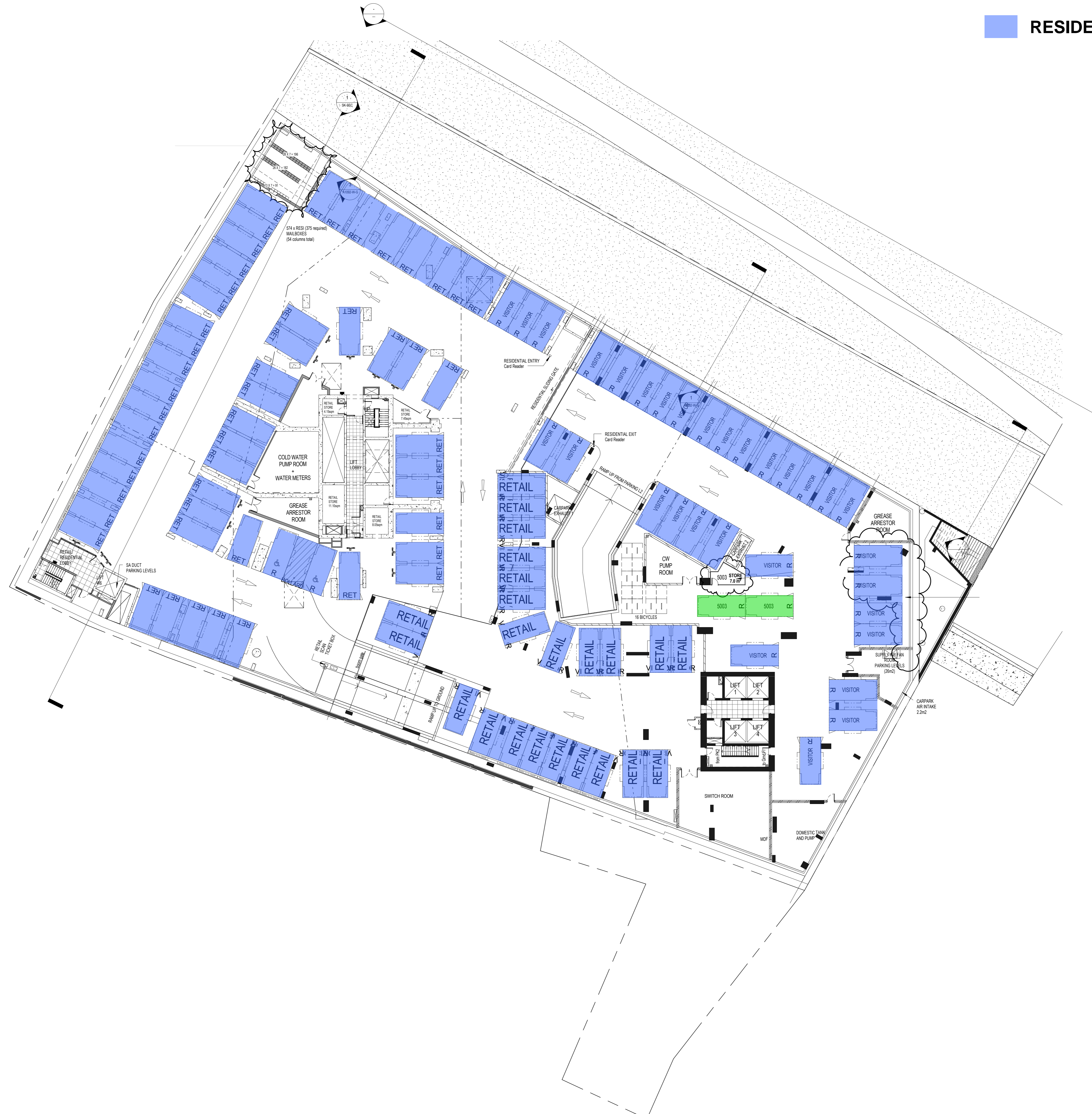
1 Parking 1 - 200 1:200