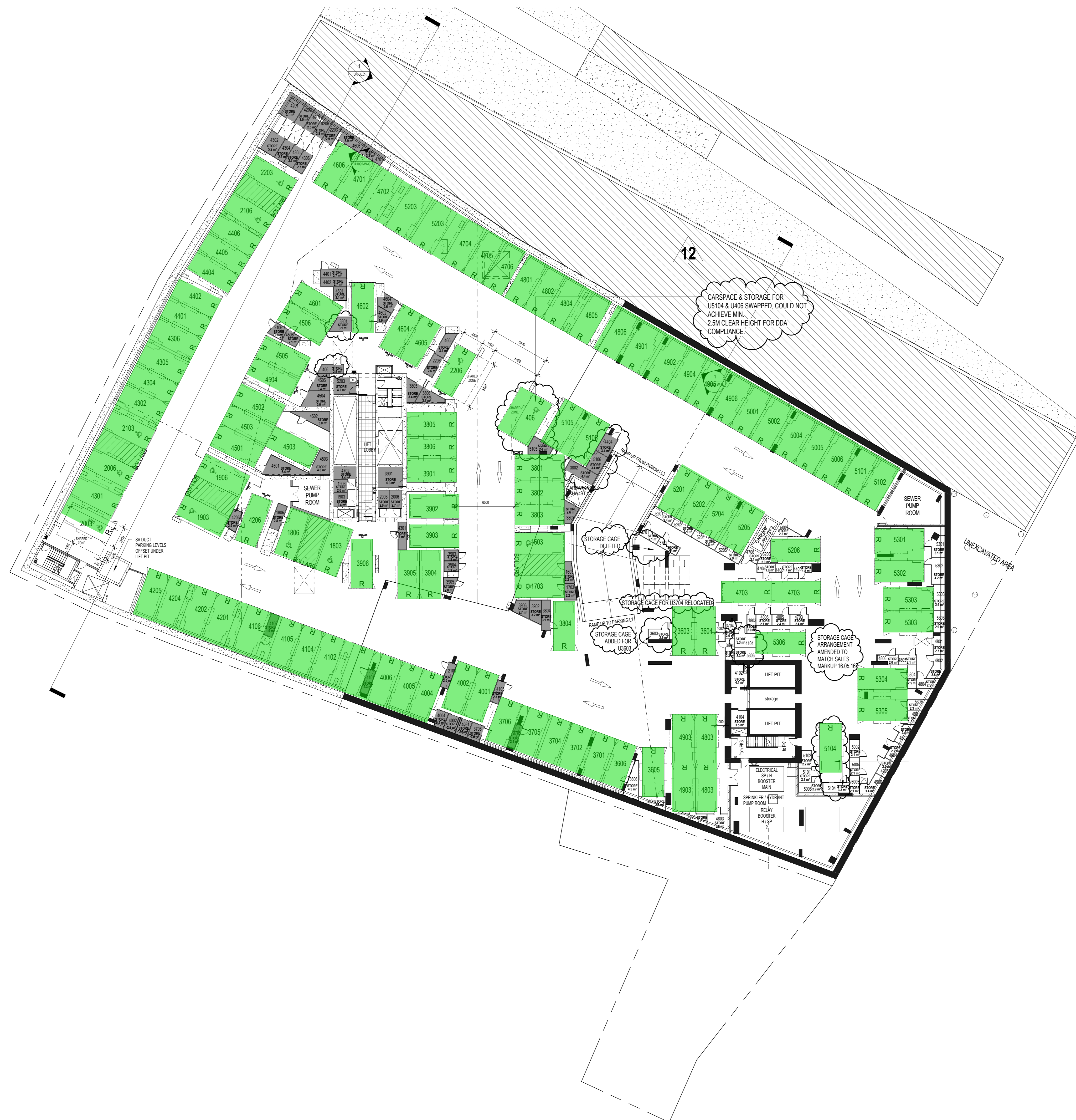
1 Parking 2 - 200 1:200