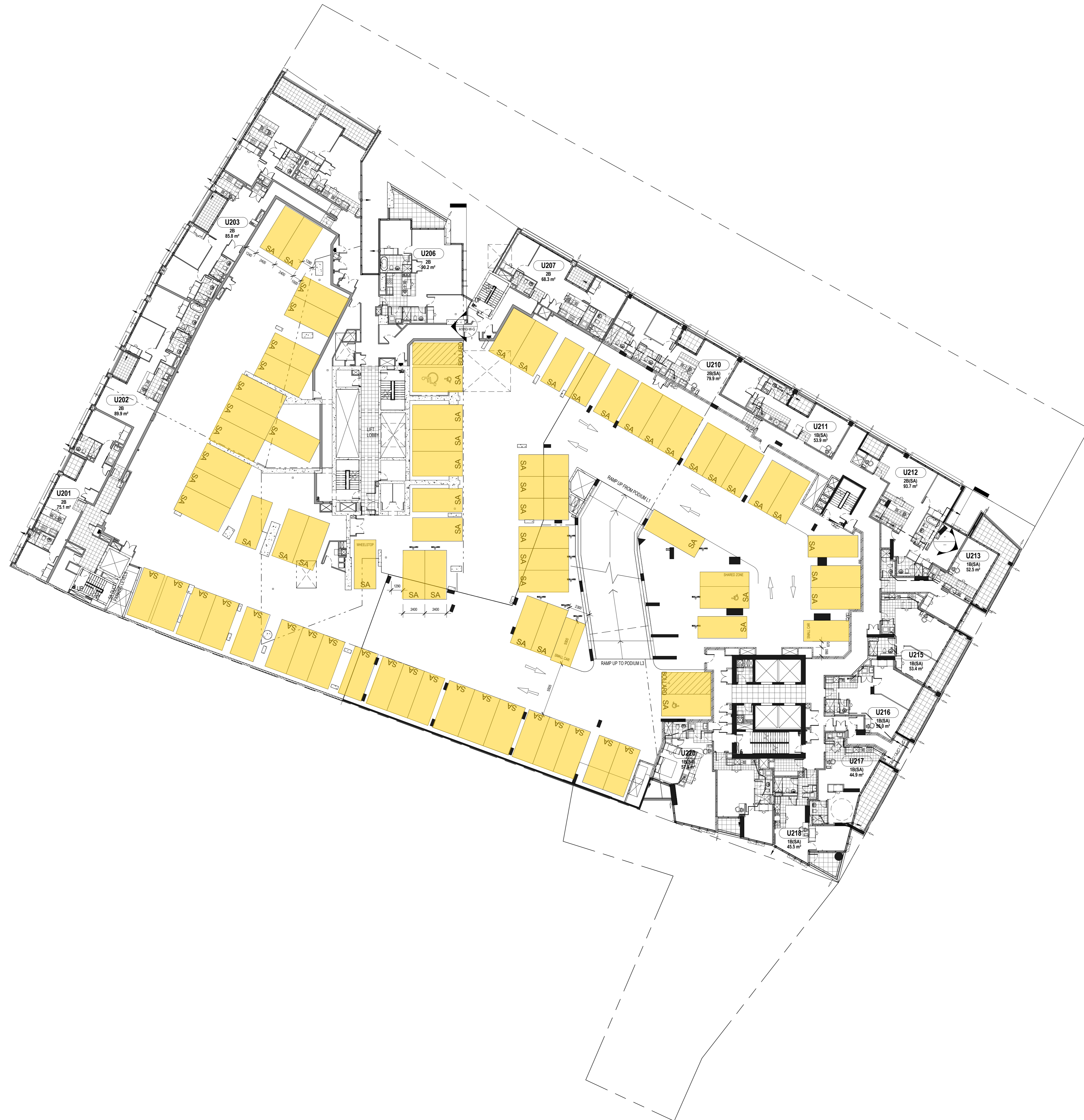
1 Level 2 - 200 1:200