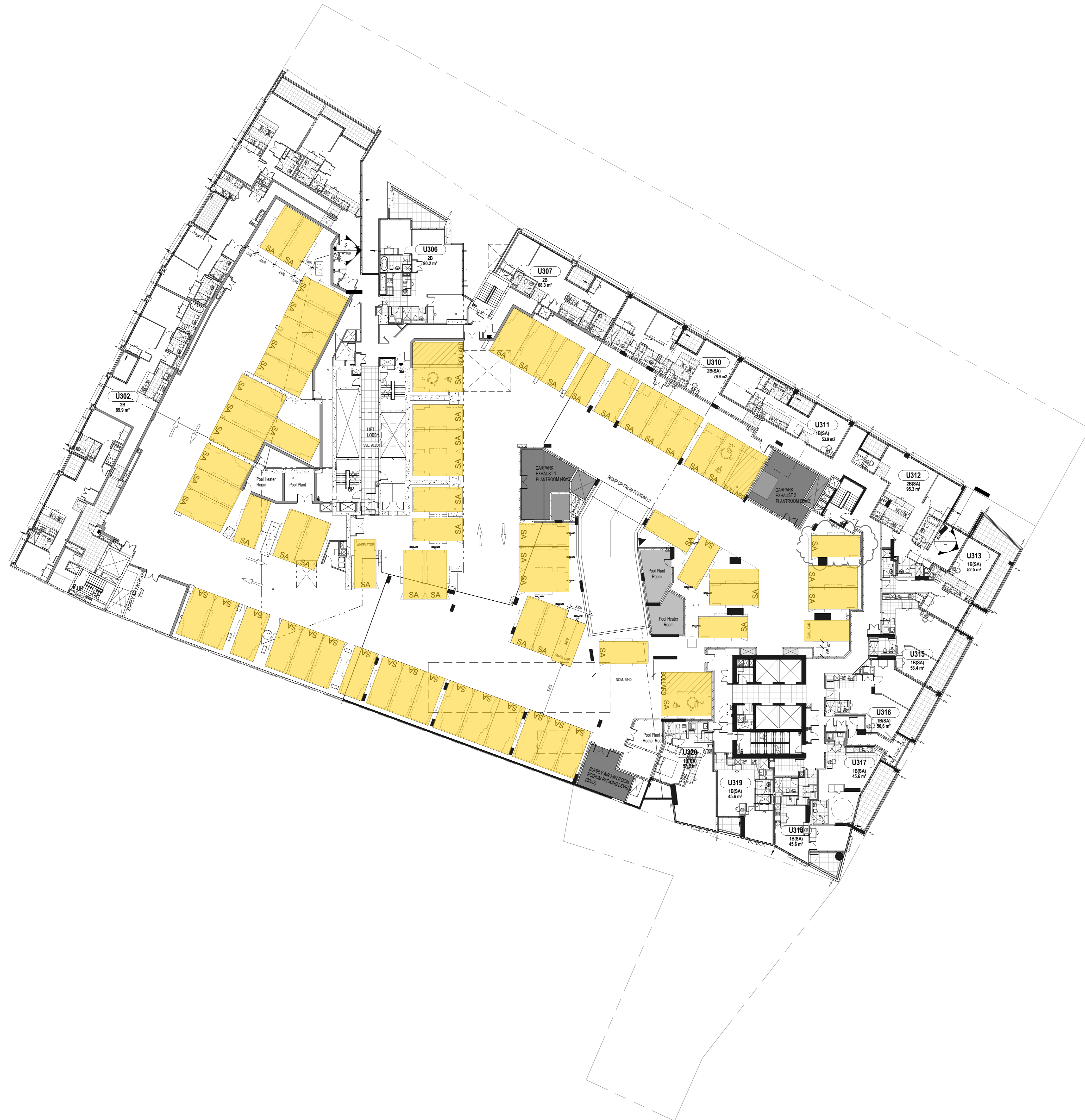
1 Level 3 - 200 1:200