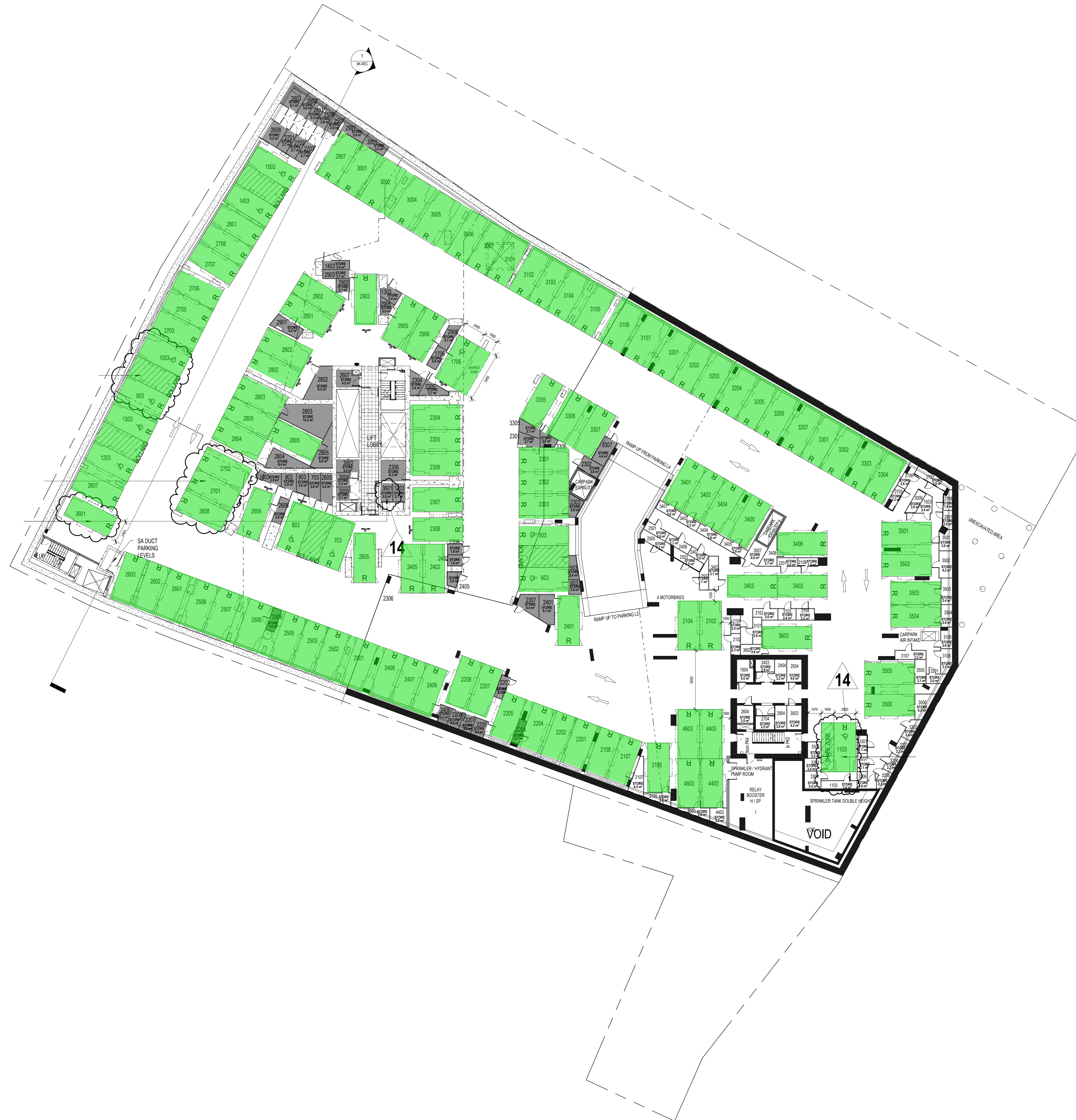
1 Parking 3 - 200 1:200