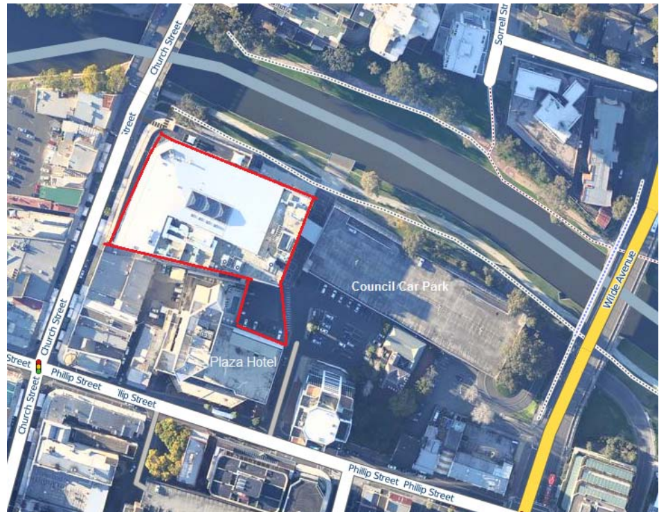
Figure 2: Aerial views of site showing approximate boundary location