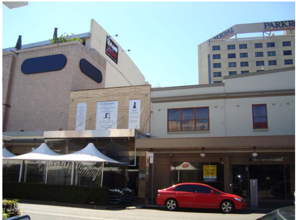
Figure 5: Existing building (left) and interface with adjoining development on Church Street