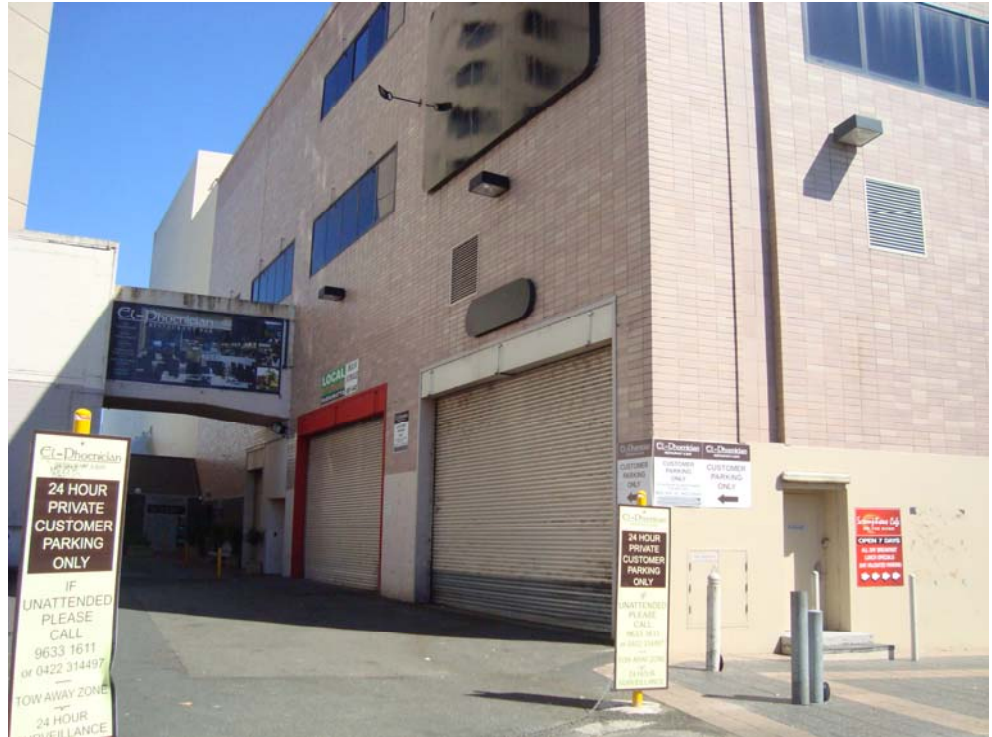
Figure 4: Existing building viewed from the rear (adjacent to Council carpark)