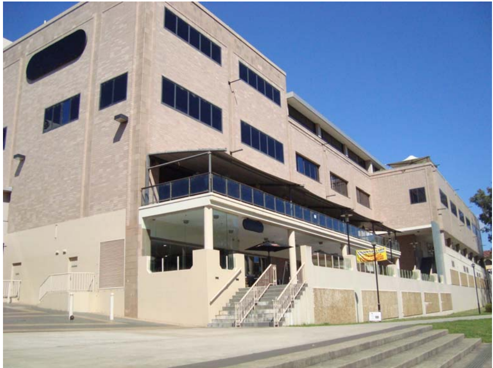
Figure 3: Existing building on site as it presents to the Parramatta River foreshore

Figures 3 to 5 show the subject site and its existing improvements.