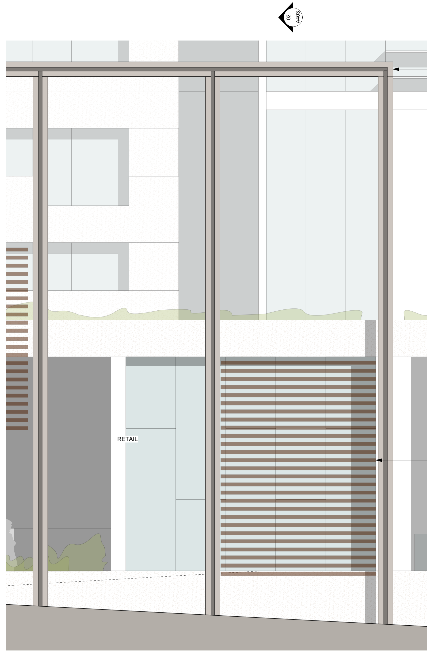
01 EASTERN ELEVATION 1:50

MICACEOUS 'GRAPHITE' PAINTED STEEL FRAME WITH SAWCUT SANDSTONE CLADDING