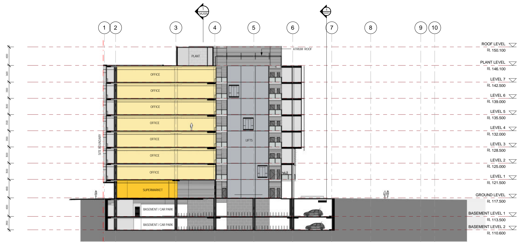
1 Section 2 1 : 200