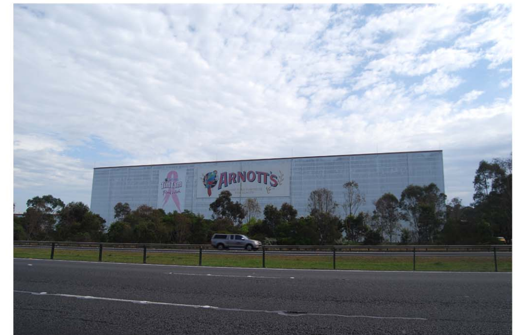
PRECEDENT IMAGE ARNOTT'S HIGH BAY WAREHOUSE APPROX 30M HIGH