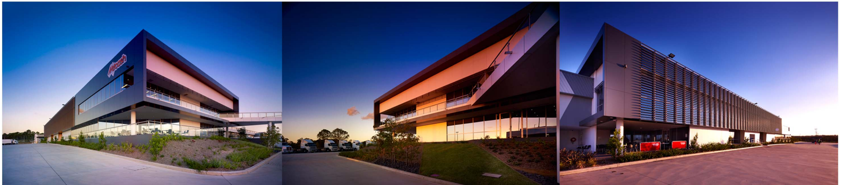
AS BUILT METCASH FACILITY