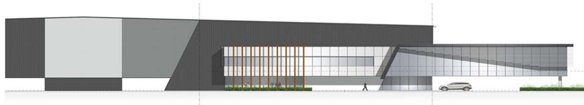
CURRENT FACADE DESIGN FOR ESTATE SITE 2A / 2B