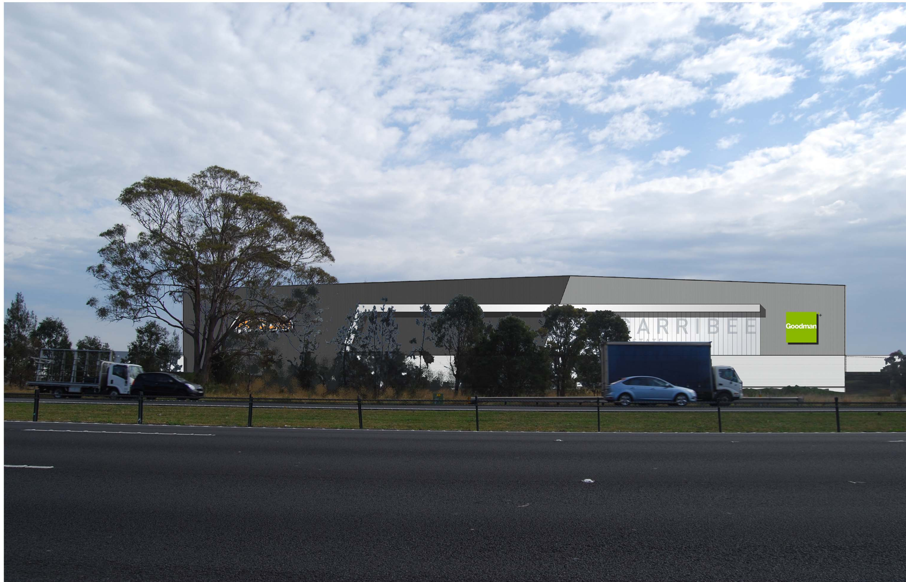
PHOTO MONTAGE - SOUTH ELEVATION TO M4 MORTORWAY