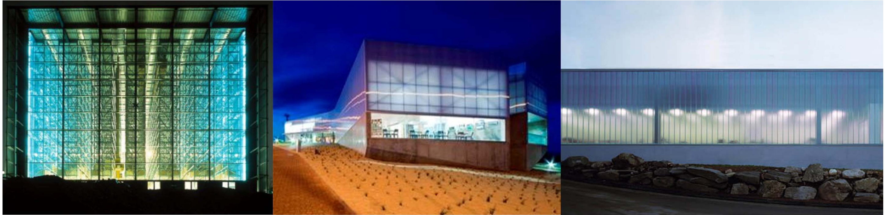
OPTIONAL BACKLIGHTING TO CREATE FOCAL POINTS AND REDUCE SCALE OF FACADE