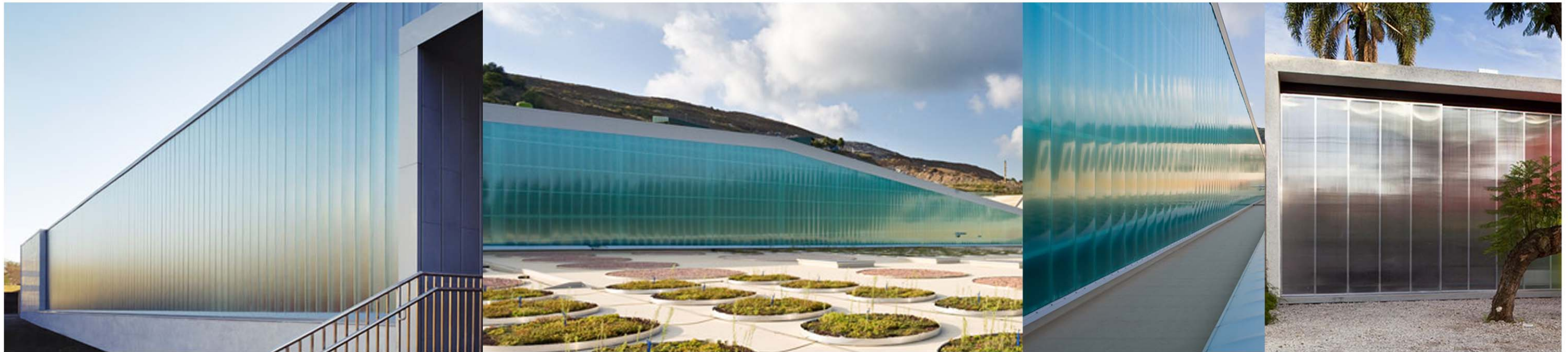
SEAMLESS POLYCARBONATE WALL SHEETING WITH FEATURE BAND FRAMING