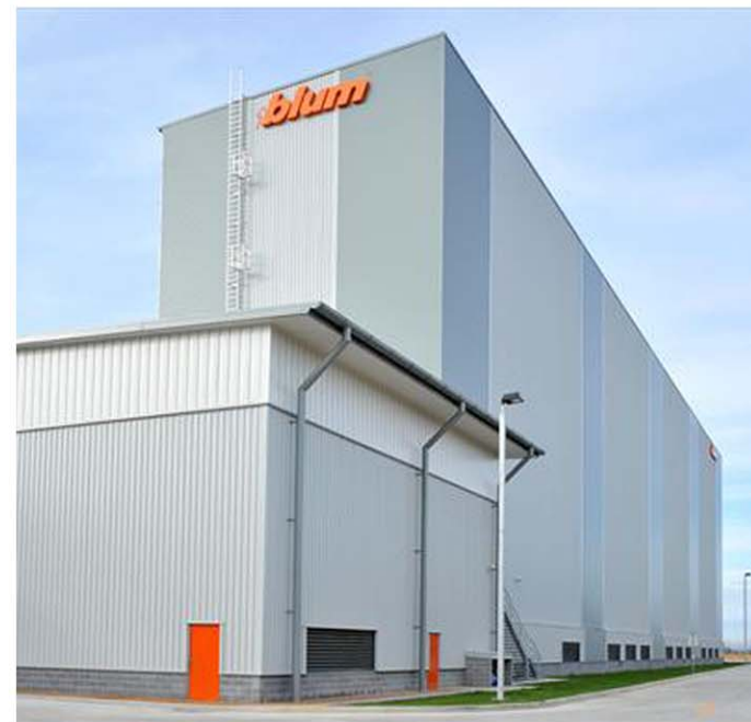
PRECEDENT IMAGE BLUM HIGH BAY WAREHOUSE APPROX 30M HIGH