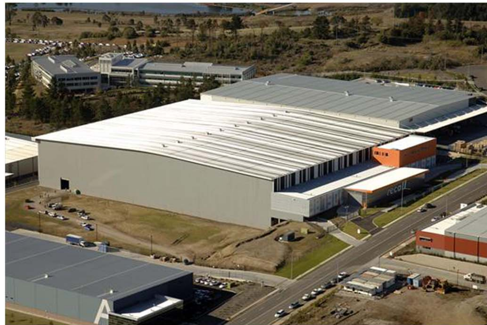
PRECEDENT IMAGE RECALL HIGH BAY WAREHOUSE APPROX 30M HIGH