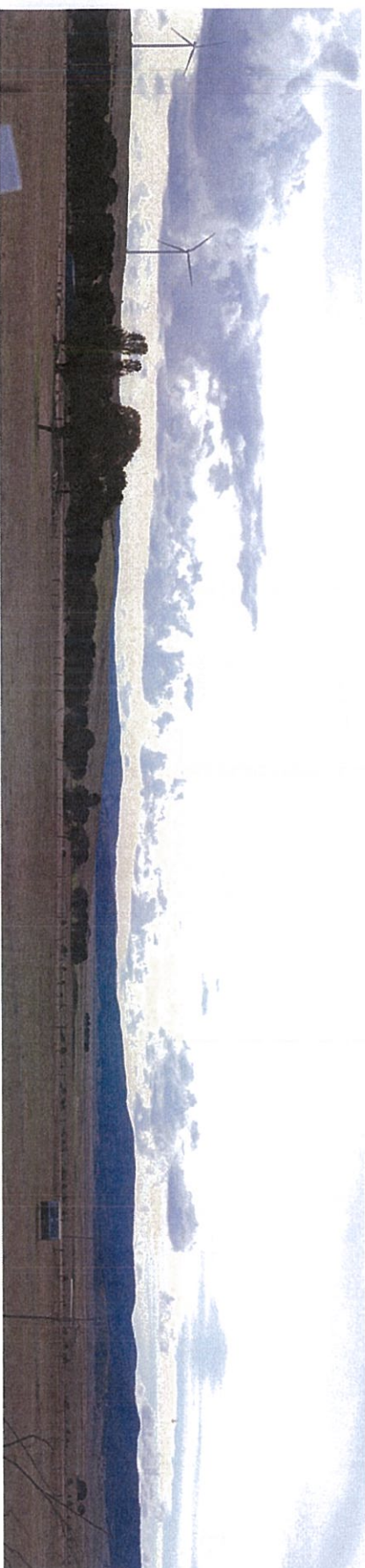
Photograph cropped from Viewpoint WF03.