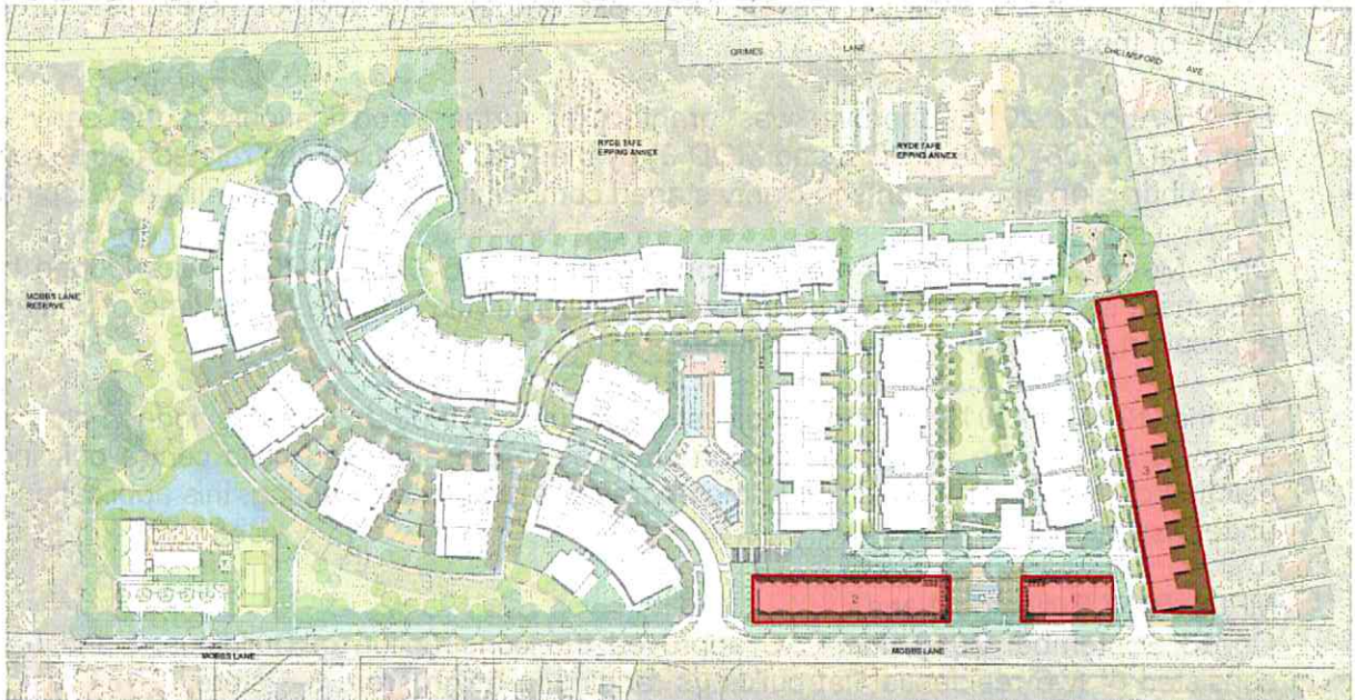
Figure 2: Site plan identifying buildings approved under the MP10_0107 (Buildings 1, 2 and 3)

On 16 April 2012, a fifth modification (MOD 5) was approved by the Deputy Director-General for external design changes to Building 3.