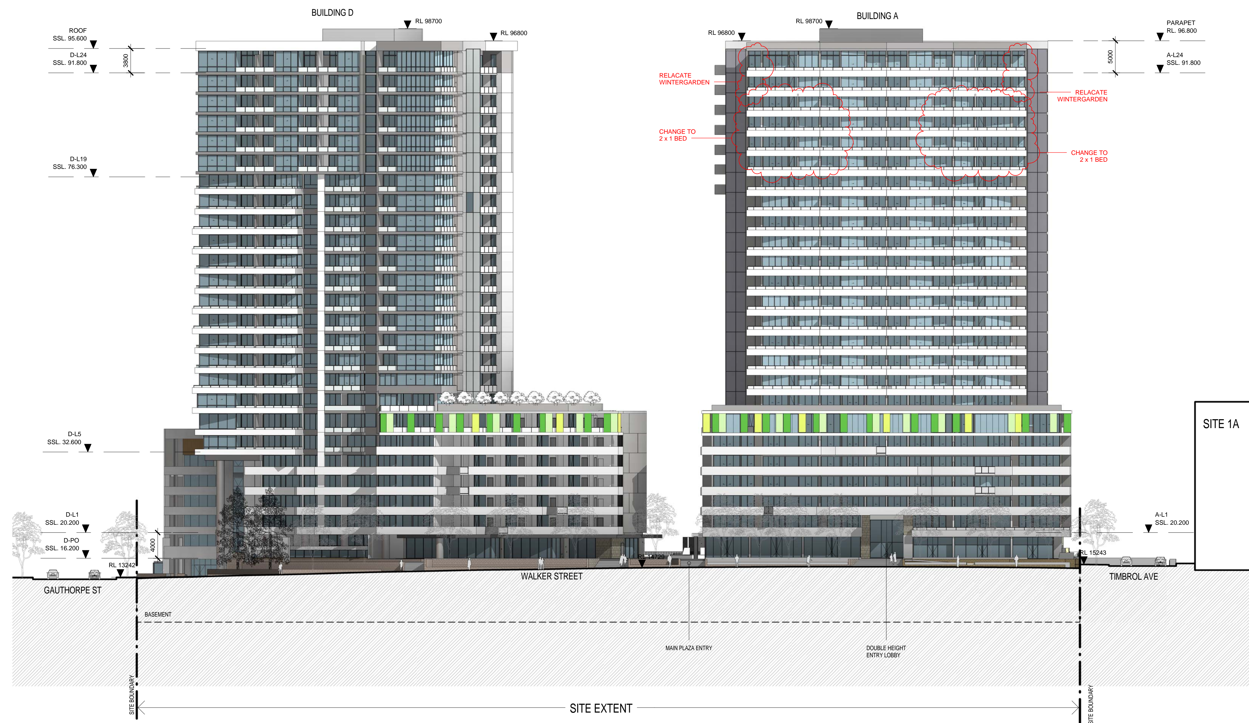
1 ELEVATION Walker Street Elevation 1:350