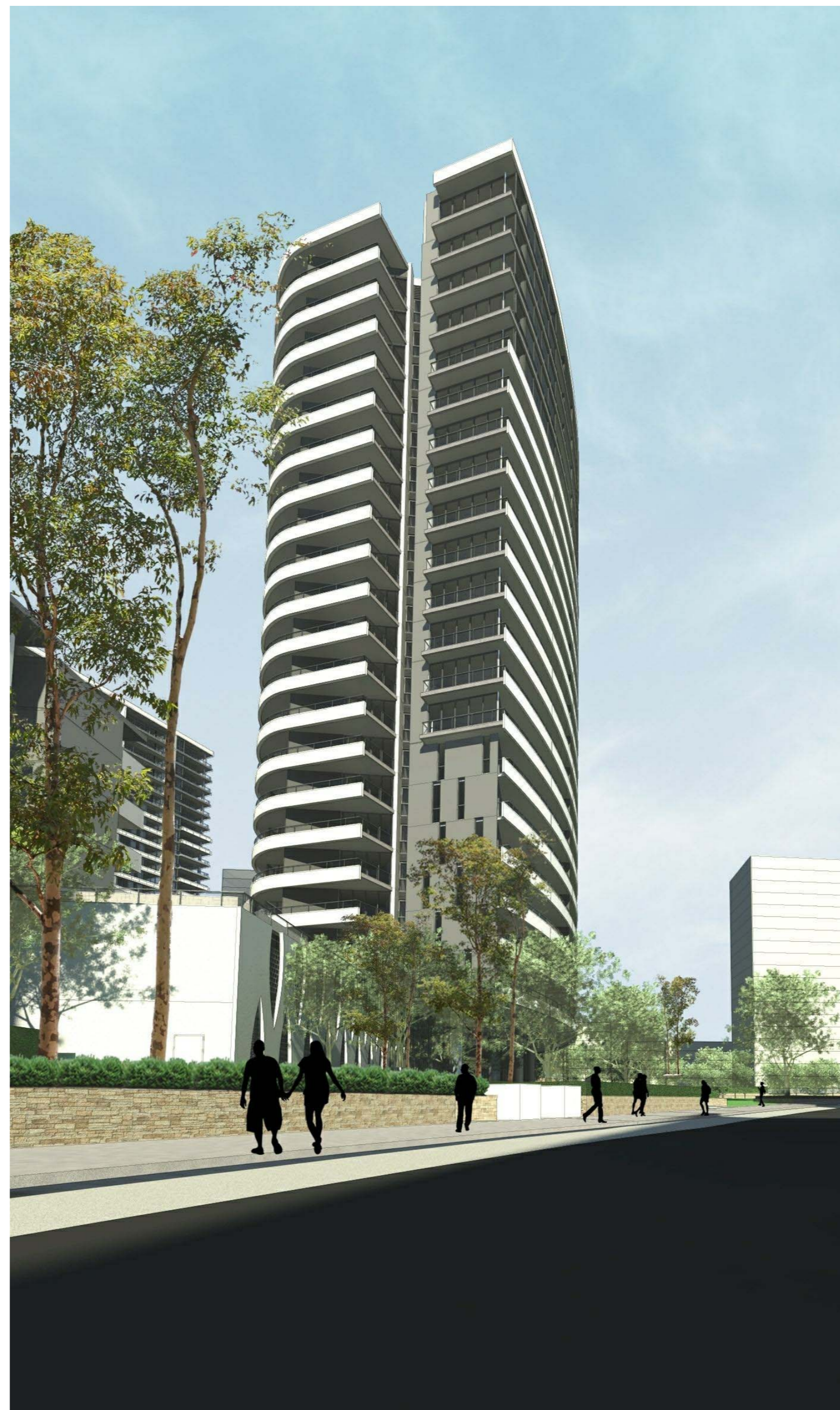
3. Shoreline Ave Looking South