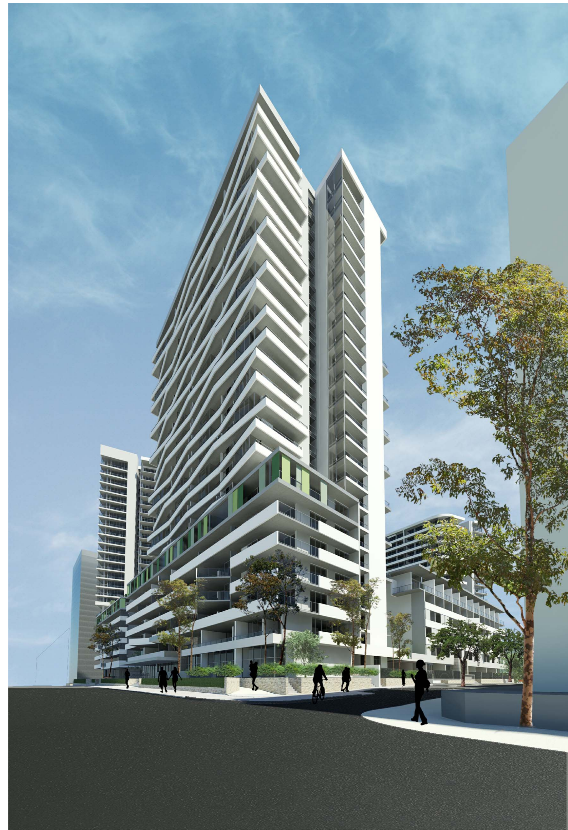
2. Walker Street and Timbrol Ave Looking South