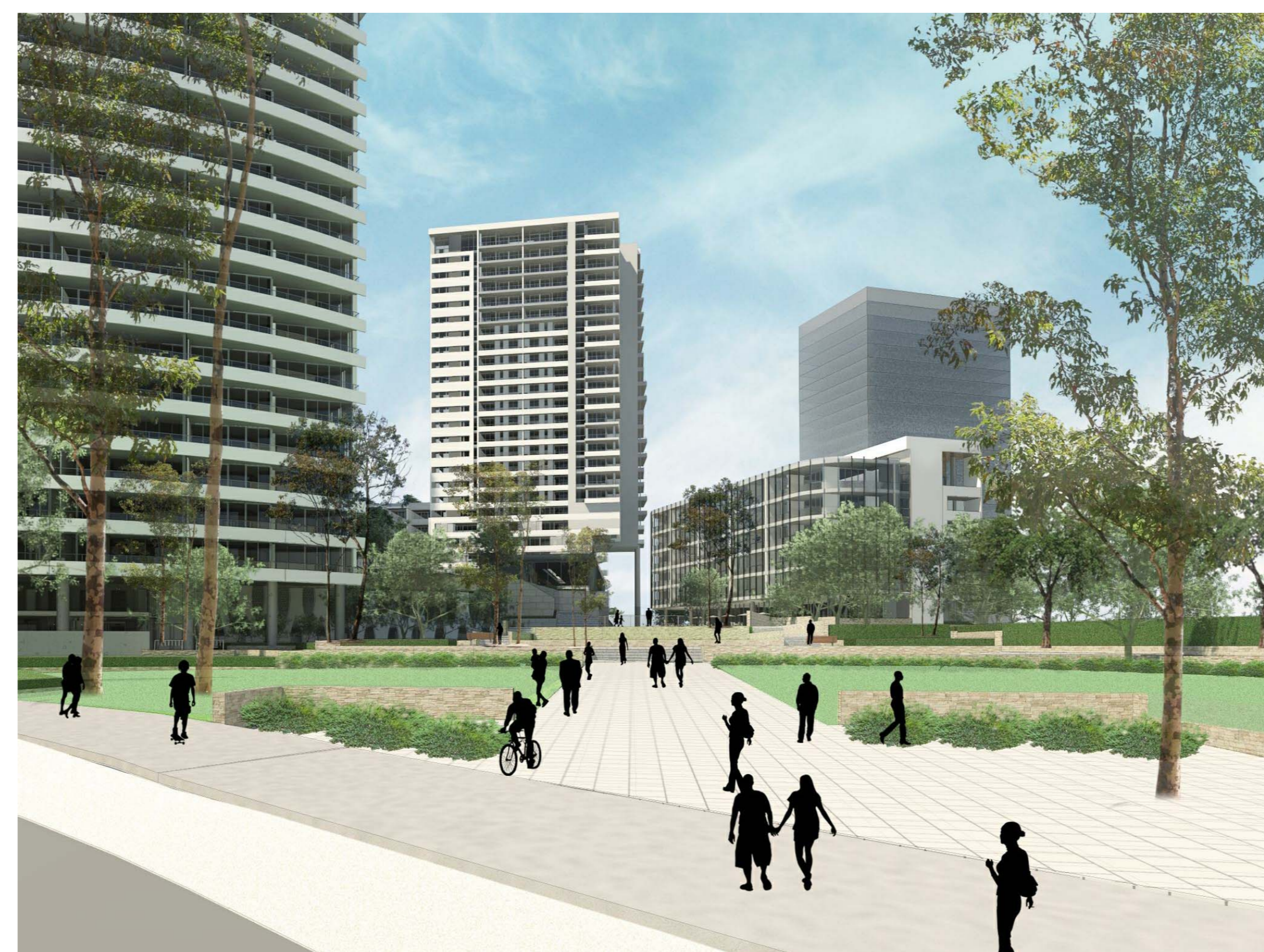
6. Shoreline Ave Pedestrian Link and Public open Space