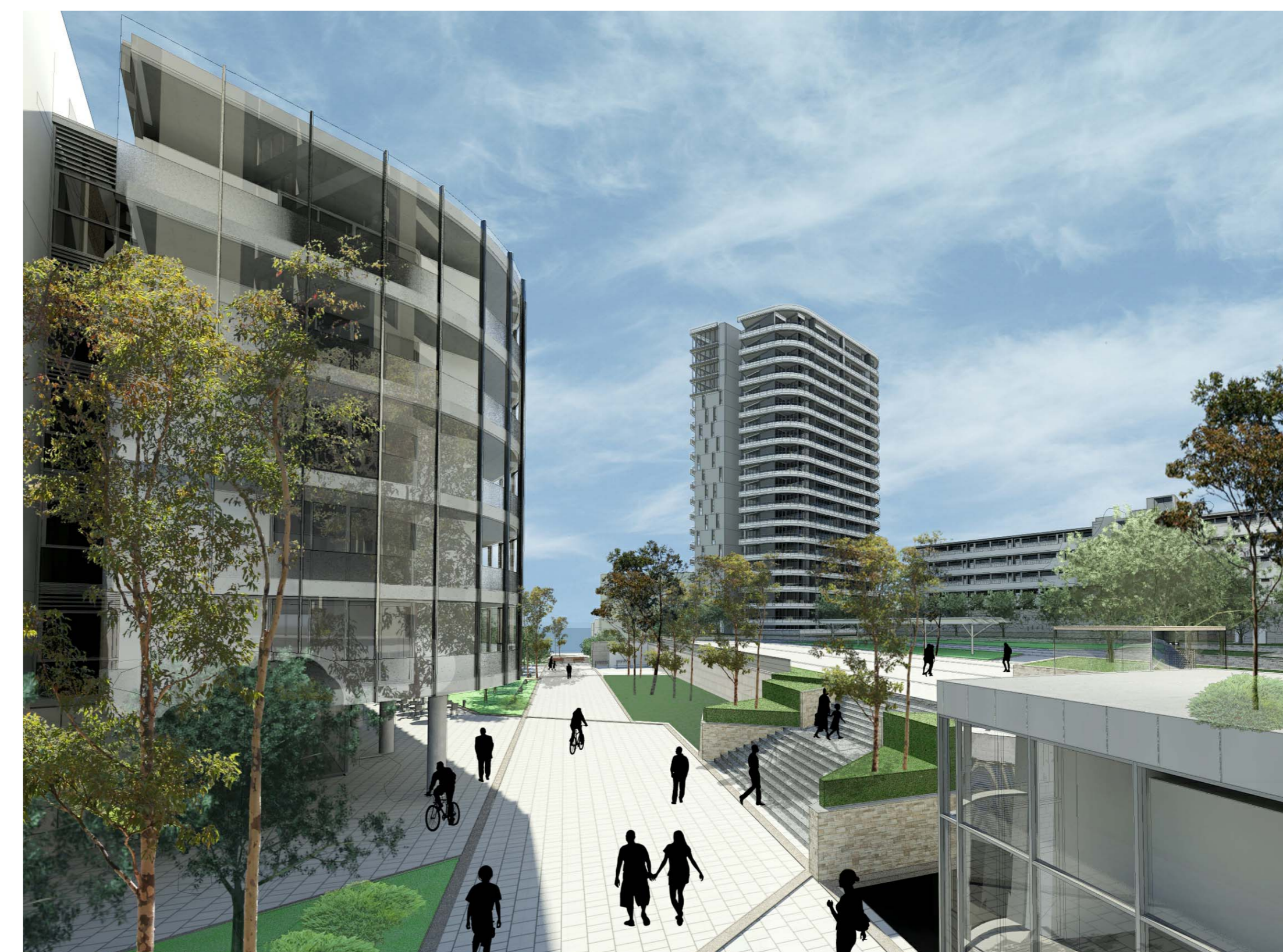
7. Pedestrian Link and public open space Looking West