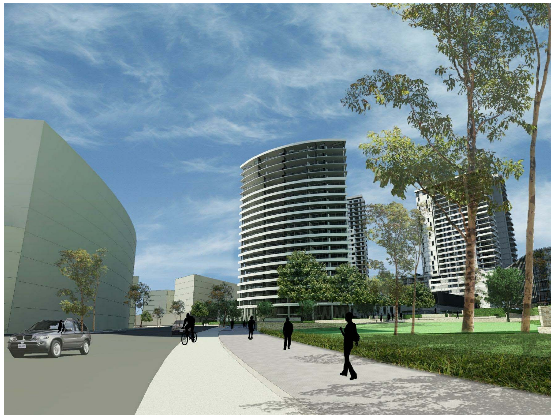
5. Shoreline Ave Looking onto Public open space