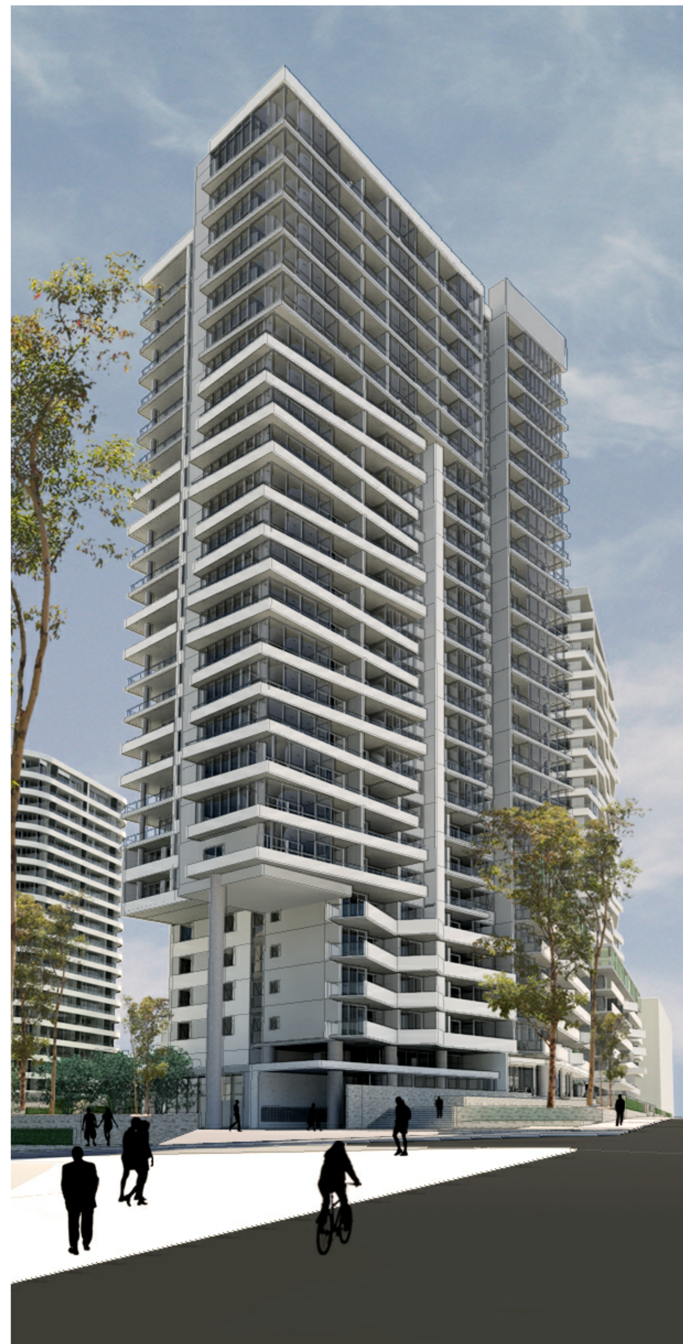
1. Walker Street and Gauthorpe Ave Looking North