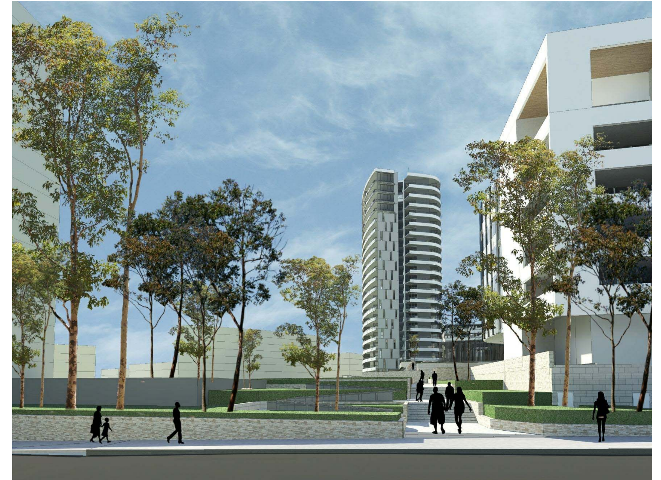
4. Gauthorpe Street Looking towards Public Open Space

NOTE: PUBLIC FACILITY AND PUBLIC OPEN SPACE, WILL BE SUBJECT TO A SEPERATE D.A