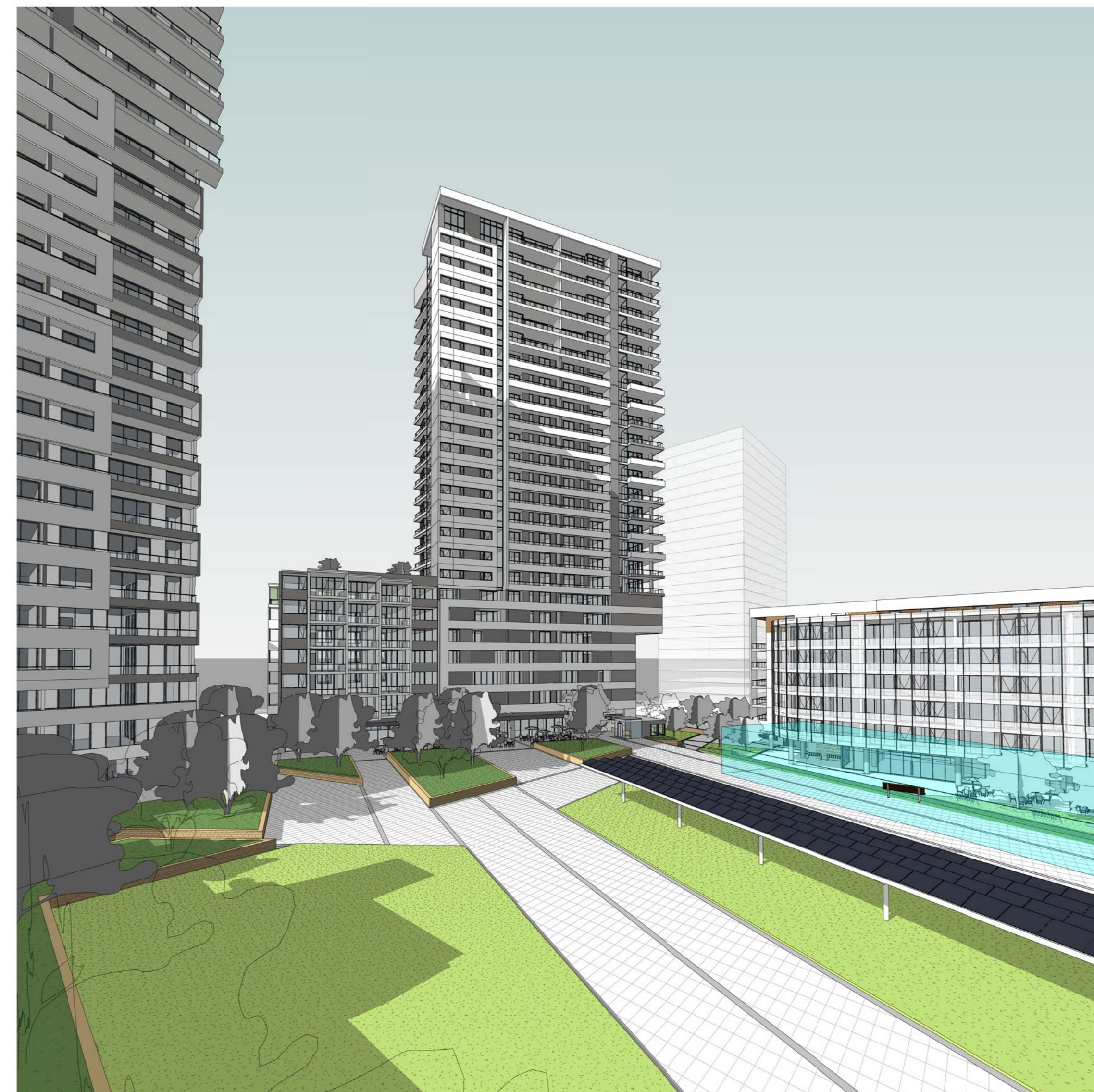
View of Public Park looking towards building D

In accepting and utilizing this document the recipient agrees that SJB Architects (NSW) Pty. Ltd. ACN 081 094 724 SJB Architects, retain all common law, statutory law and other rights including copyright and intellectual property rights. The recipient agrees not to use this document for any purpose other than its intended use, to waive all claims against SJB Architects resulting from unauthorised changes, or to reuse the document on other projects without the prior written consent of SJB Architects. Under no circumstances shall transfer of this document be deemed a sale. SJB Architects makes no warranties of fitness for any purpose.