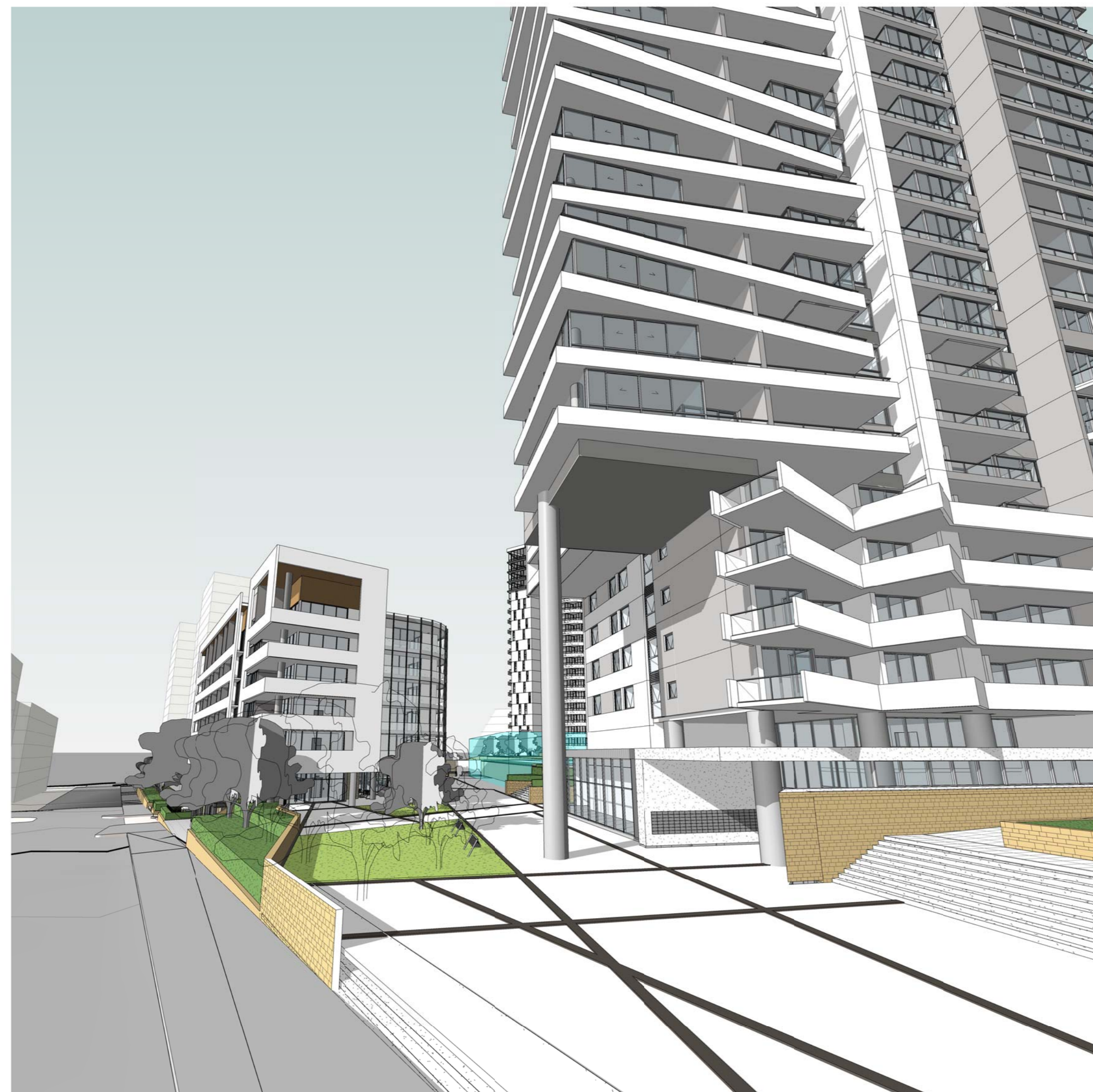
View of Public Link from Corner of Gauthorpe & Walker Street