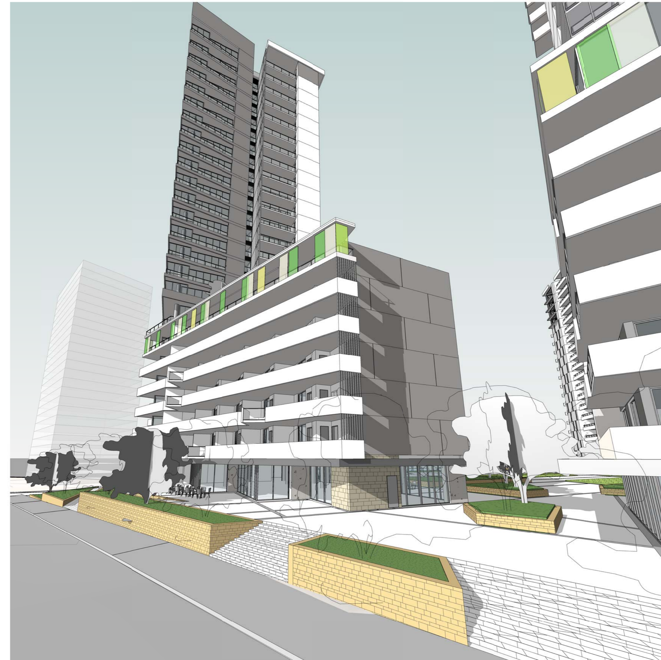
View from Walker Street looking towards public park entry