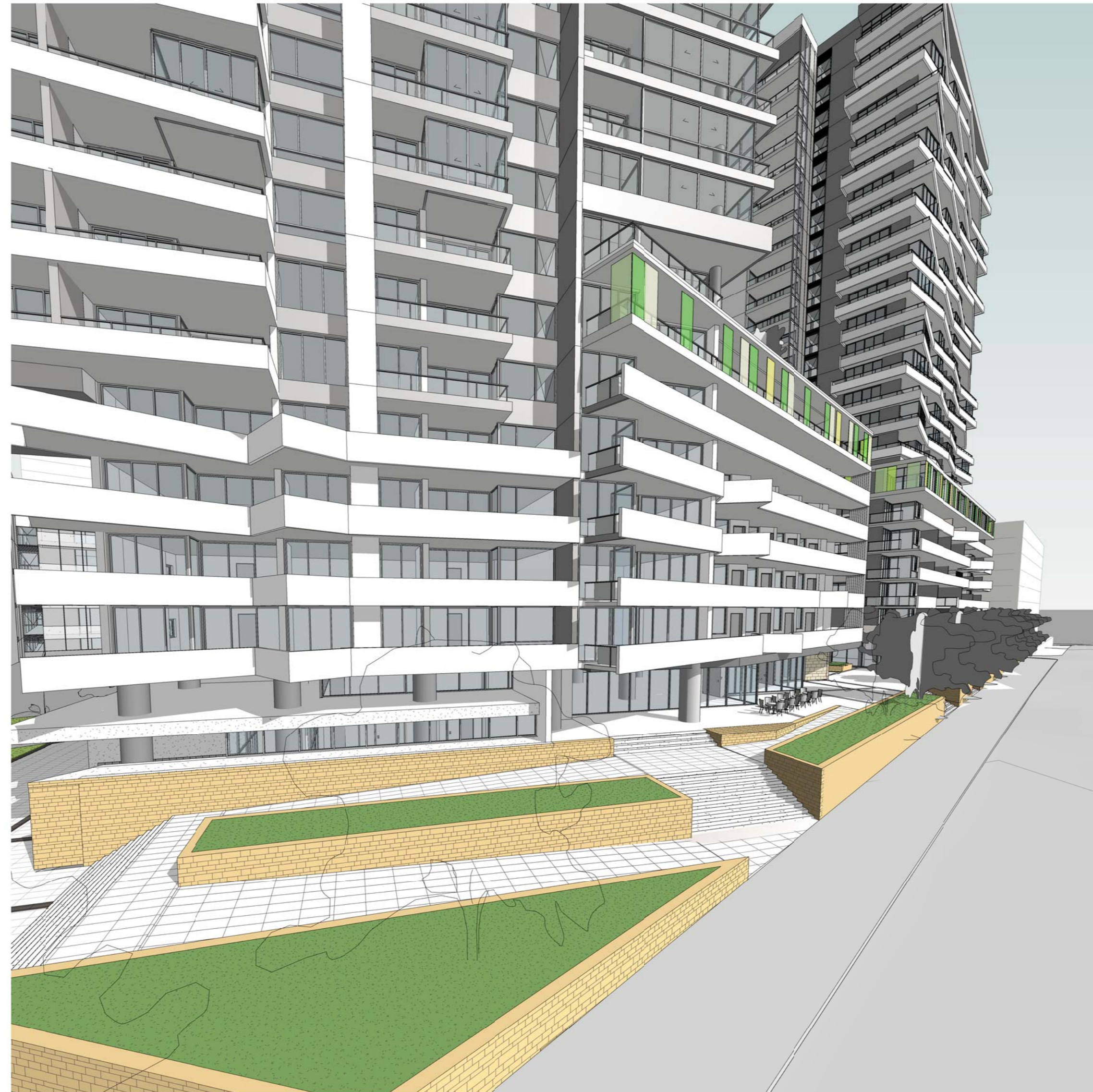
View of Walker street Retail