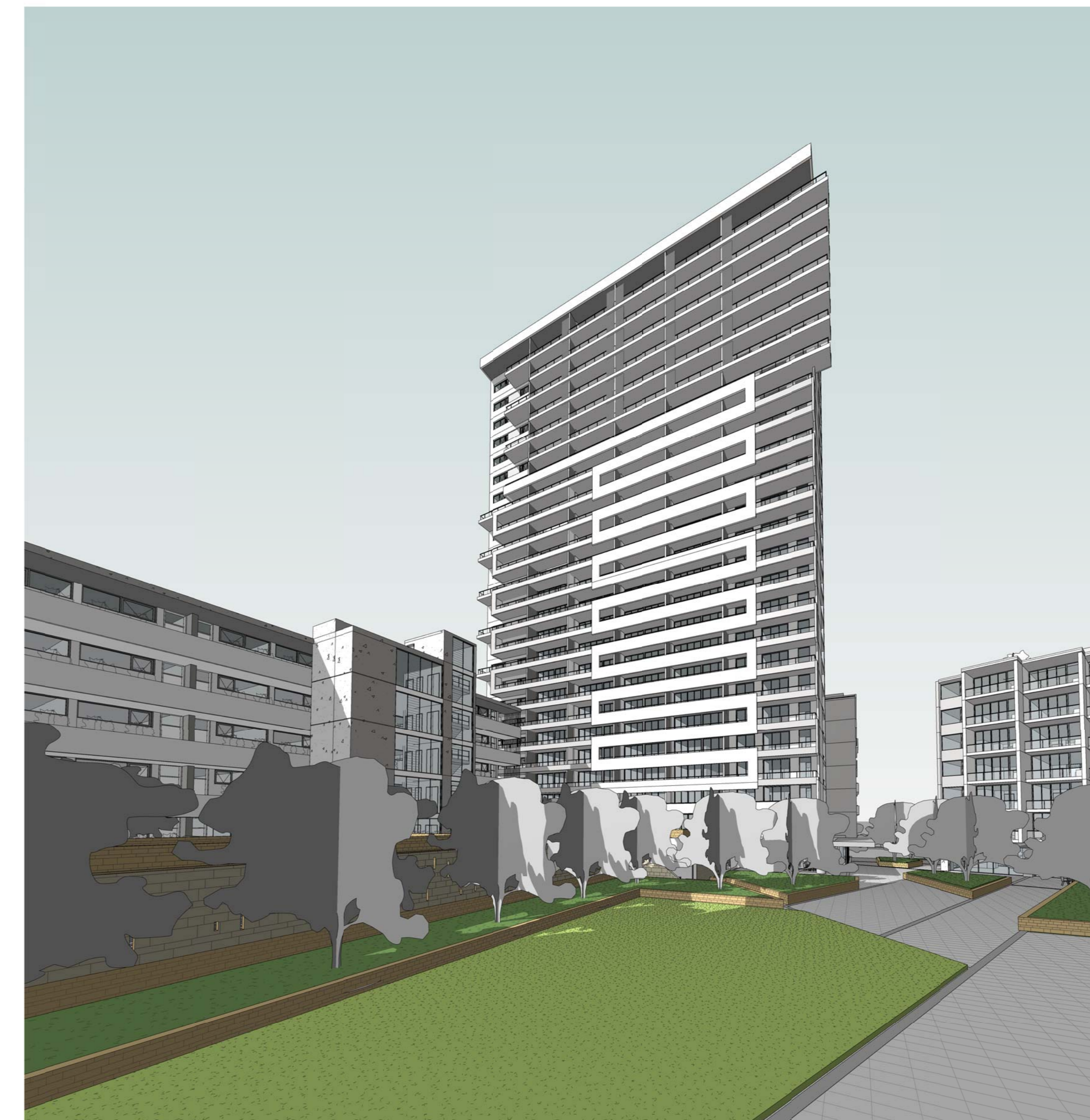
View of the podium Public open space