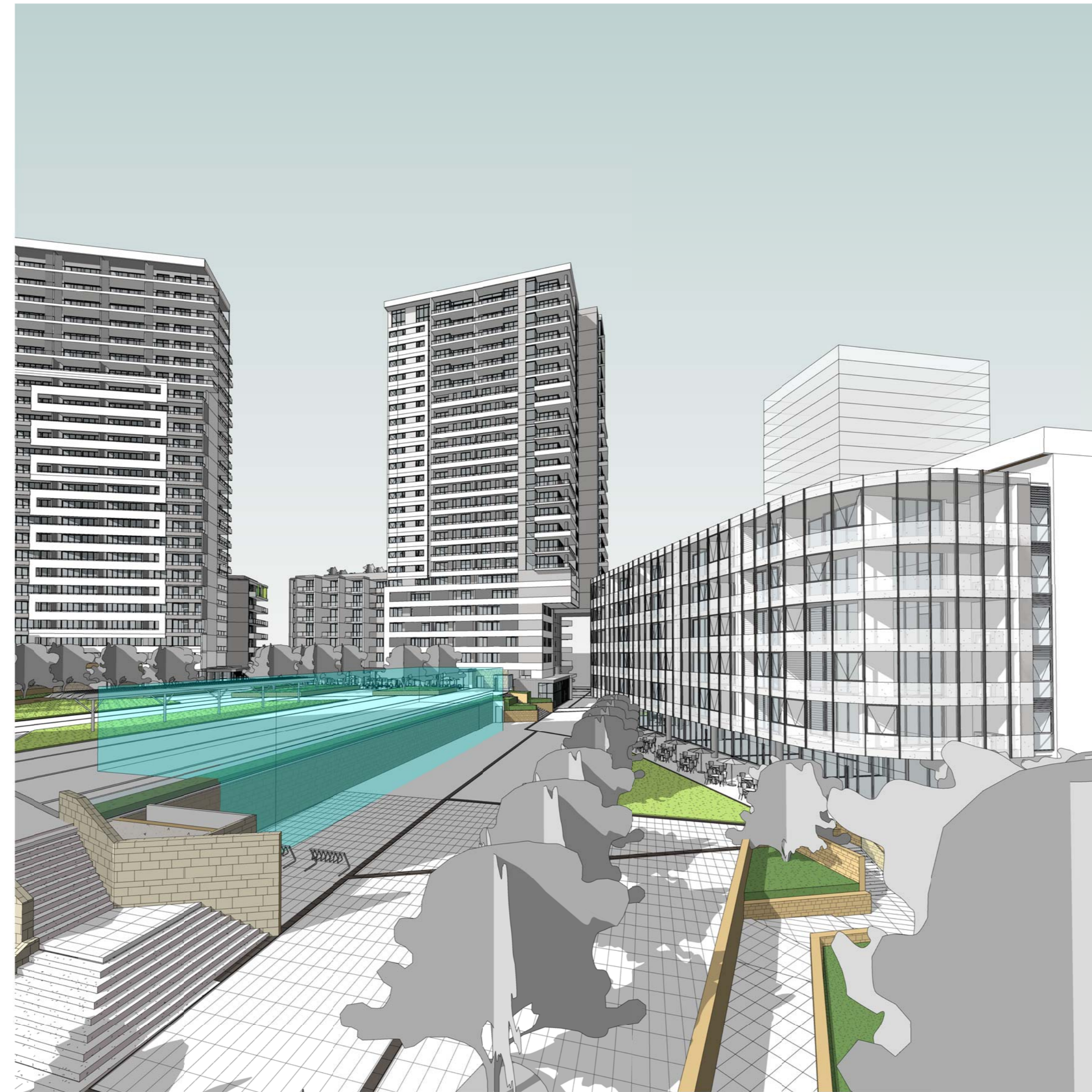
View of public Park looking towards the pedestrian site link