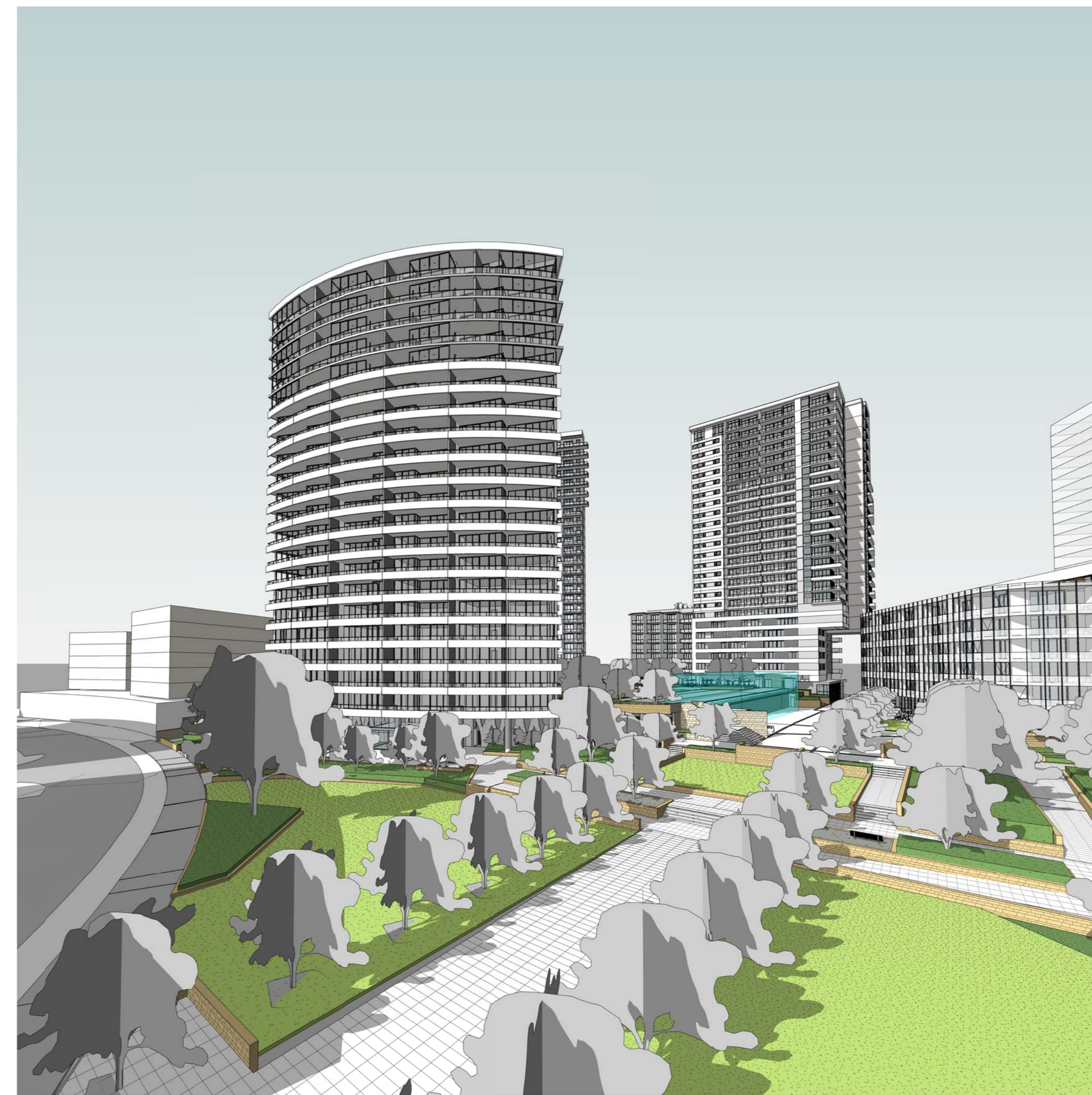
View of public Park looking towards the pedestrian site link