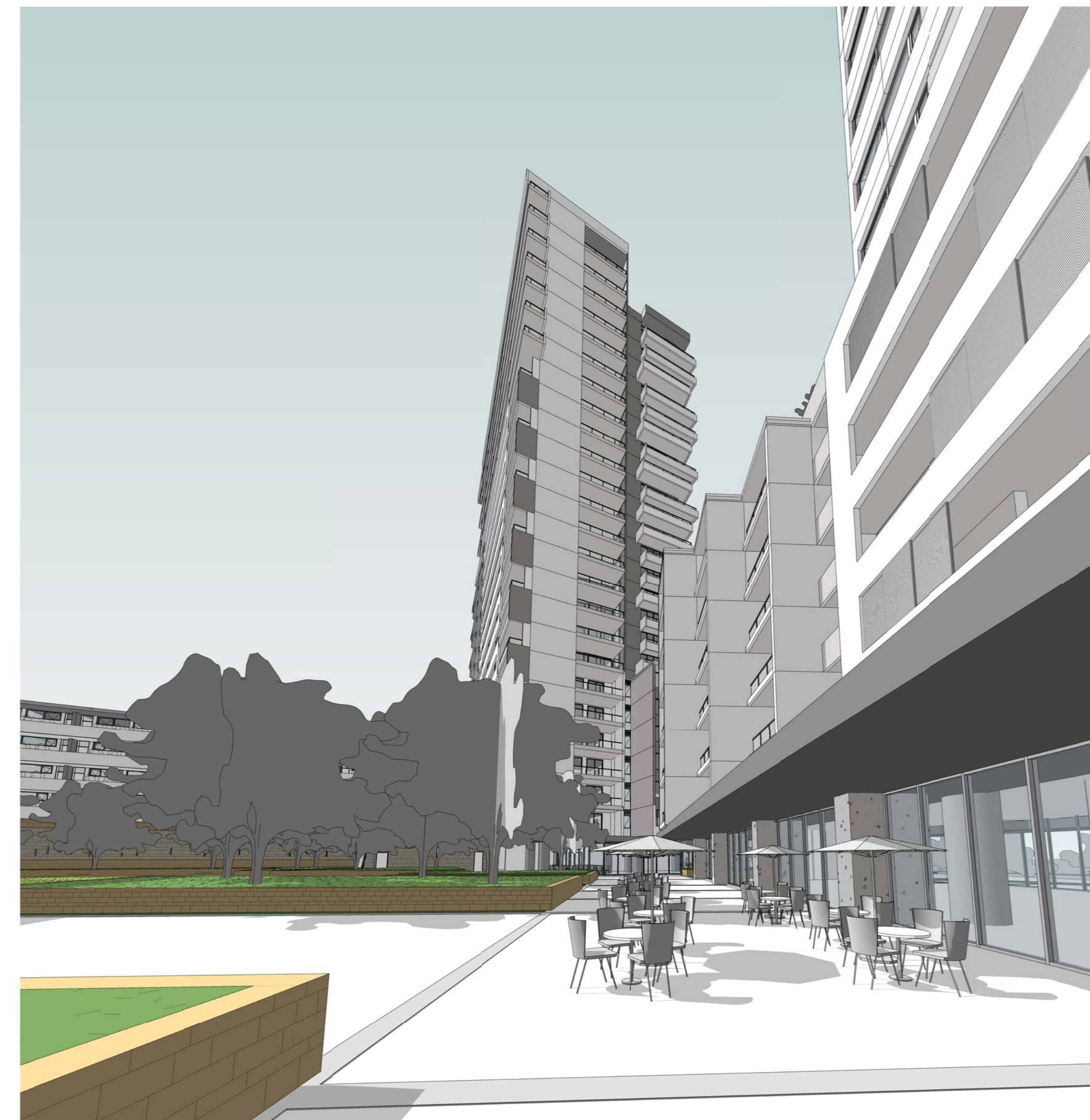
View of the outdoor seating Area on the podium level