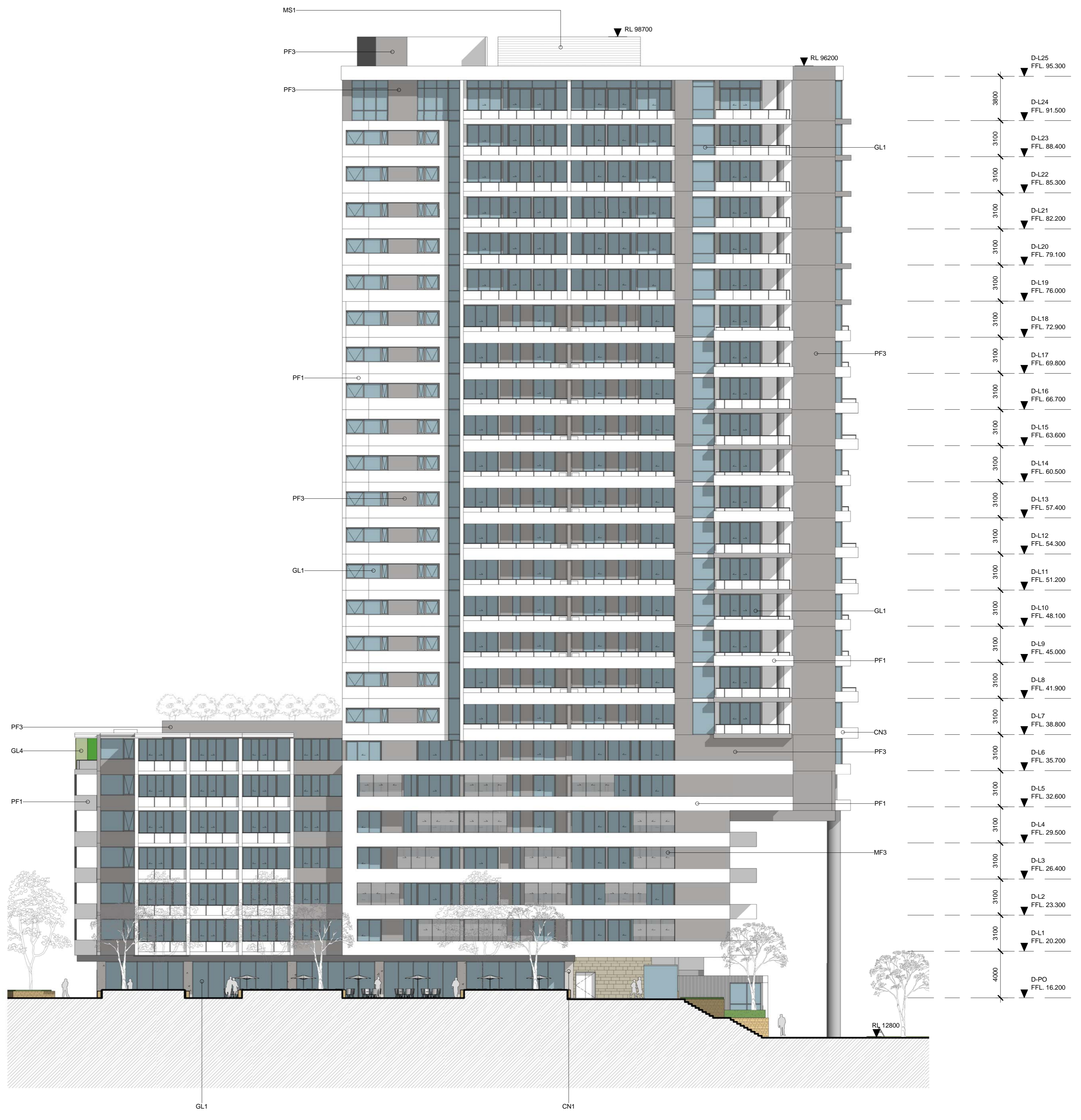
2 ELEVATION BLDG D - WEST 1 : 200