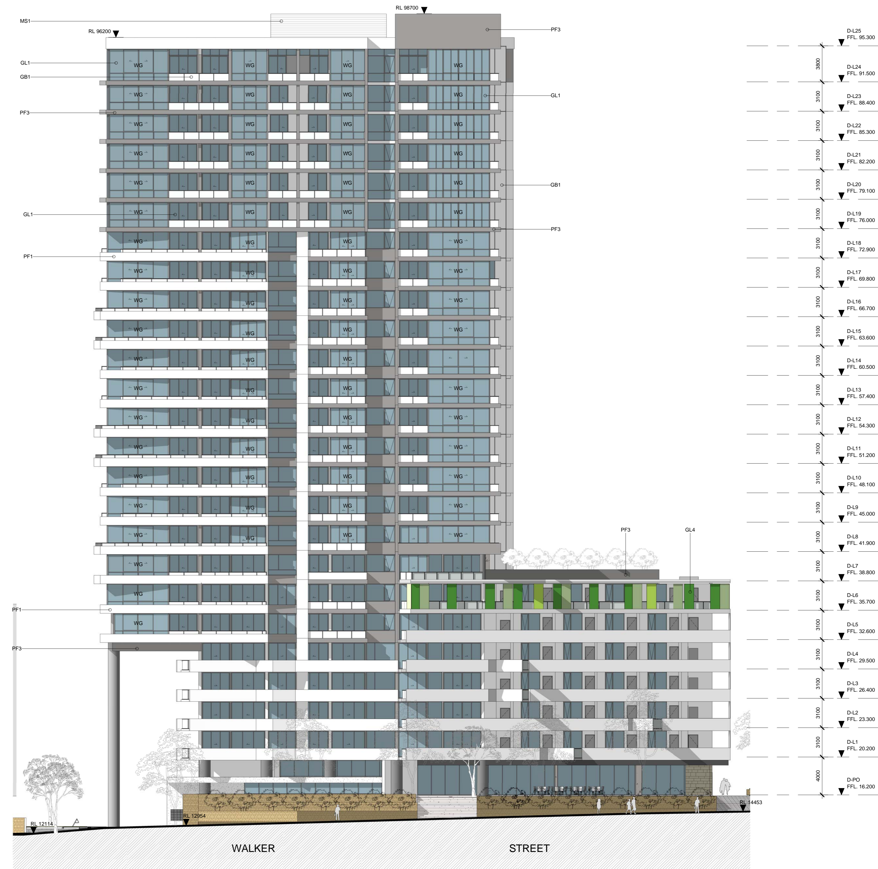
2 ELEVATION BLDG D - EAST 1 : 200