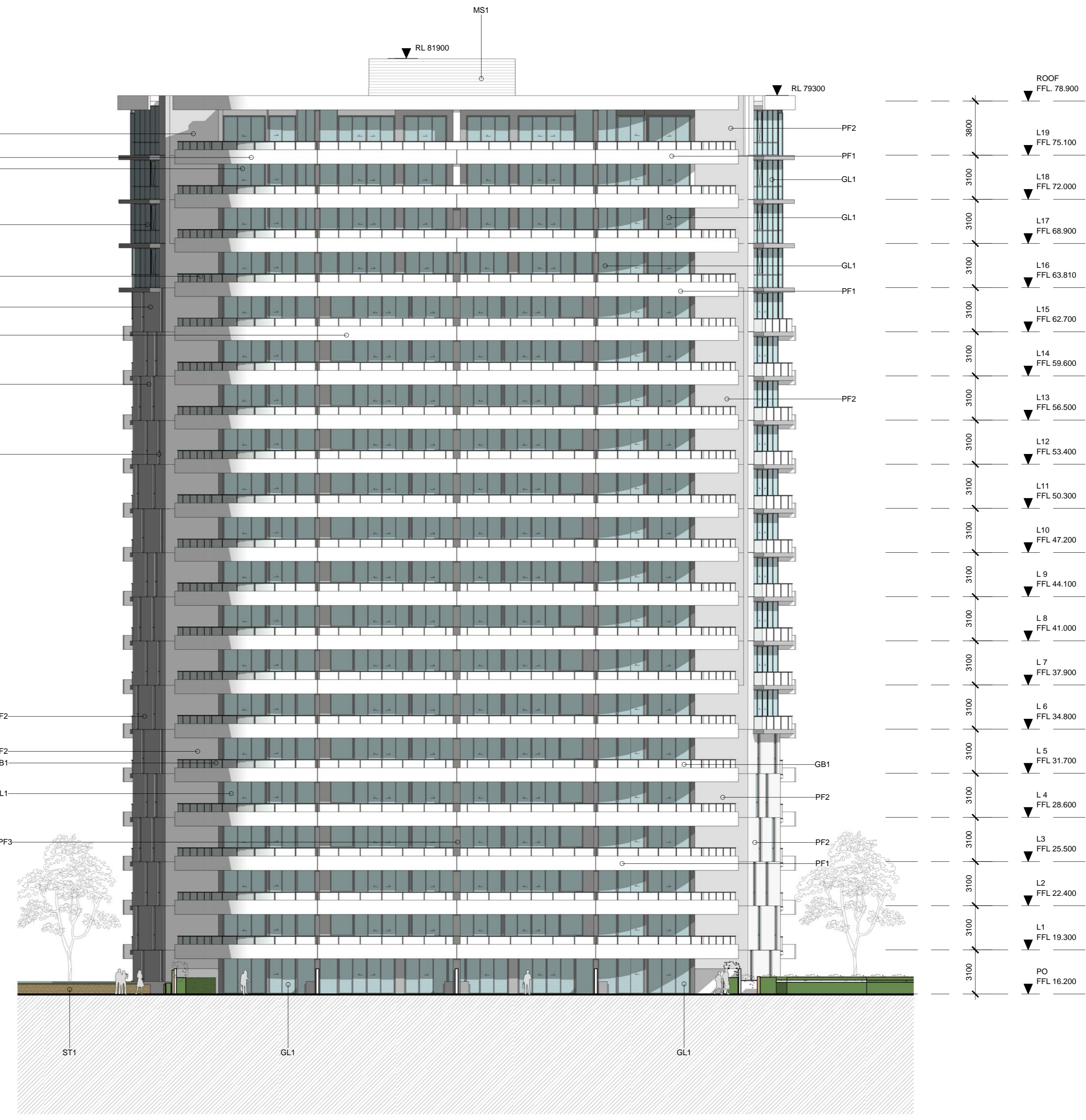
1 ELEVATION A-0201 BLDG C - EAST 1 : 200