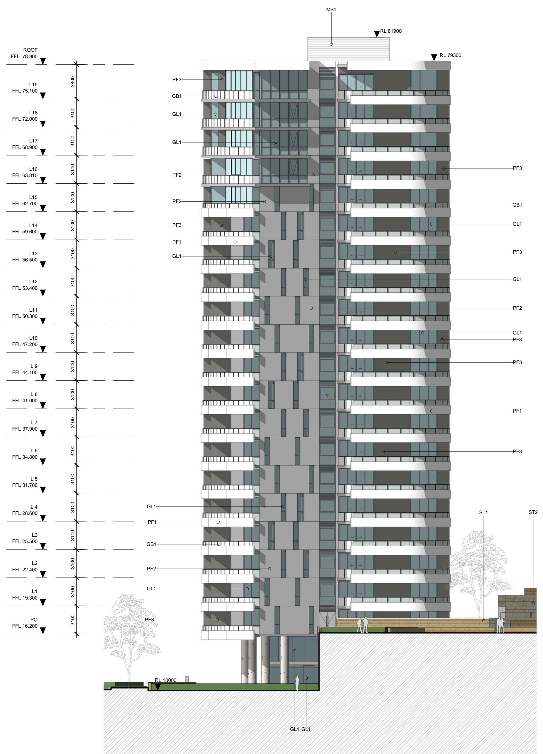
2 ELEVATION A-0201 BLDG C - SOUTH 1 : 200