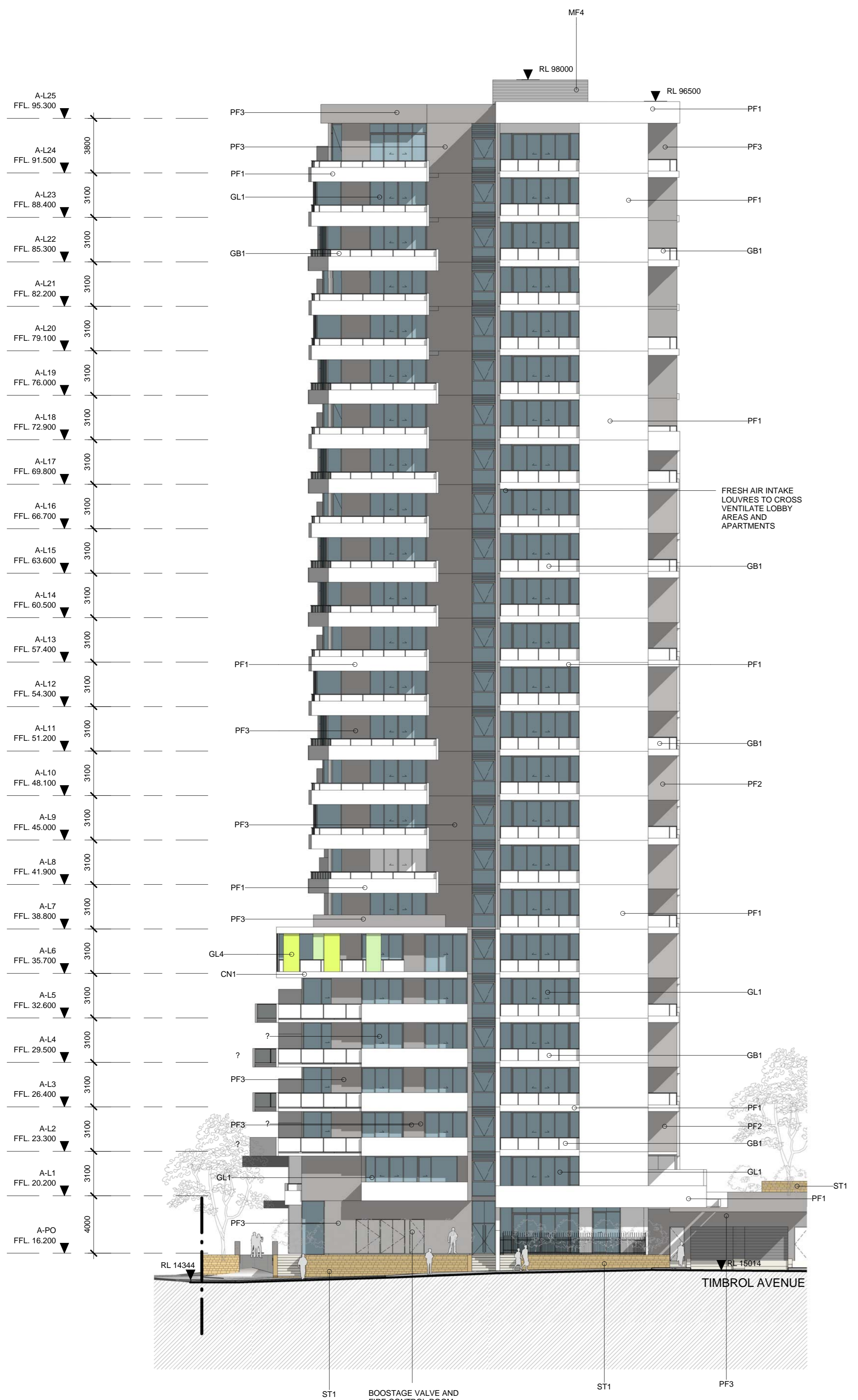
1 ELEVATION BLDG A - NORTH 1:200